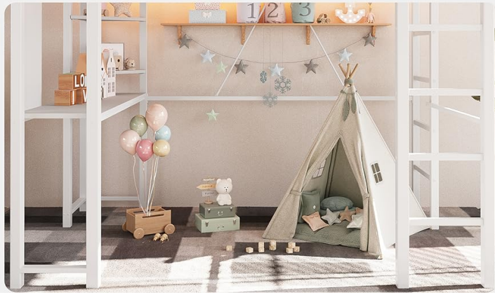
Image 5.2: The under-bed area with the integrated desk and triangular storage racks, designed for study or organization.

Underbed Space is ideal small space for versatile style and help you optimize room layout.