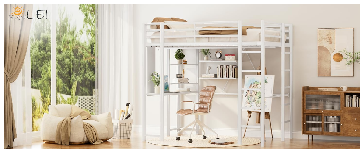
Image 5.1: The loft bed features two built-in ladders for convenient access from either side.