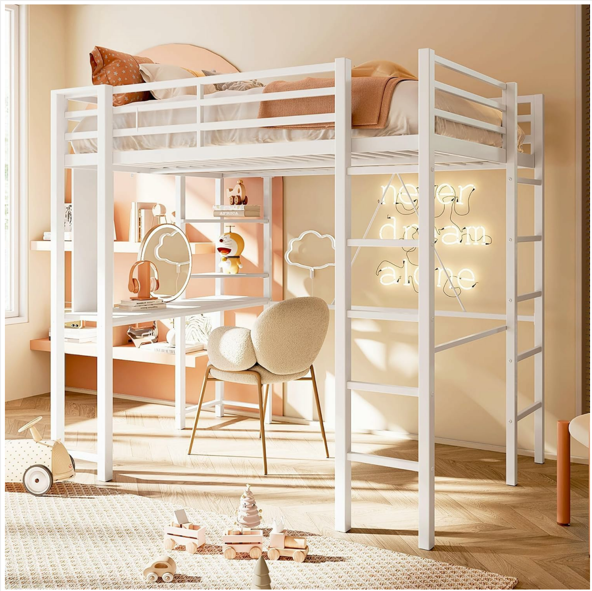
Image 1.1: The SUNLEI Metal Twin Loft Bed with Desk, featuring a matte white finish, integrated desk, and two built-in ladders.