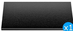
Removable Shelf x1