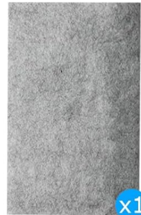
Floor Mat x1

Image: A visual representation of the items included in the Bonsai Large Safe Box package, such as the safe, shelf support pegs, expansion bolts, removable shelf, emergency keys, user manual, and floor mat.