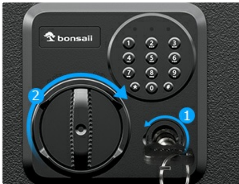
Image: A hand demonstrating the use of the emergency key to unlock and open the safe, with the key inserted and turned.