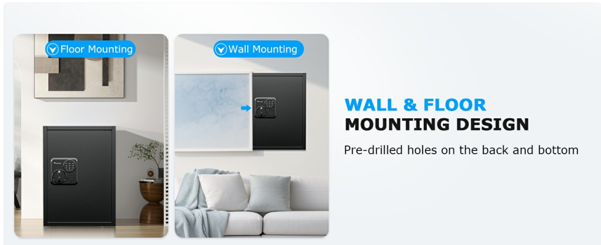
Image: Illustrations showing the Bonsai safe mounted to a wall and placed on the floor, highlighting the pre-drilled holes for secure installation.