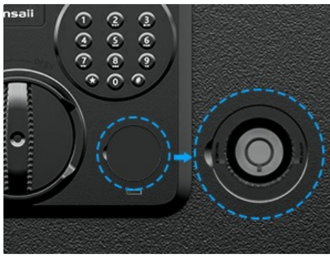
Image: A close-up of the safe's electronic keypad, showing the location of the emergency keyhole cover.