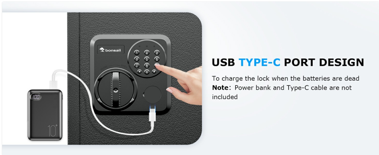
Image: A close-up of the safe's keypad, showing the USB Type-C port where an external power bank can be connected to provide temporary power if the internal batteries are dead.