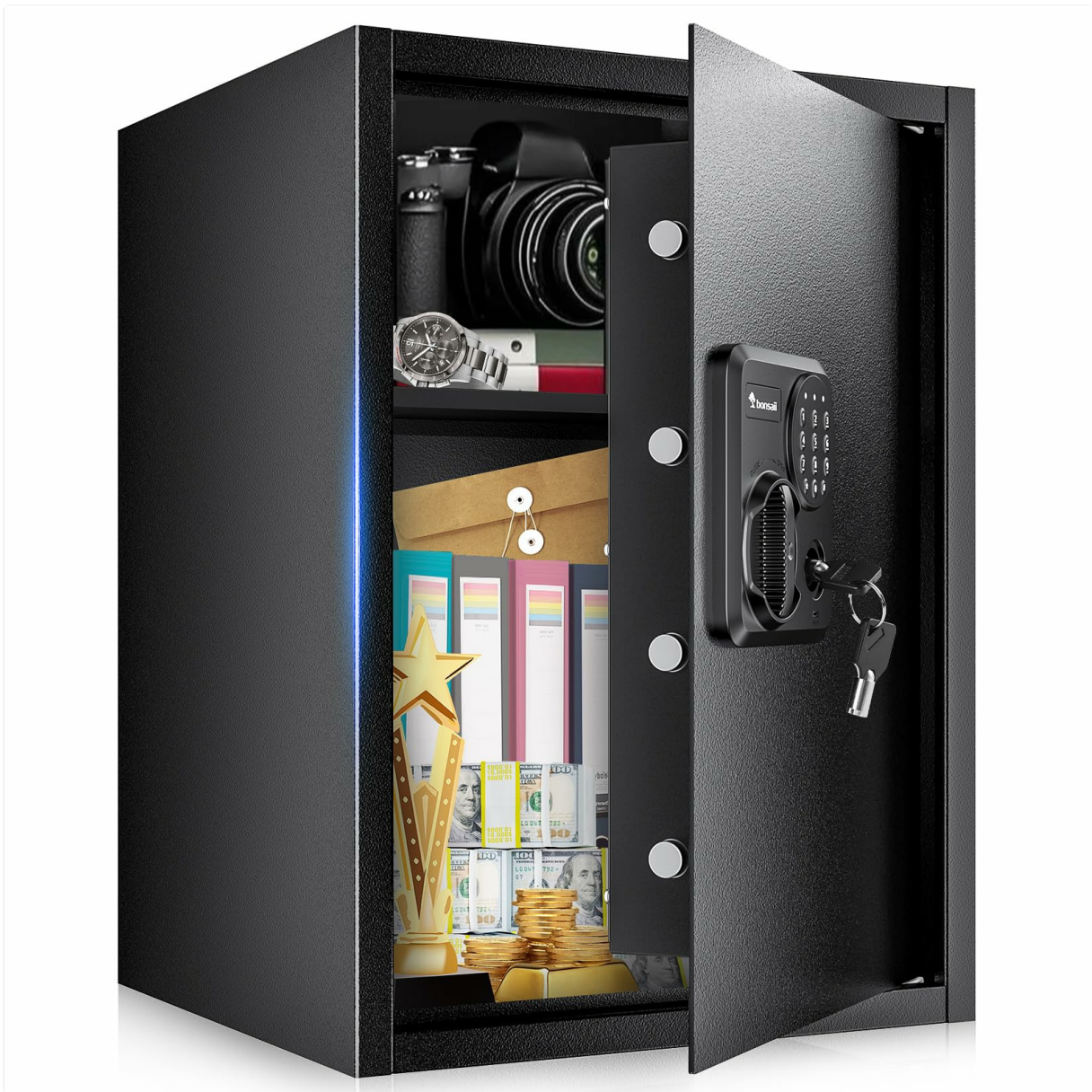
Image: The Bonsai Large Safe Box SF007, a black steel safe with an electronic keypad and a Bonsai logo.