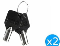
Emergency Keys x2