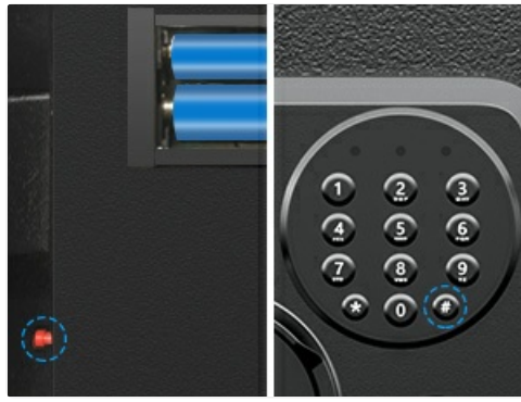
Image: A close-up of the safe's keypad, highlighting the red indicator light that signals low battery power.