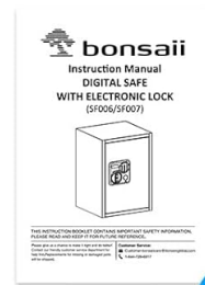
User Manual x1