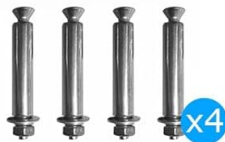
Expansion Bolts x4