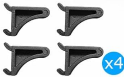
Shelf Support Pegs x4