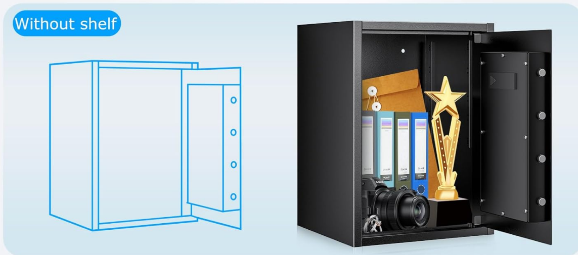
Image: The interior of the Bonsai safe, demonstrating how the removable shelf can be used to organize items, with a diagram showing the safe's capacity with and without the shelf.