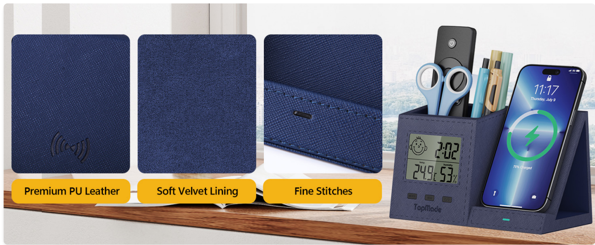
Image 4.3: Digital display showing time, temperature, and humidity with control buttons.