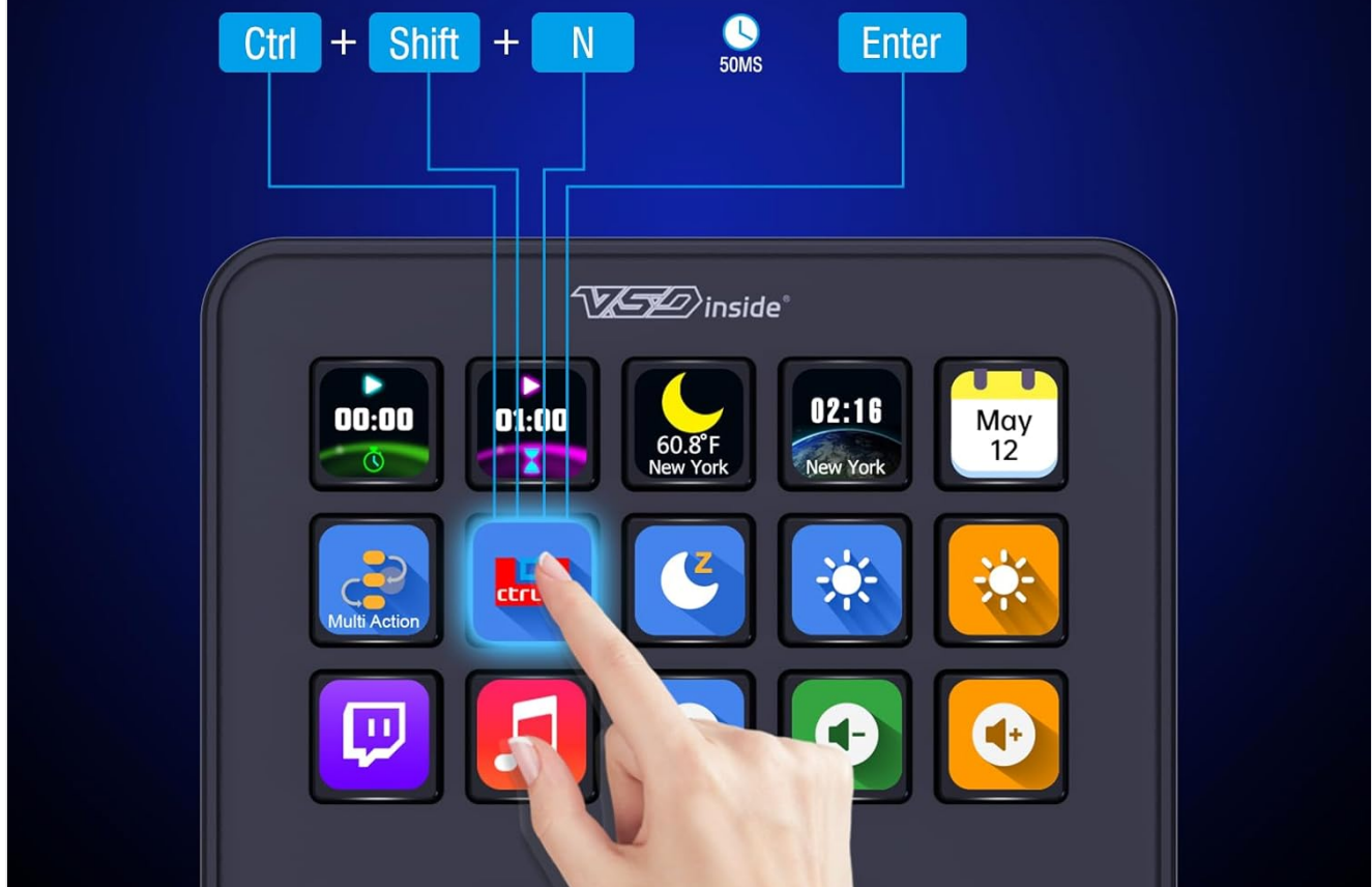
Image: A close-up of the VSDINSIDE Macro Keypad's LCD keys, illustrating how a single button press can trigger a sequence of commands like Ctrl + Shift + N, followed by a 50ms delay, then Enter.

One-Touch Automation: Press a single button to trigger one or multiple shortcut commands in an instant.