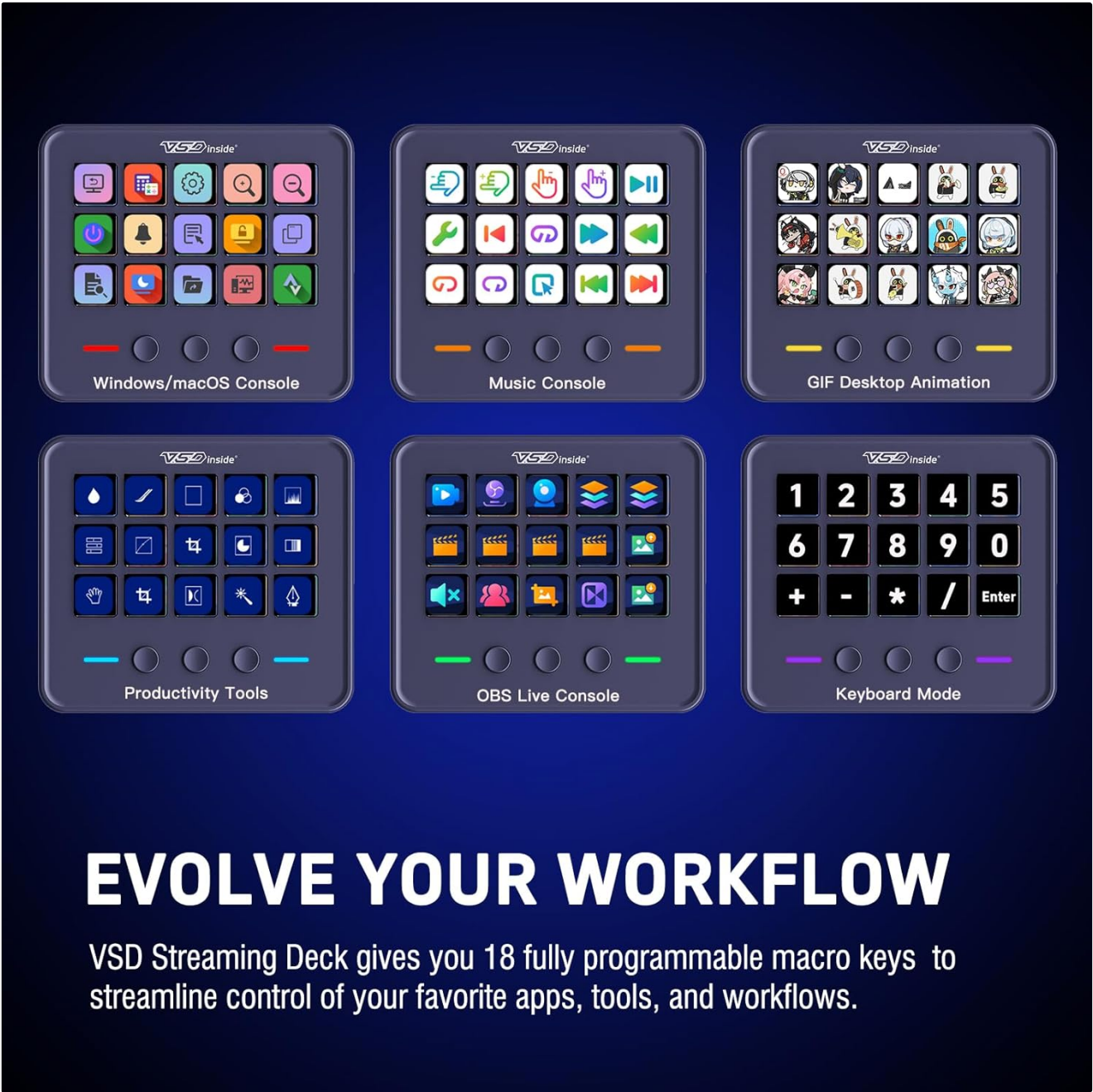
Image: The VSDINSIDE Macro Keypad showcasing different workflow configurations, including consoles for Windows/macOS, music production, GIF desktop animation, productivity tools, OBS live streaming, and a numeric keyboard mode.

to quickly switch between sets of customized commands.