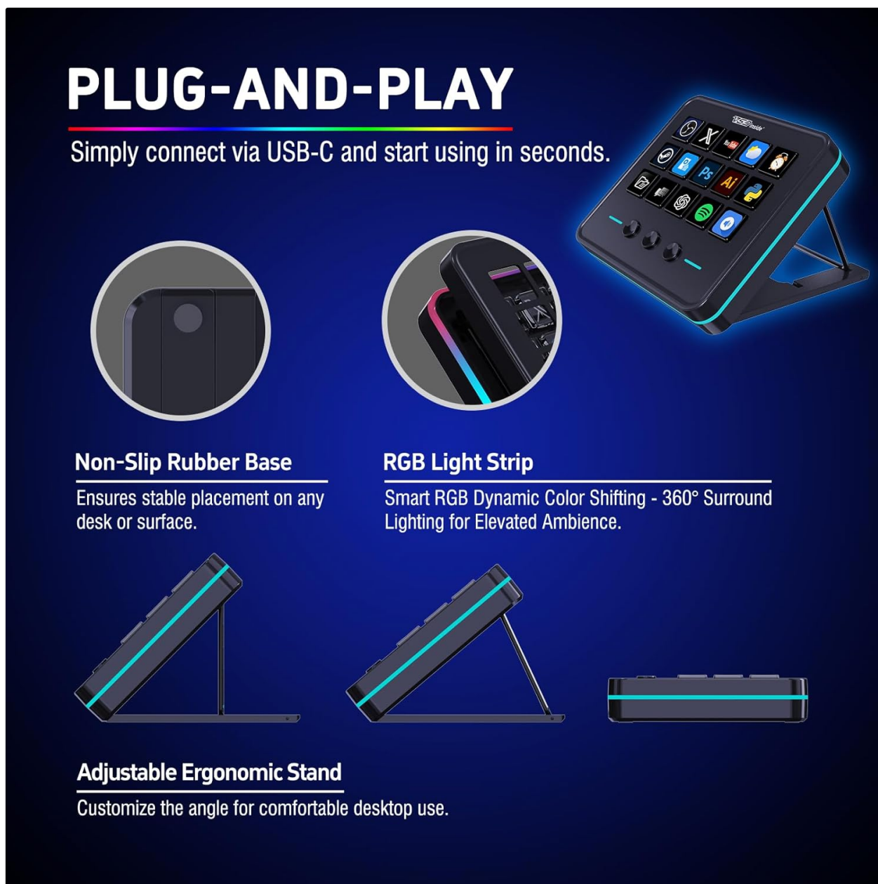
Image: The VSDINSIDE Macro Keypad showing its adjustable stand and USB-C port for connection. The device features a non-slip rubber base for stable placement.