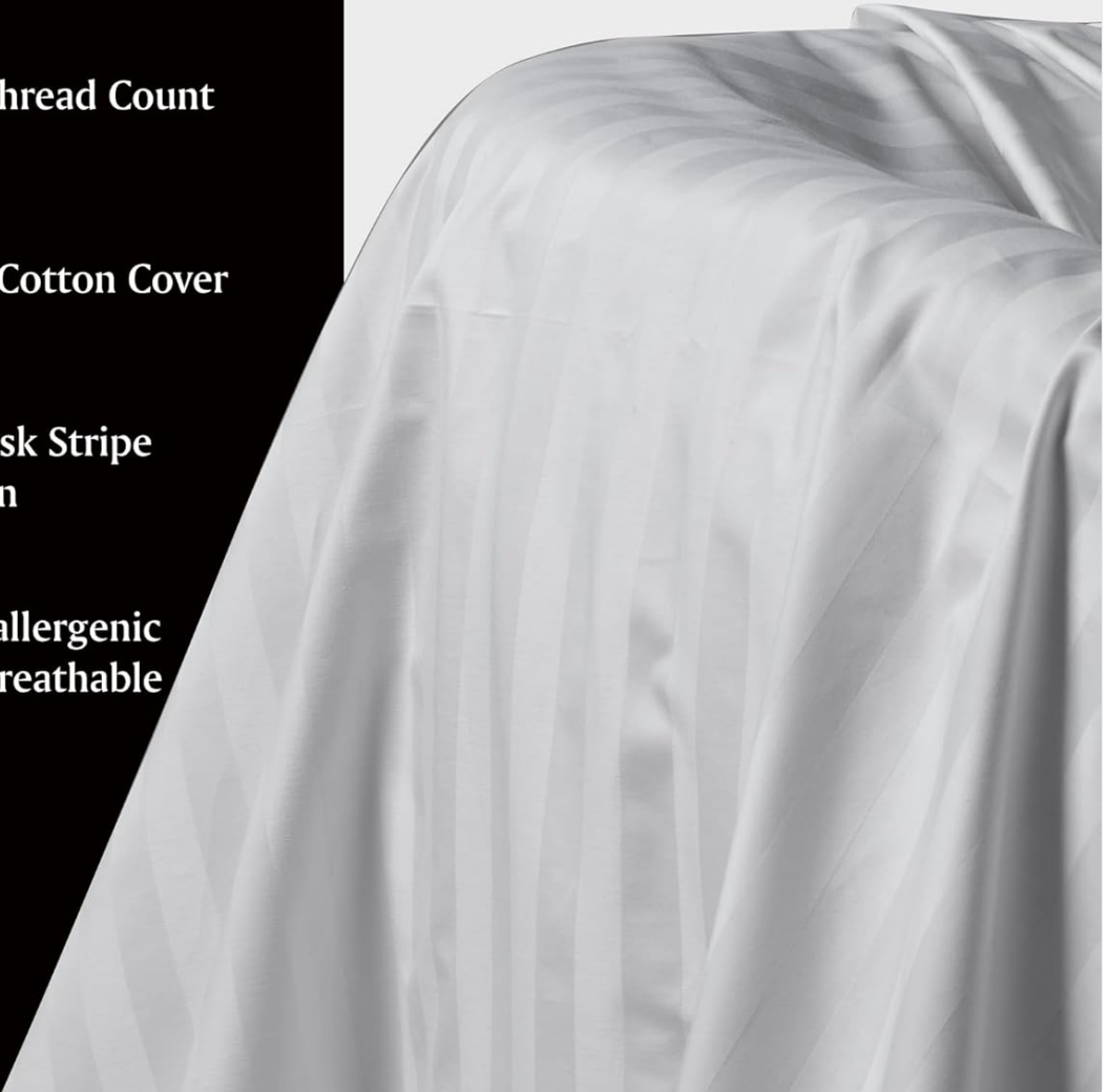
Image: A close-up view of the Beautyrest pillow's side, highlighting the texture of the 500 thread count cotton cover.