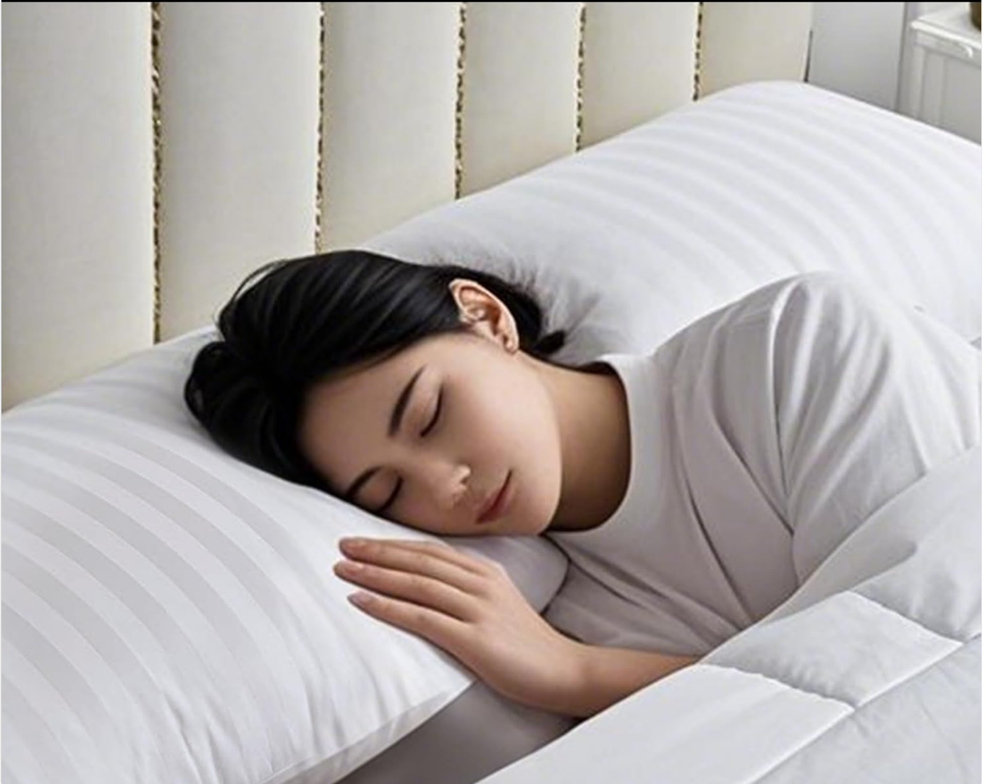
Image: A person sleeping peacefully on a Beautyrest pillow, demonstrating comfortable usage.

Comfortable and Skin-friendly, suitable for any sleeping position.