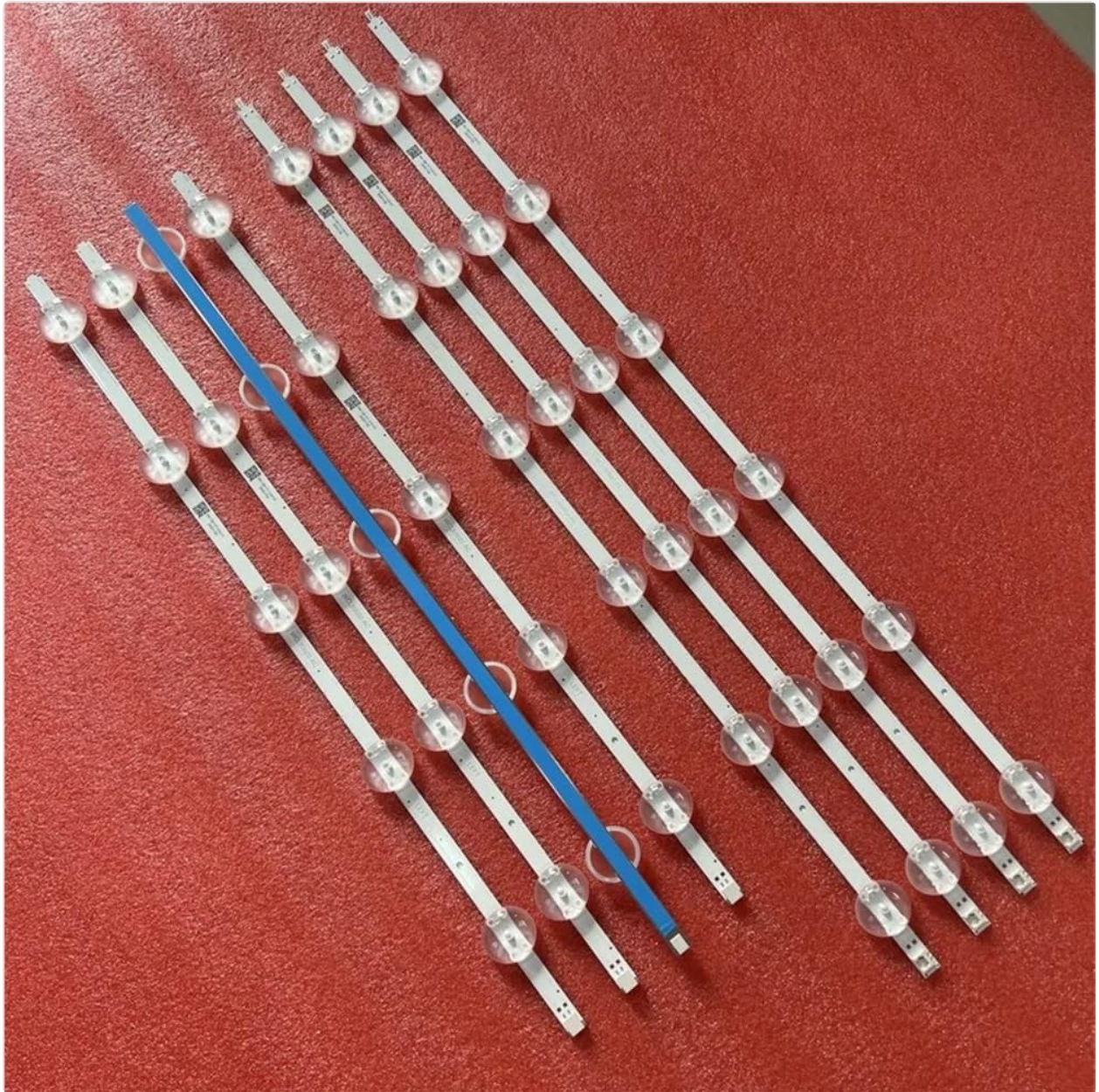
Figure 3.1: Complete set of 8 LED backlight strips.