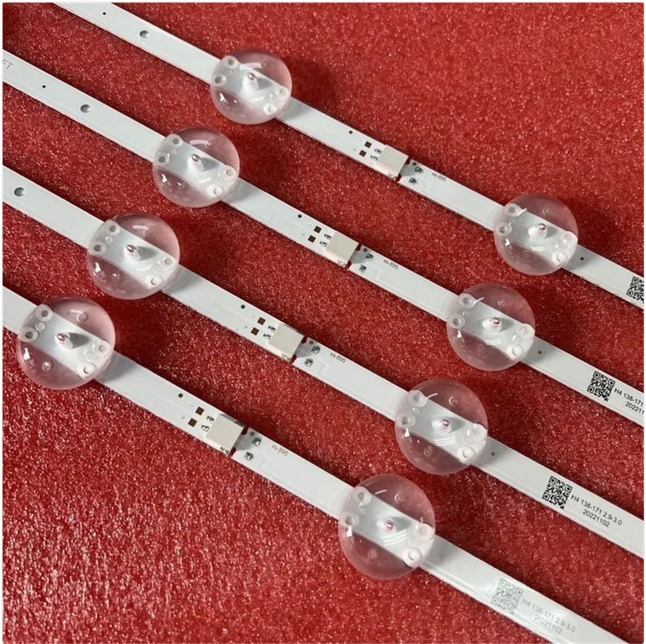
Figure 8.1: Detail of LED components on the strip.