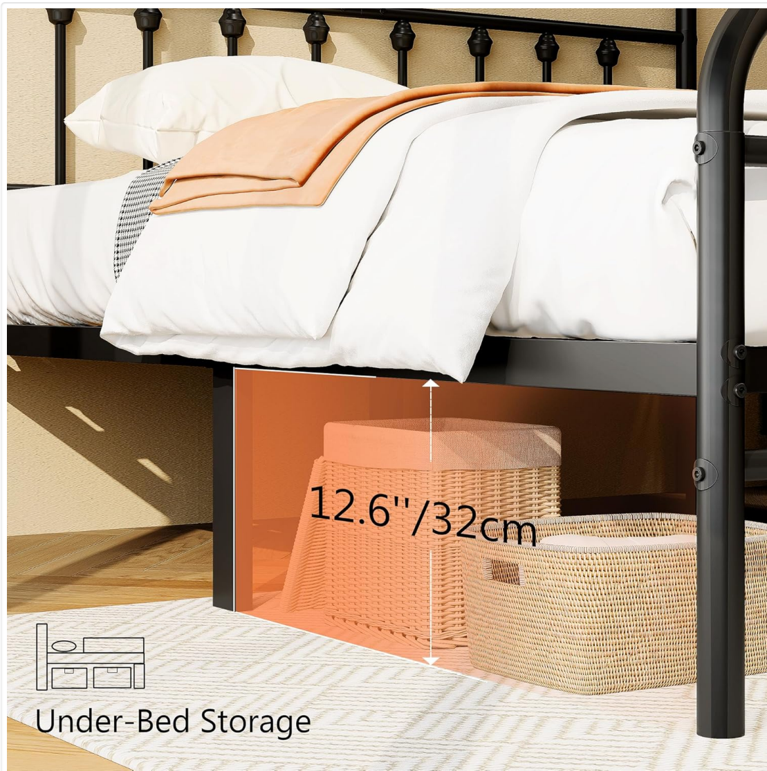
Image: An illustration demonstrating the generous 12.6-inch (32 cm) under-bed storage clearance, with example storage baskets.