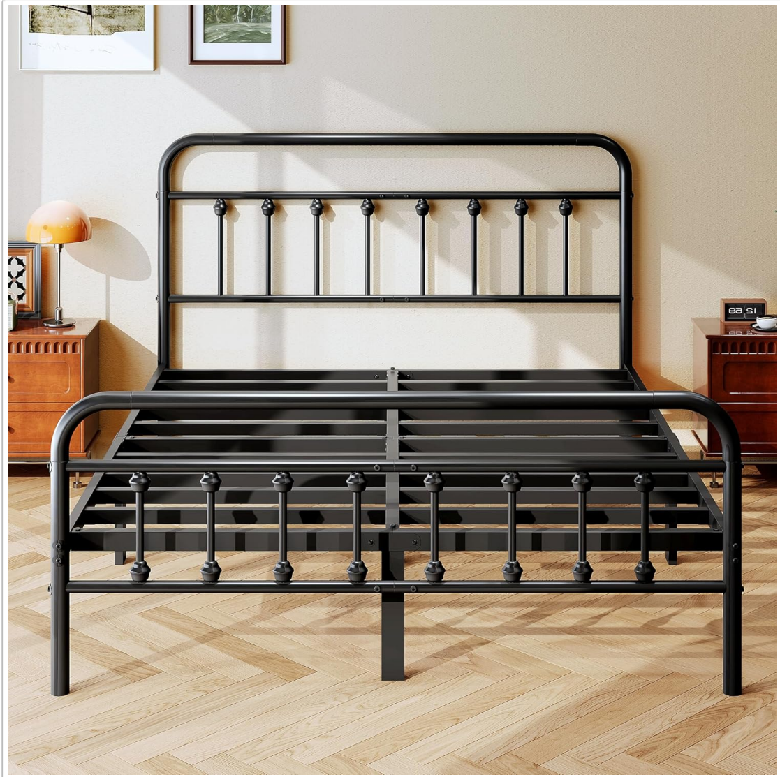
Image: The fully assembled zunatu Queen Size Victorian Metal Platform Bed Frame, shown without a mattress, highlighting its sturdy metal construction and design.