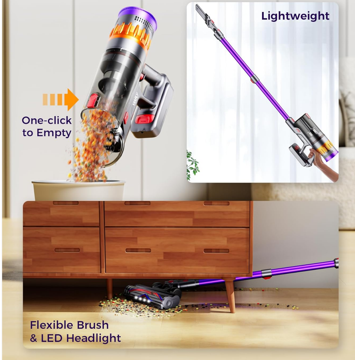
Figure 8: Easy one-click dust cup emptying.