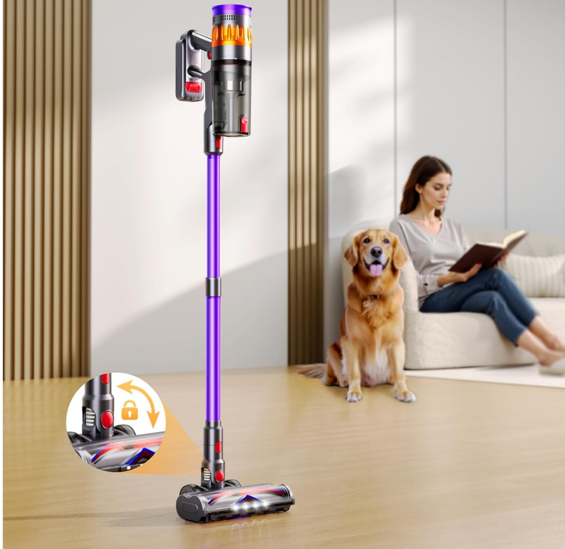
Figure 6: The vacuum's self-standing capability.