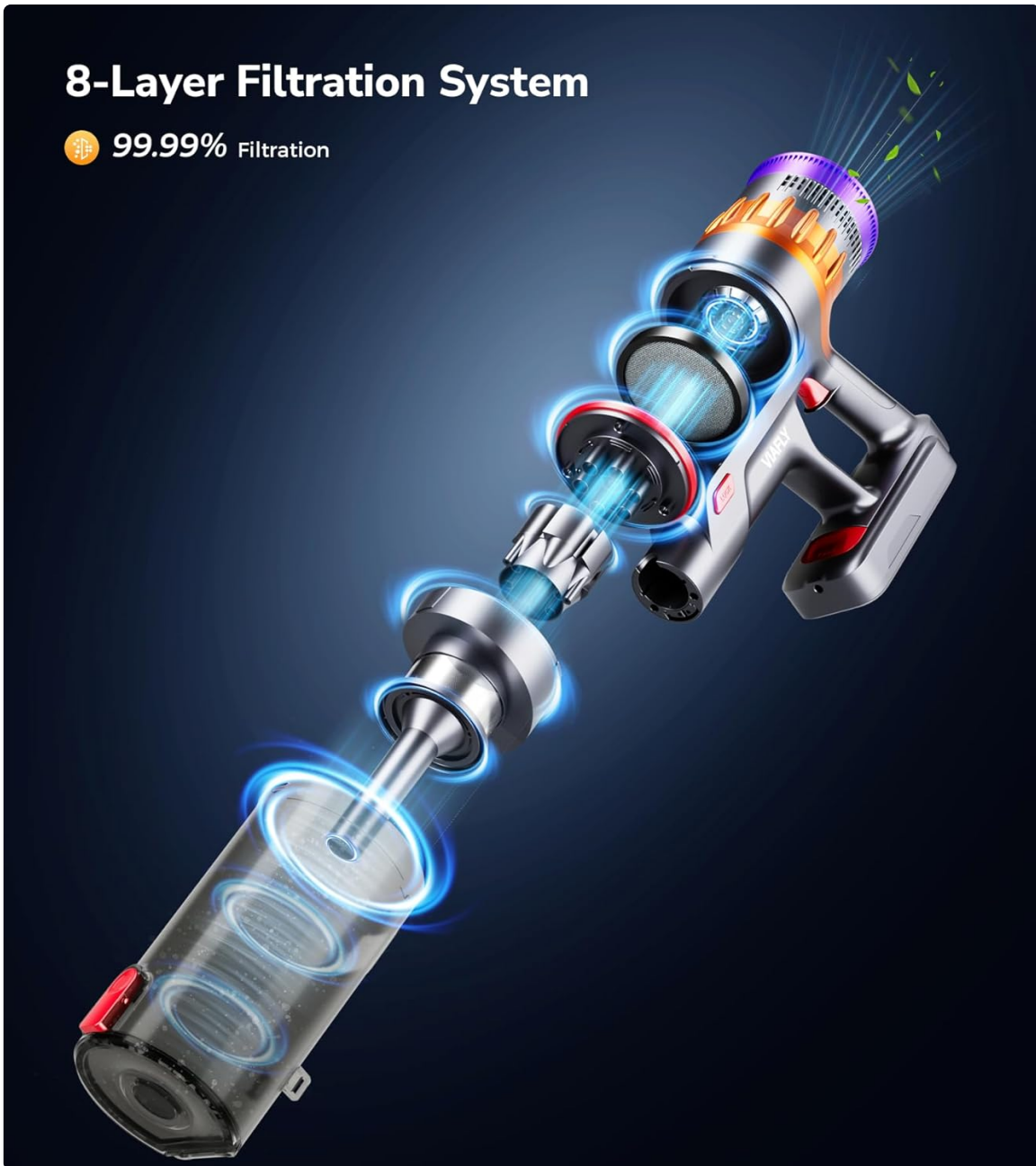
Figure 9: Exploded view of the 8-layer filtration system.