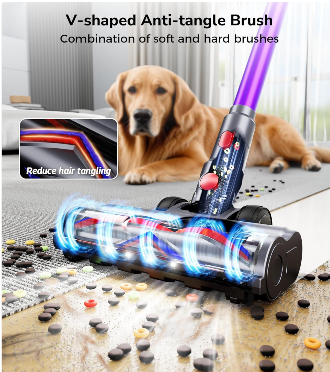
Figure 10: Detail of the anti-tangle brush roll.