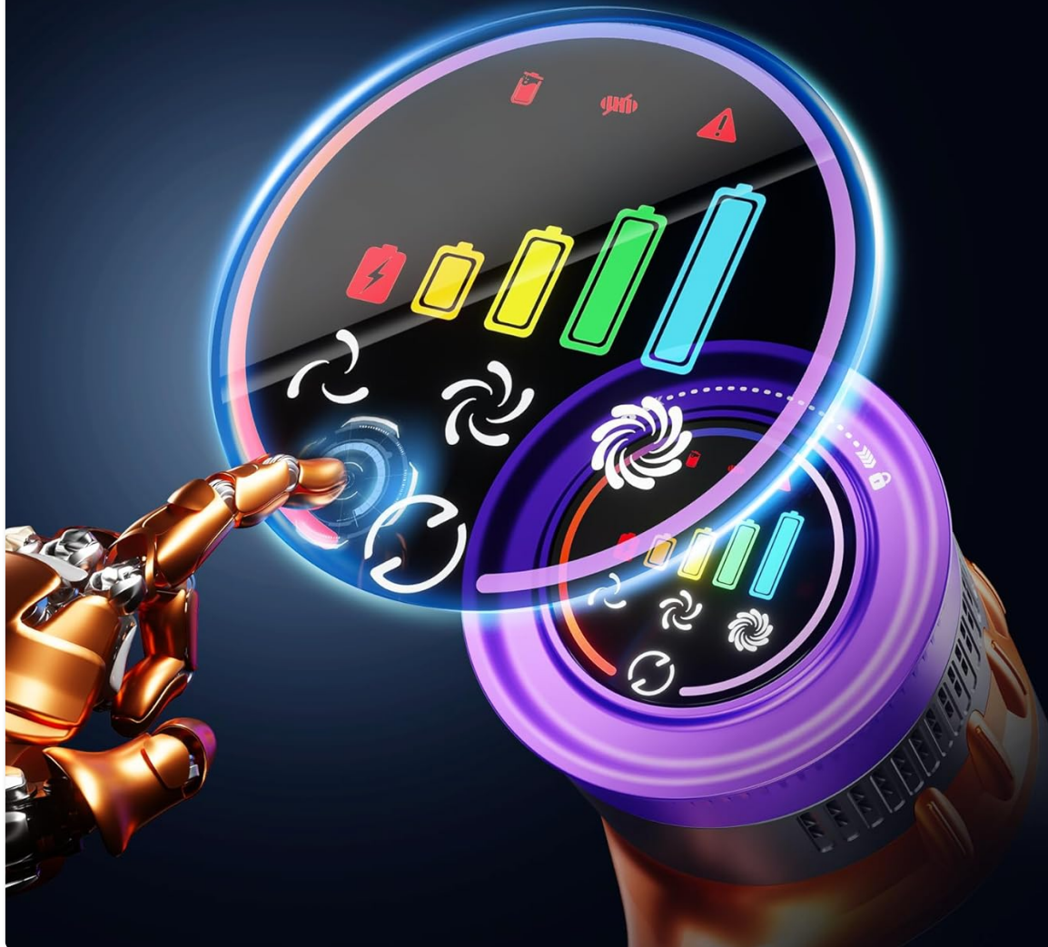
Figure 5: The smart LED touch screen for control and monitoring.