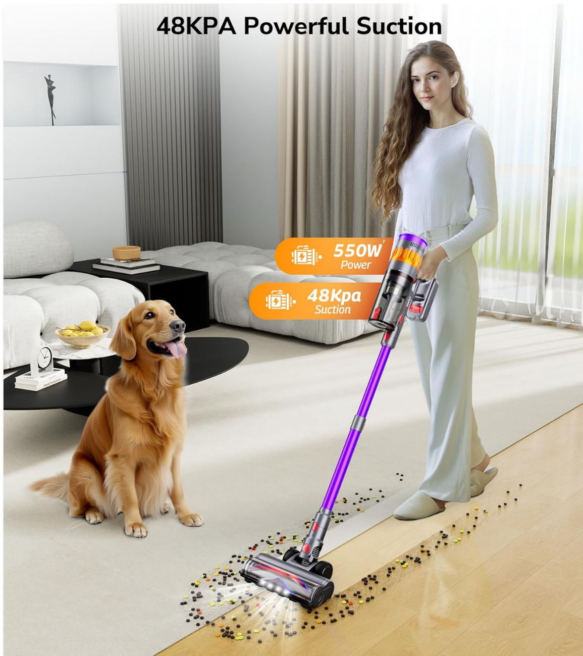
Figure 7: Vacuum in action, demonstrating powerful suction on various debris.