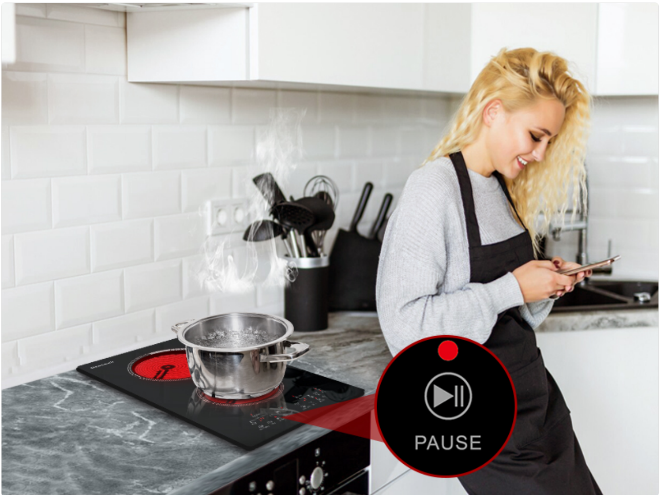
Figure 5.2: The Pause function allows temporary interruption of cooking.