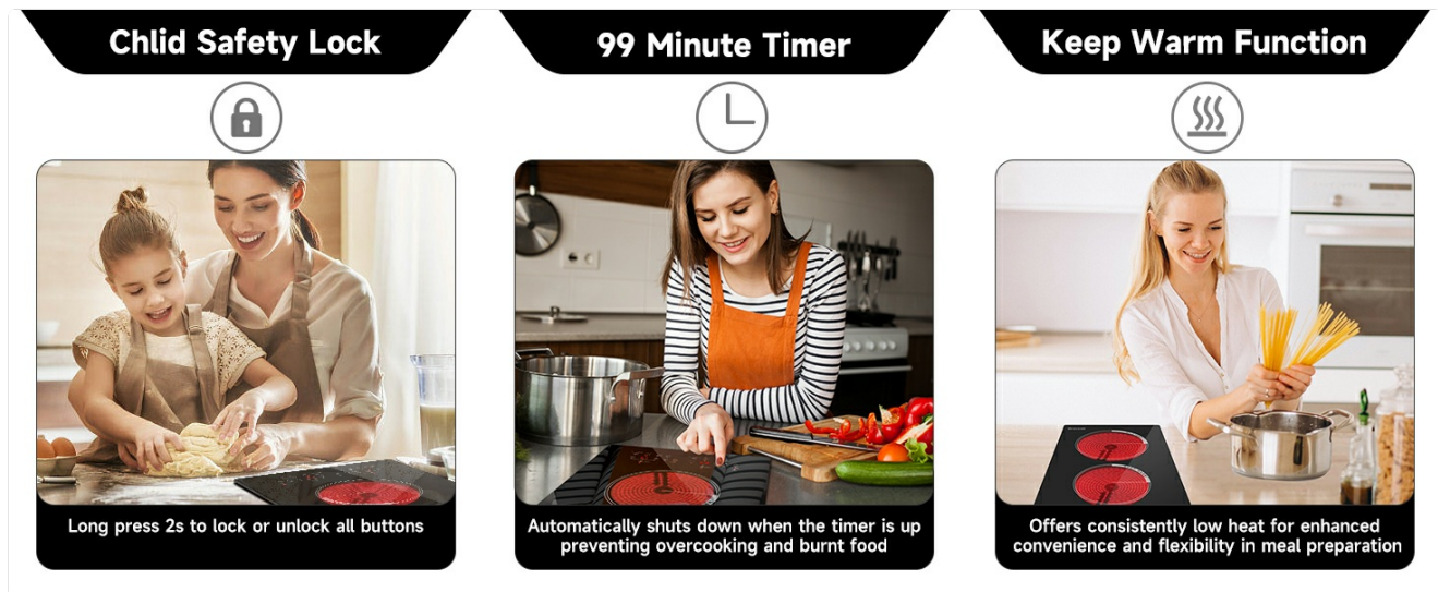
Figure 5.1: Overview of the control panel with various functions.

The cooktop features intuitive touch controls for each burner. Refer to the control panel diagram for button identification.