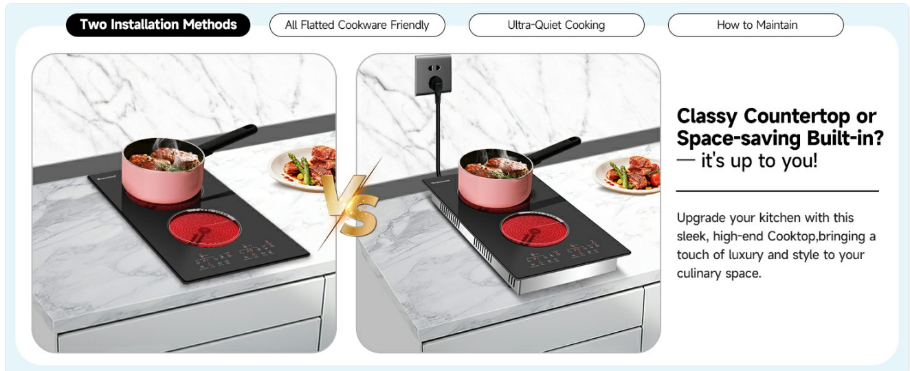
Figure 4.1: The cooktop can be used as a freestanding unit or integrated into a countertop.