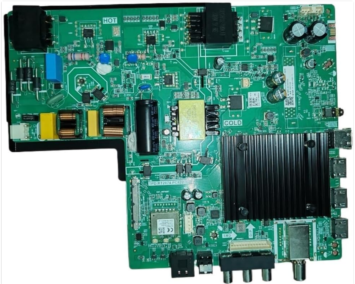
Image: A closer view of the GKNCCBA RT2874.PC822 motherboard, highlighting various input/output ports and connectors for proper cable attachment.