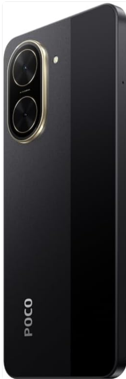
Figure 2: Side view of the POCO C71 smartphone, showing the slim profile and button placement.