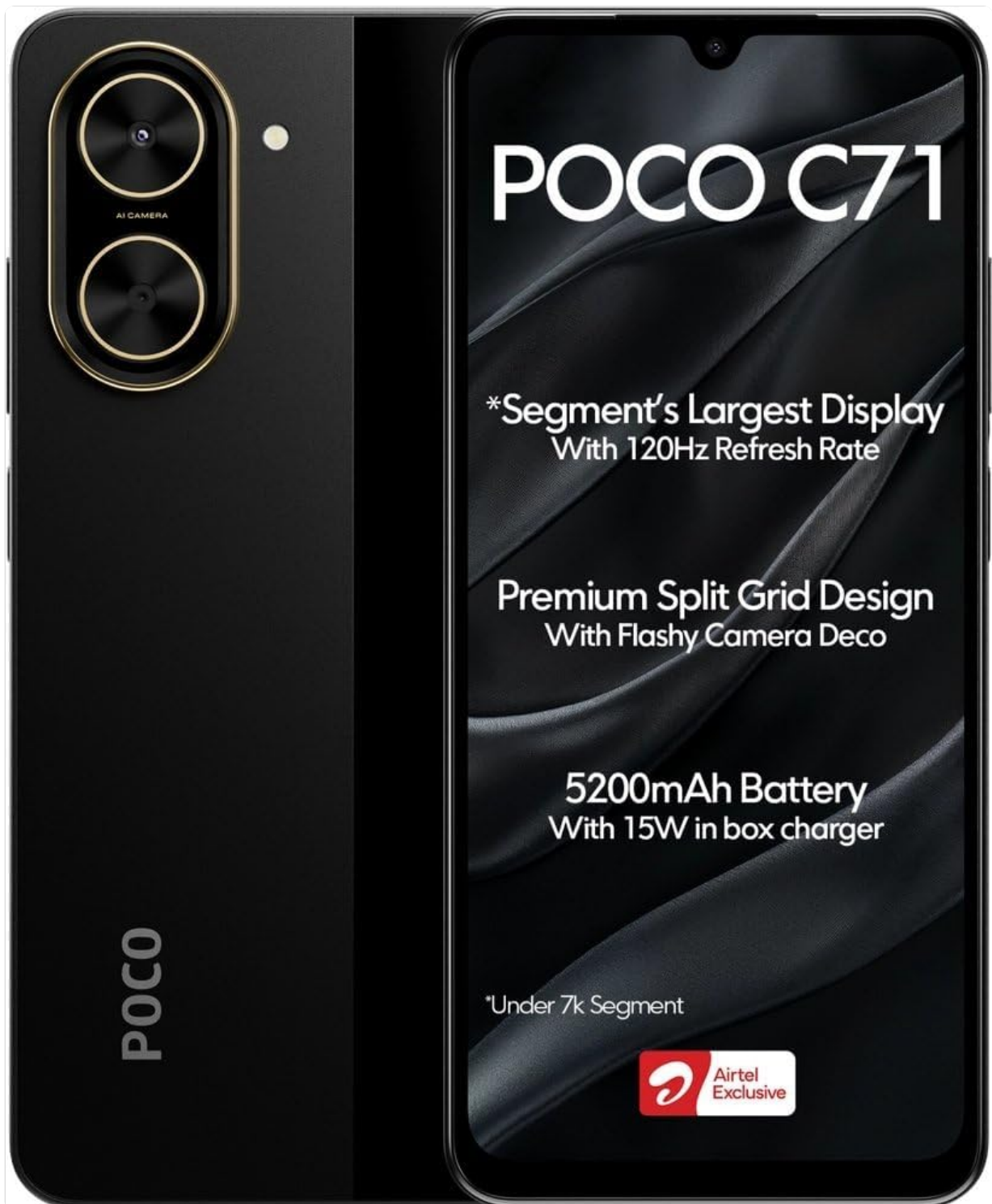
Figure 1: Front and rear view of the Poco C71 smartphone, highlighting the display, camera module, and branding.