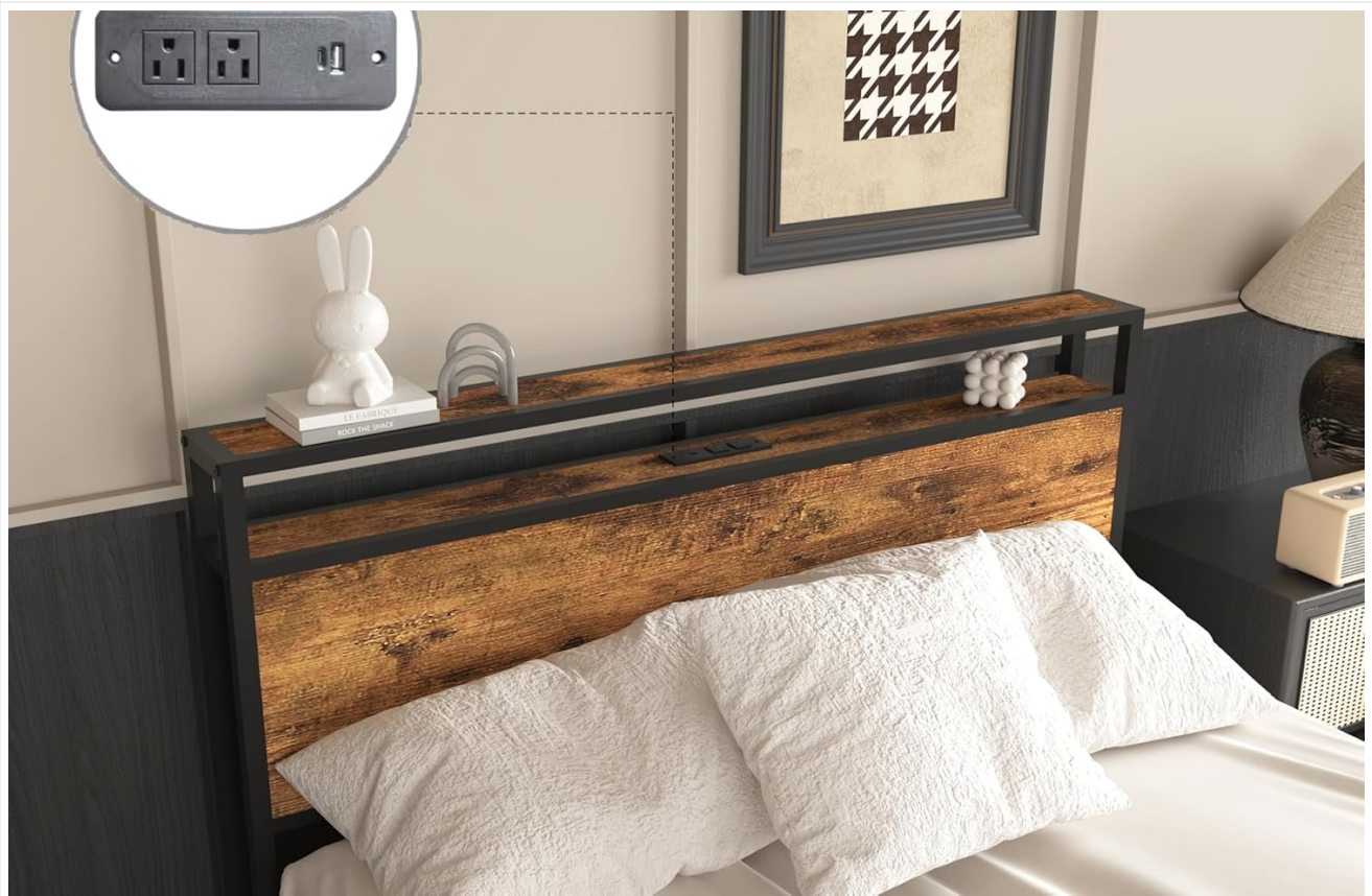
Image: Close-up of the headboard with integrated charging station, showing two standard outlets and two USB ports. This unit provides convenient power access.

Attach the headboard sections together, ensuring the LED strip and charging station are correctly oriented. Secure with the provided bolts.