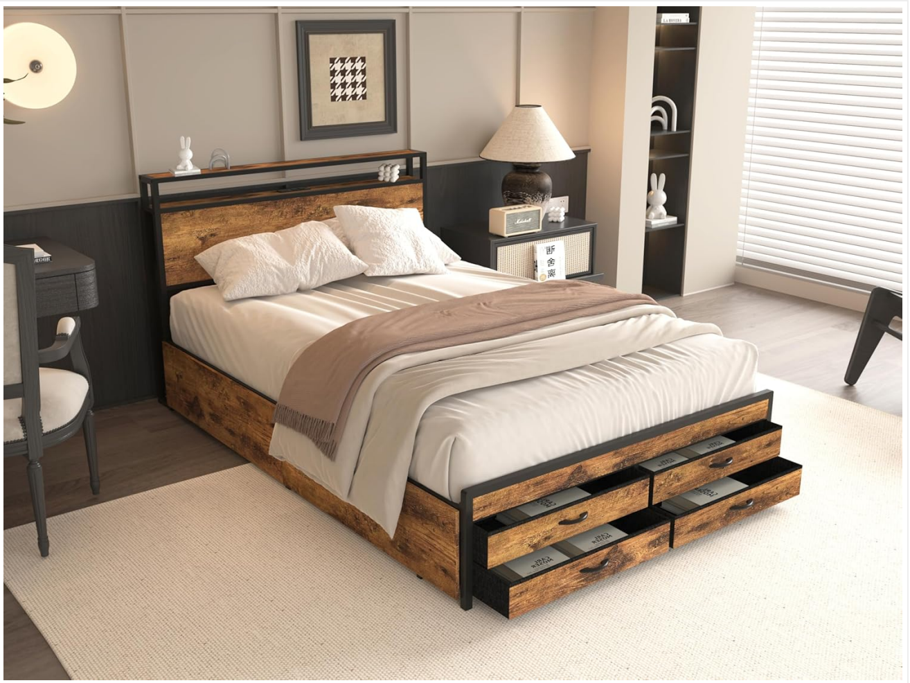
Image: The bed frame with four storage drawers extended, demonstrating the accessible storage space. The drawers are designed for easy access and organization.