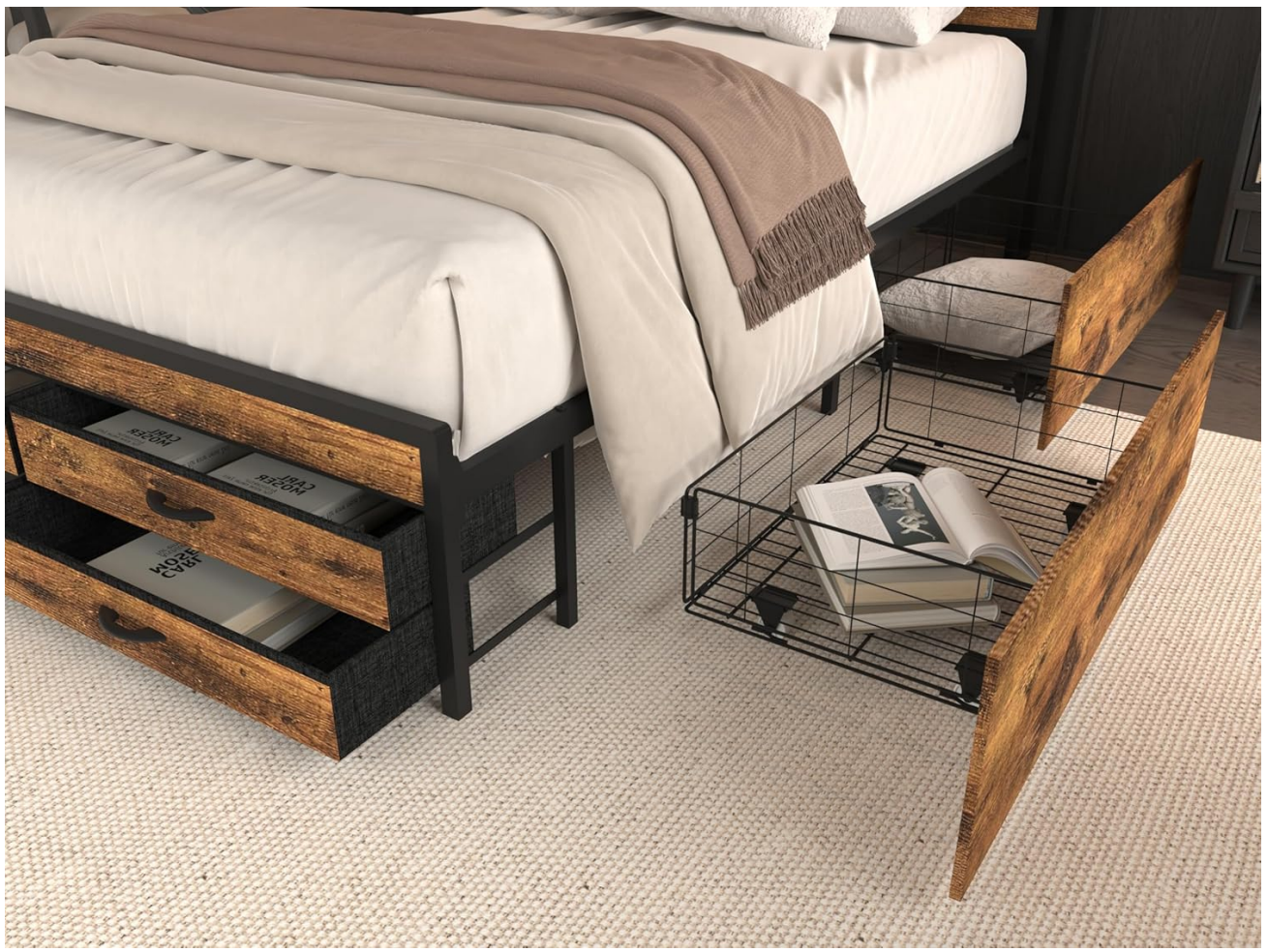
Image: Close-up of the storage drawers, highlighting the internal wire basket structure and smooth-rolling wheels for convenient access to stored items.