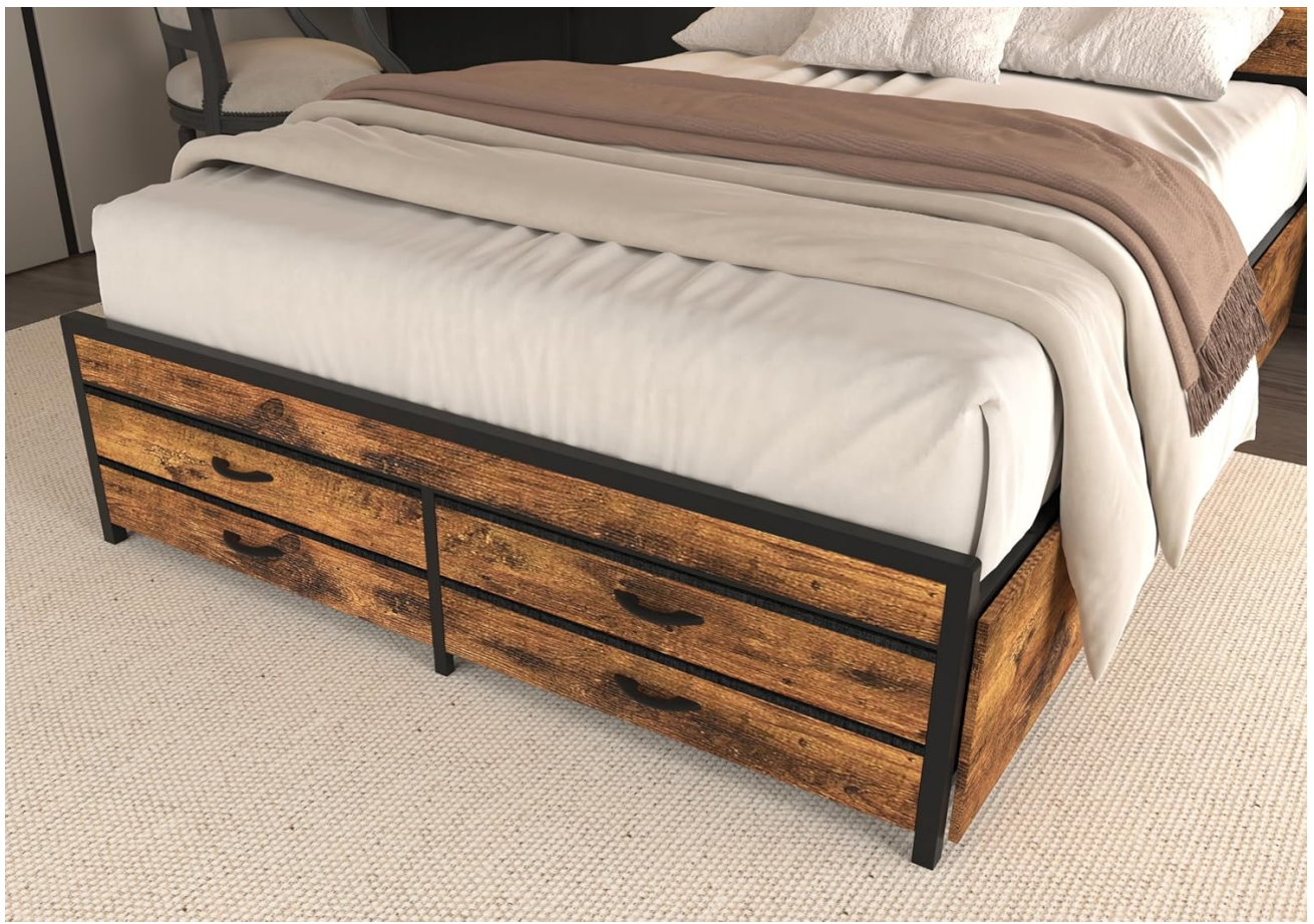
Image: A view of the bed frame's side, illustrating the integrated storage drawers in their closed position, maintaining a clean aesthetic.