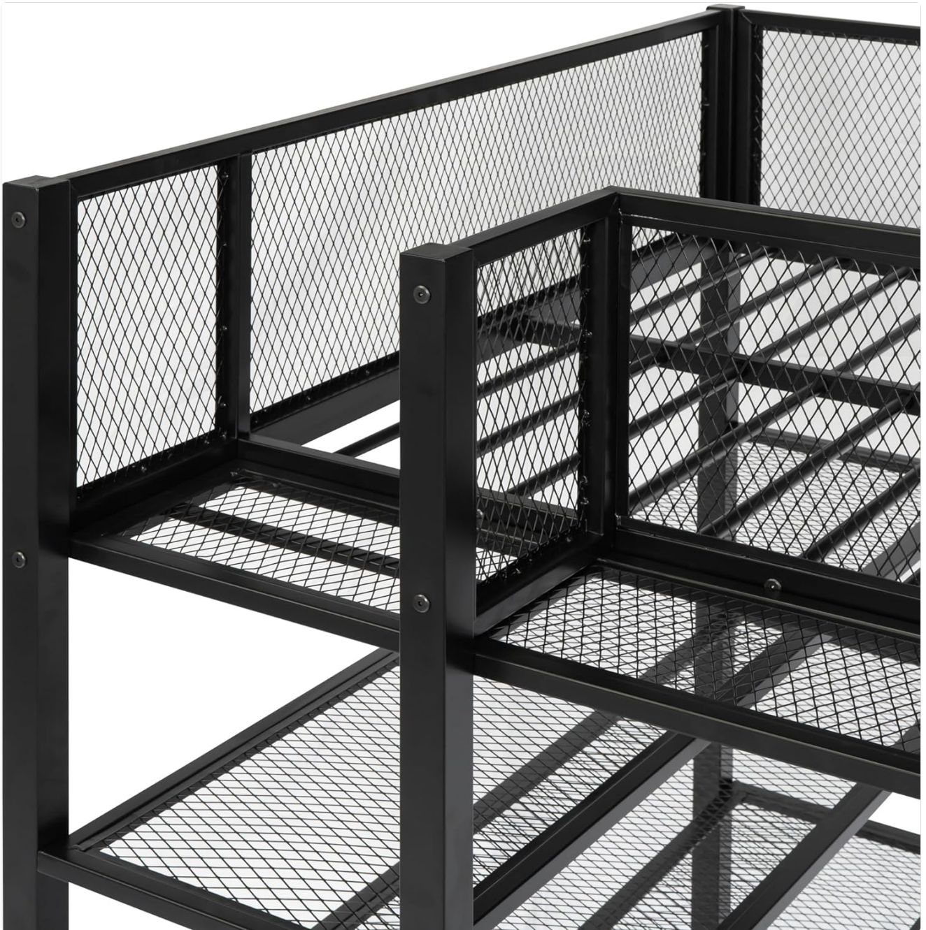
Image: A close-up view detailing the construction of the 4-tier shelving unit and the mesh design of the bed frame, highlighting the storage capabilities.