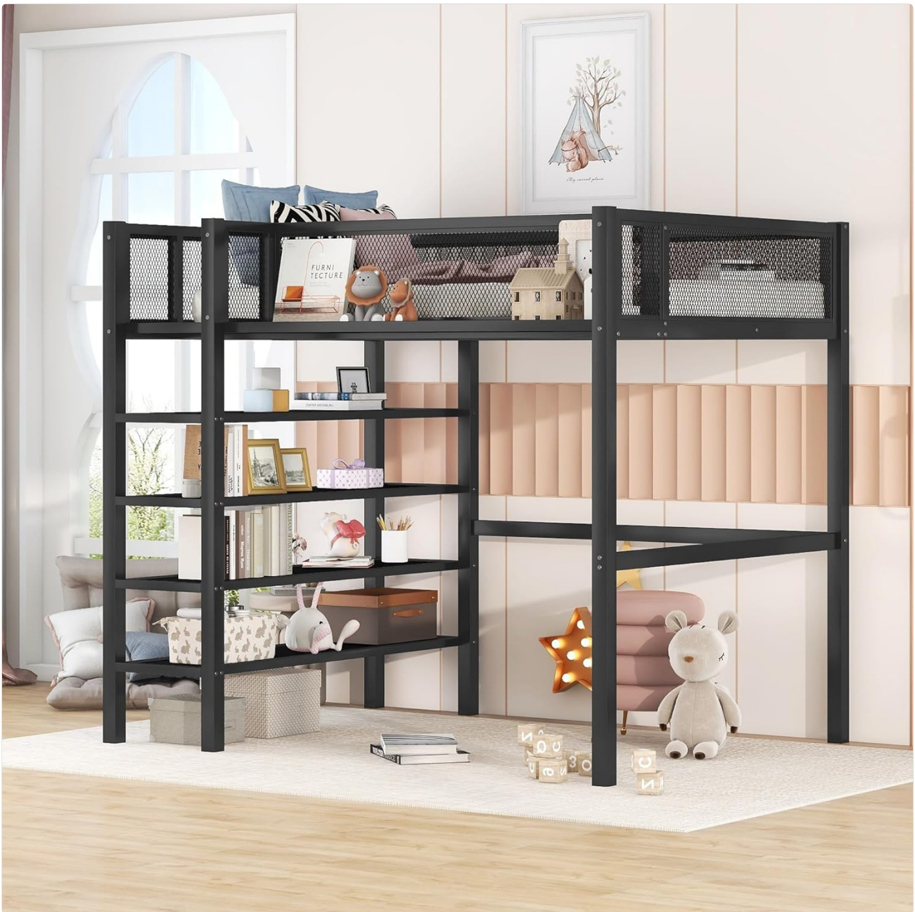
Image: The Twin Size Metal Loft Bed, showcasing its black metal frame, integrated 4-tier shelving unit, and the elevated sleeping area, designed to optimize space in a bedroom.