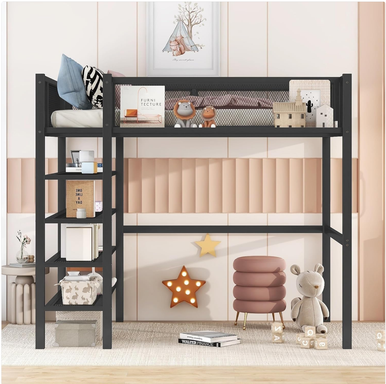
Image: The loft bed integrated into a modern bedroom, demonstrating its sleek design and how it fits into contemporary decor.