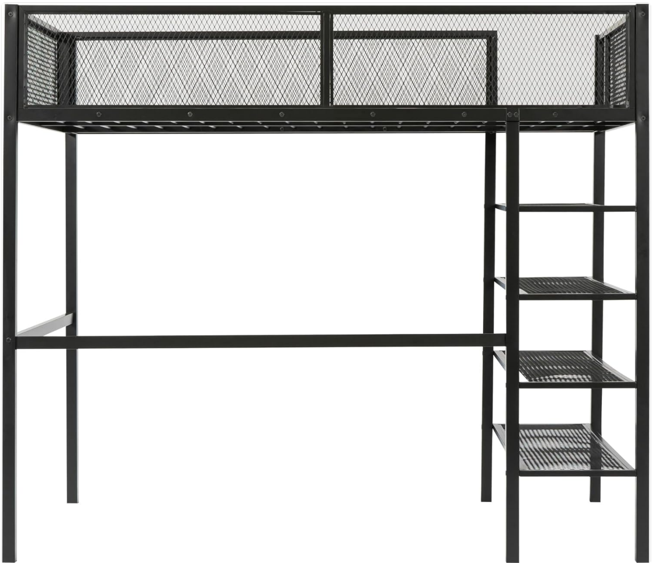
Image: A front view of the loft bed, highlighting the sturdy metal construction and the integrated shelving unit on the left side.