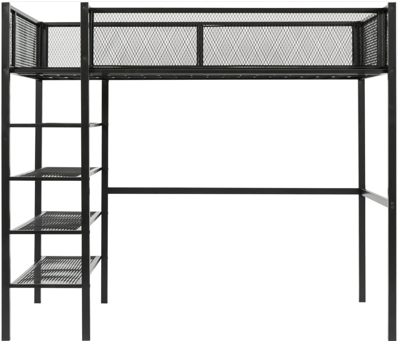
Image: A side profile of the loft bed, clearly showing the integrated ladder and the protective full-length guardrail for user safety.