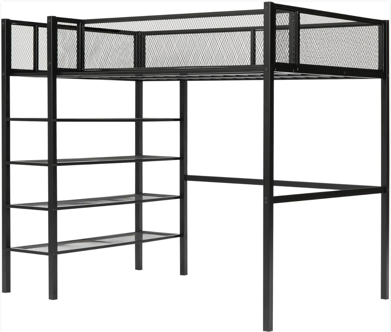
Image: A view of the spacious area beneath the loft bed, illustrating its potential for a desk, seating, or additional storage.