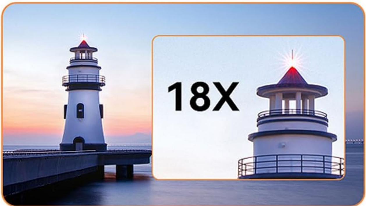
This image visually explains the 18x zoom feature. It shows a large illustration of the camera with light rays emanating from its lens, symbolizing zoom. Below, two comparative images of a lighthouse demonstrate the effect of 18x zoom, showing a distant view and a significantly magnified view of the same subject.