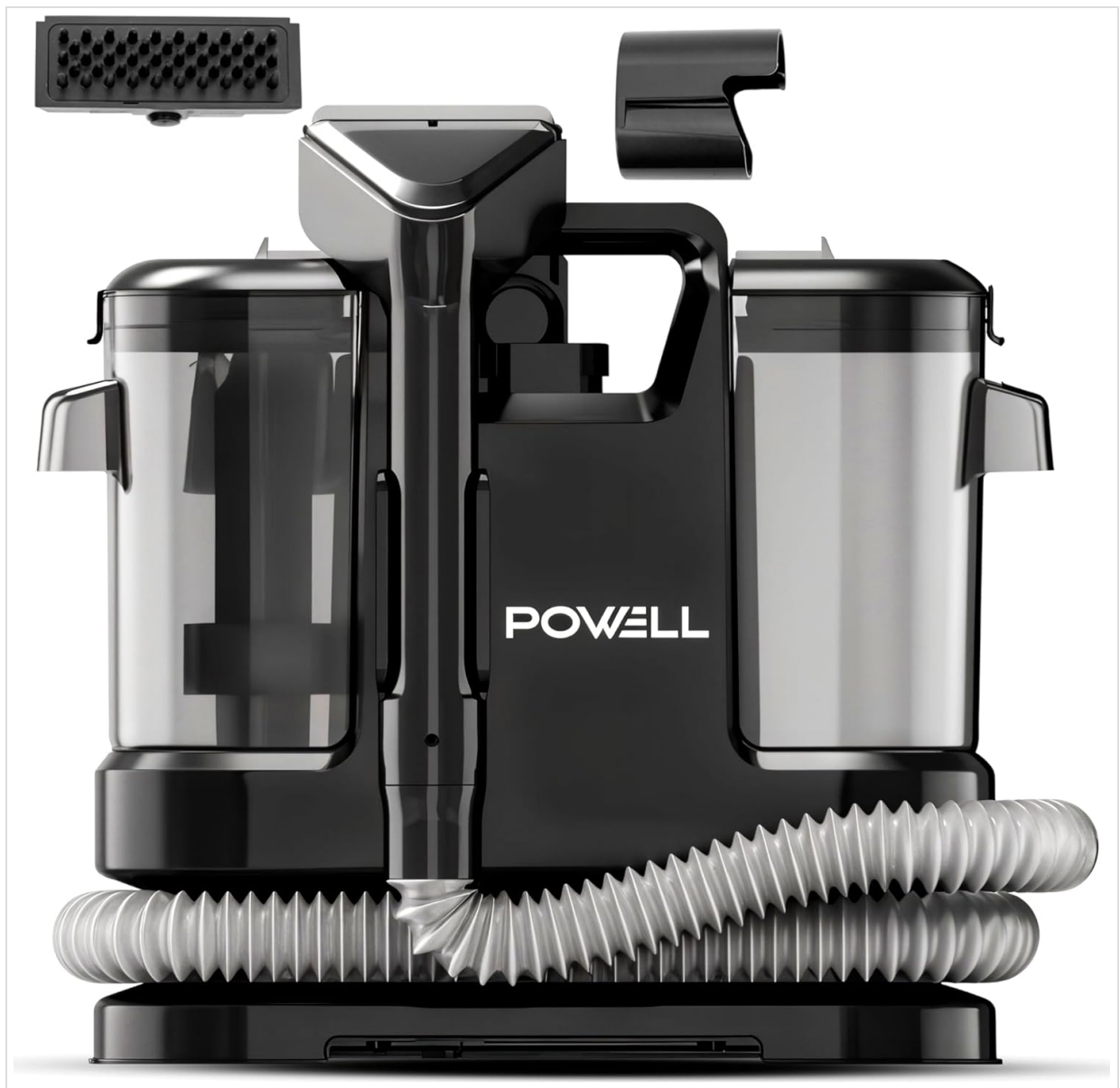
Image: The Powell 450W Carpet Cleaner, showcasing its compact design and included accessories like the brush head and nozzle.