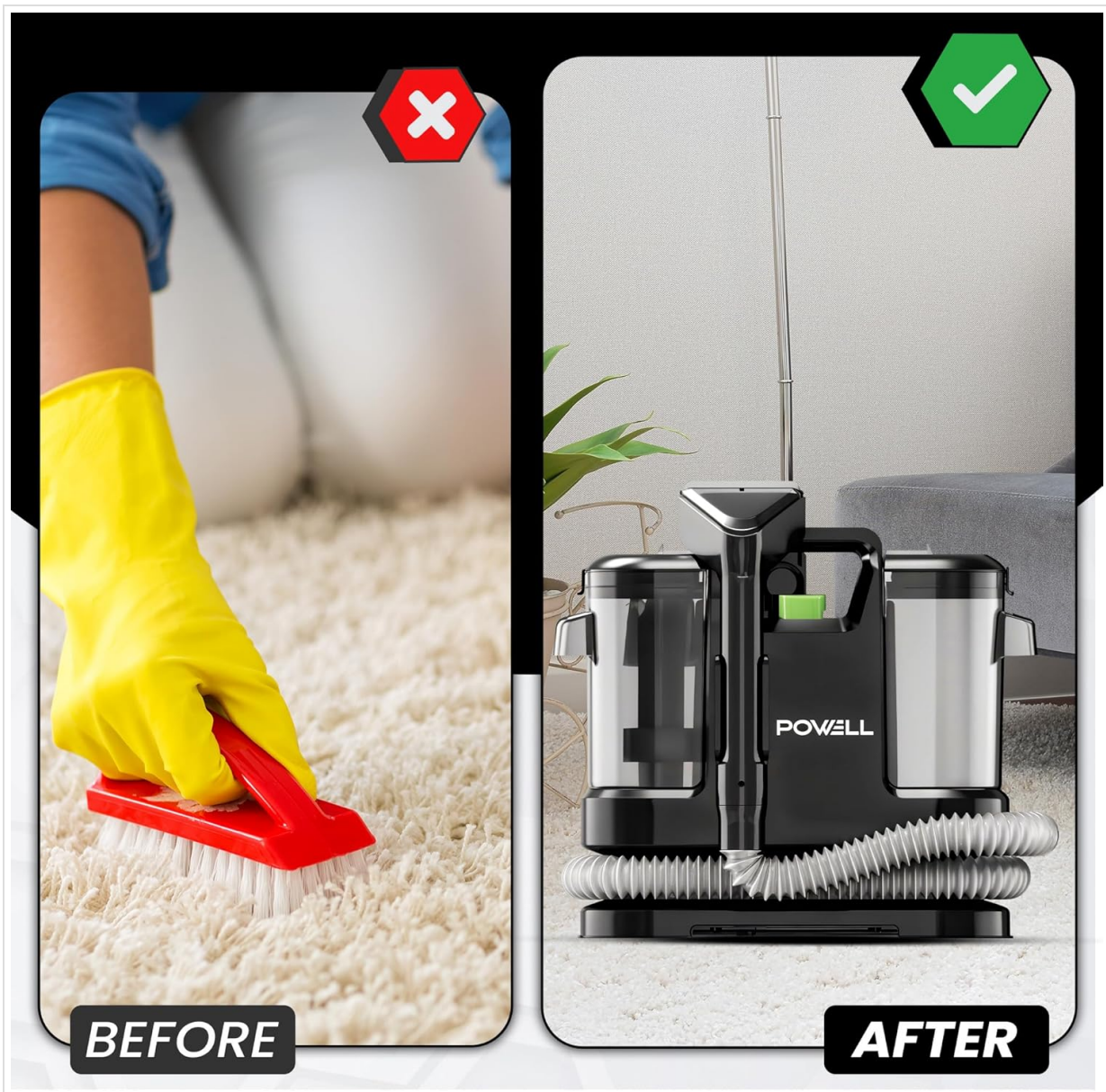
Image: Detailed diagram illustrating the various components of the carpet cleaner, including tanks, hose, and controls.