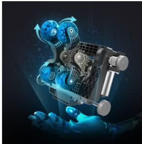
Image 4.2: Illustration of the internal massage mechanism, including air hose connections.