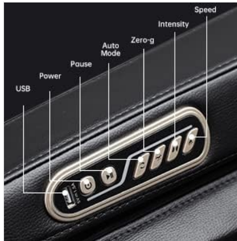
Image 5.1: Remote control for the massage chair, showing various function buttons.

The remote control allows you to select various massage programs and adjust settings.