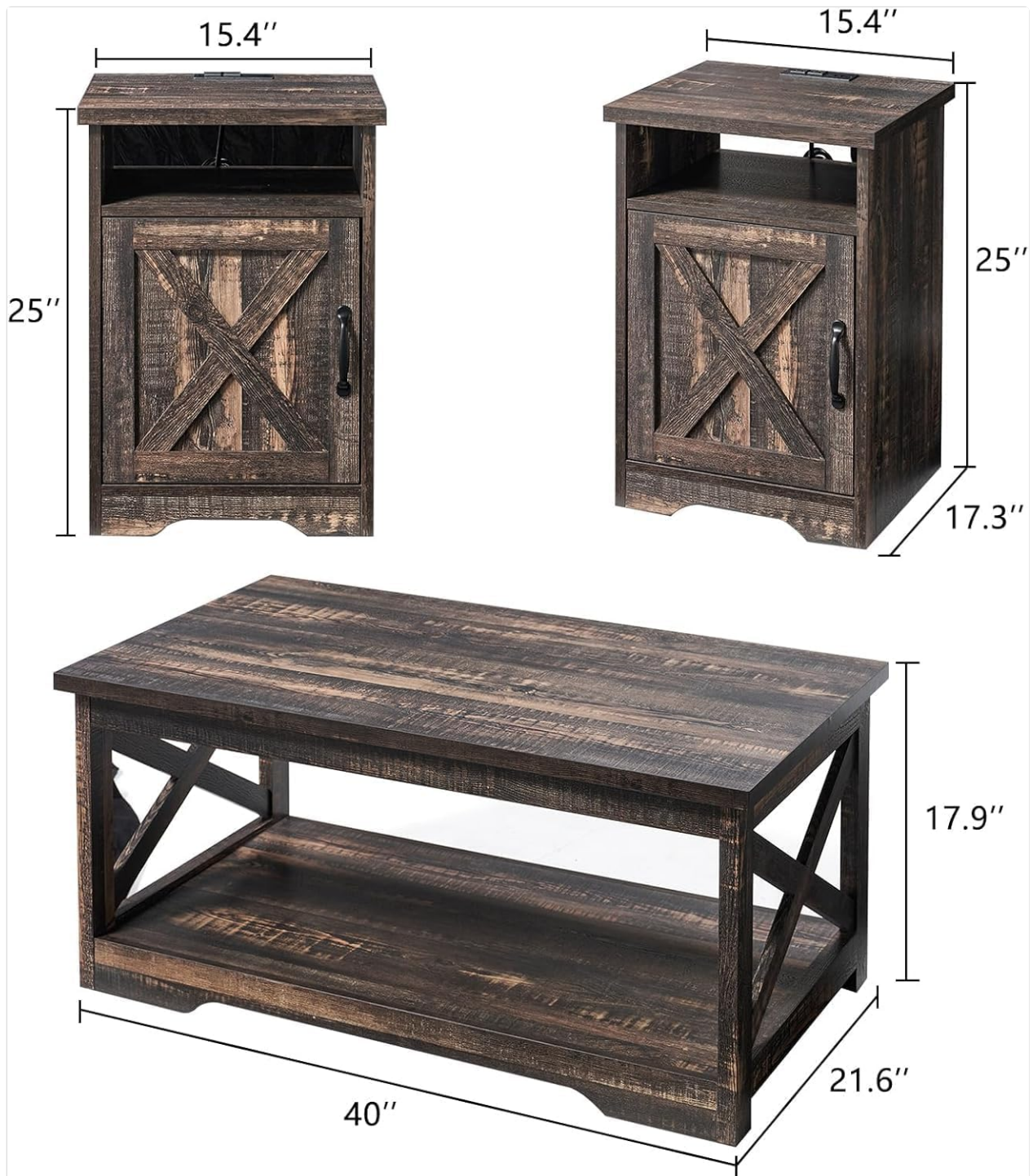
Image: Detailed dimensions for the coffee table (40"W x 21.6"D x 17.9"H) and end tables (15.4"W x 17.3"D x 25"H).

Assemble the coffee table and two end tables according to the provided instructions. These tables feature a rustic barn door X-shaped design.