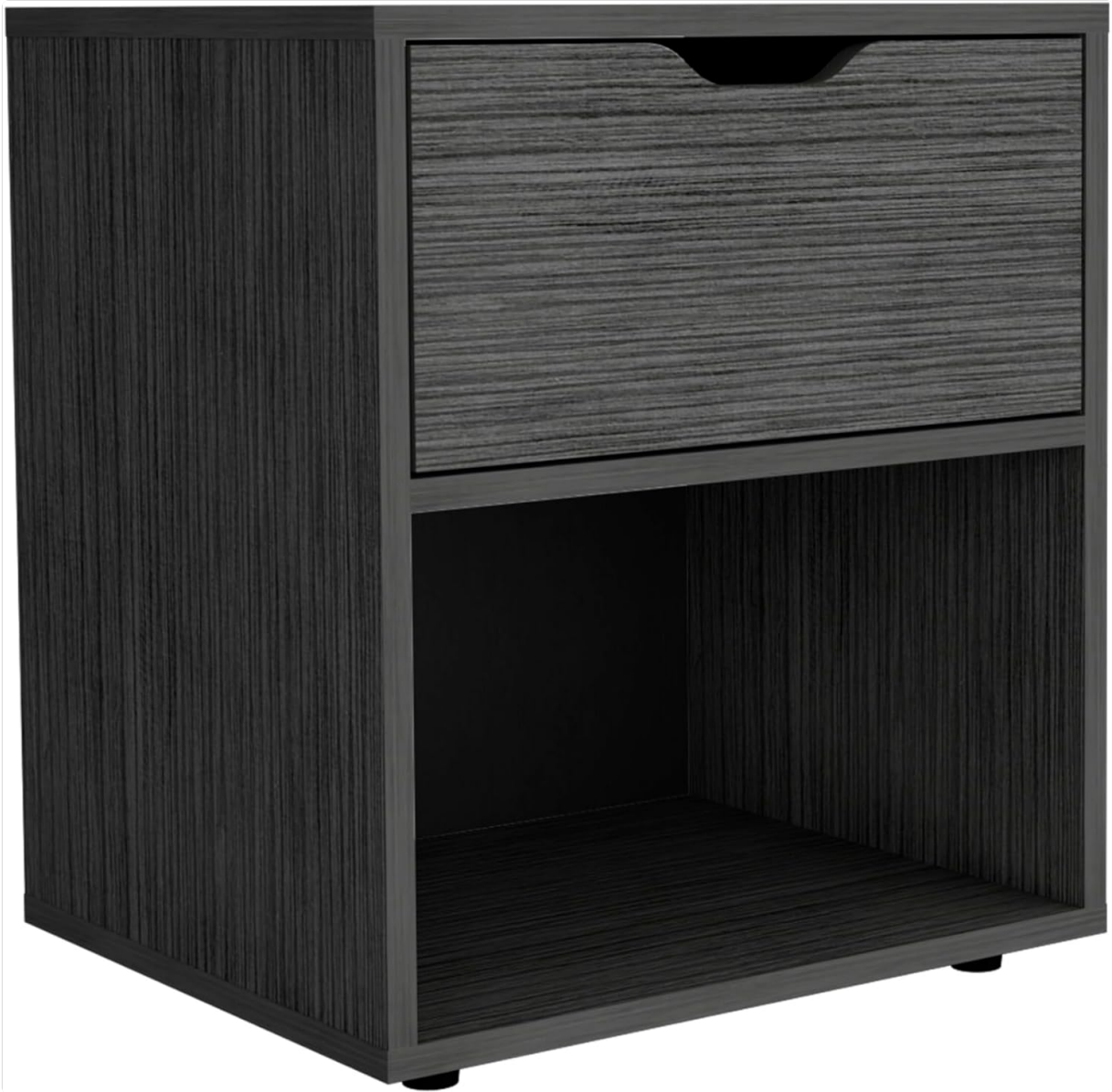
Figure 2.1: An angled view of the fully assembled nightstand, highlighting its structure and storage compartments.