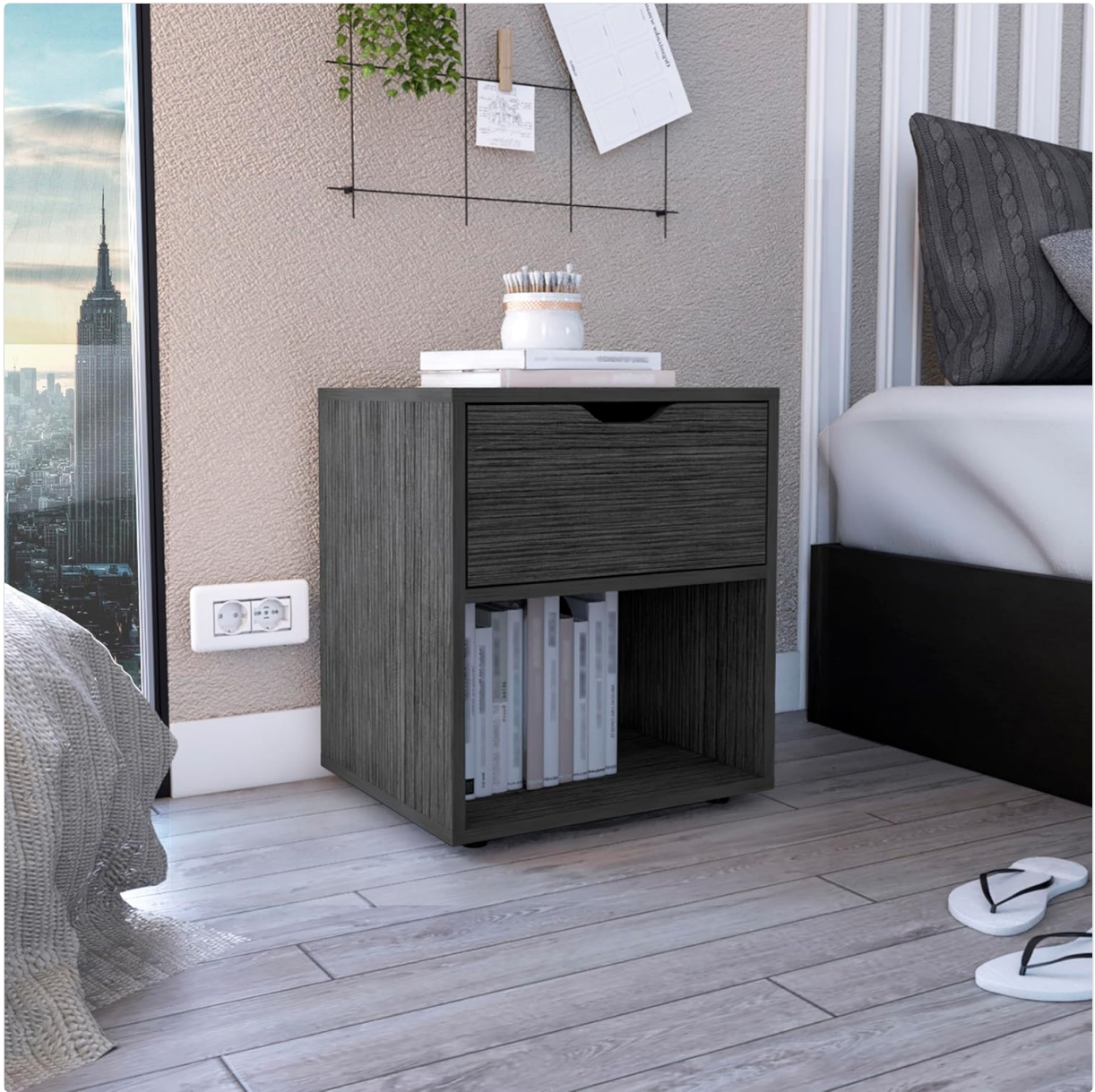
Figure 1.1: The Generic 19.7 Inch High Nightstand End Table with Open Shelf, shown in a bedroom environment next to a bed.