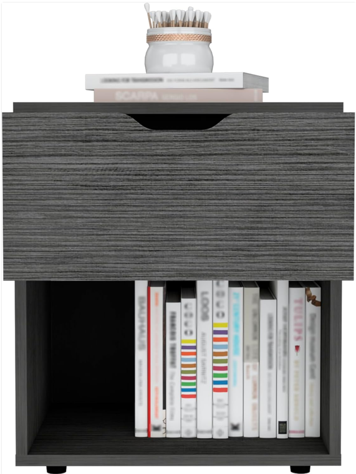
Figure 3.2: The nightstand's open shelf, shown with books, illustrating its storage capacity.