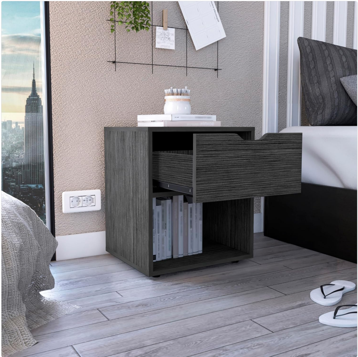
Figure 3.1: The nightstand with its drawer partially open, demonstrating its functionality.