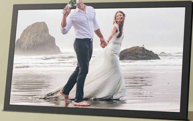
Image: Switch Between Landscape & Portrait