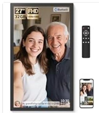
Image: Remote Control

The included remote control allows for convenient navigation and settings adjustments from a distance.