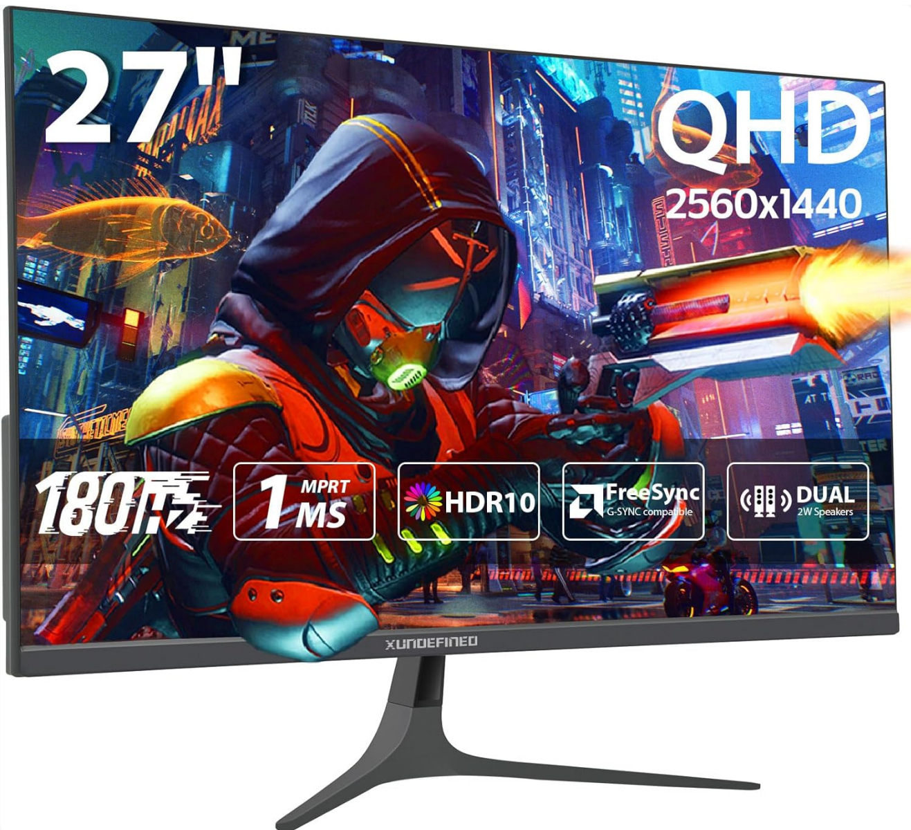
Image 1.1: The XUNDEFINED 27-inch 1440P 180Hz Fast IPS Gaming Monitor.