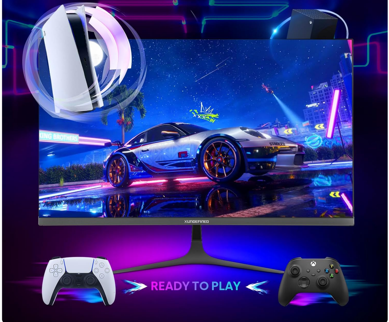
Image 4.3: Adaptive Sync in action, reducing tearing and ghosting.

Experience stunning visuals for next-gen consoles