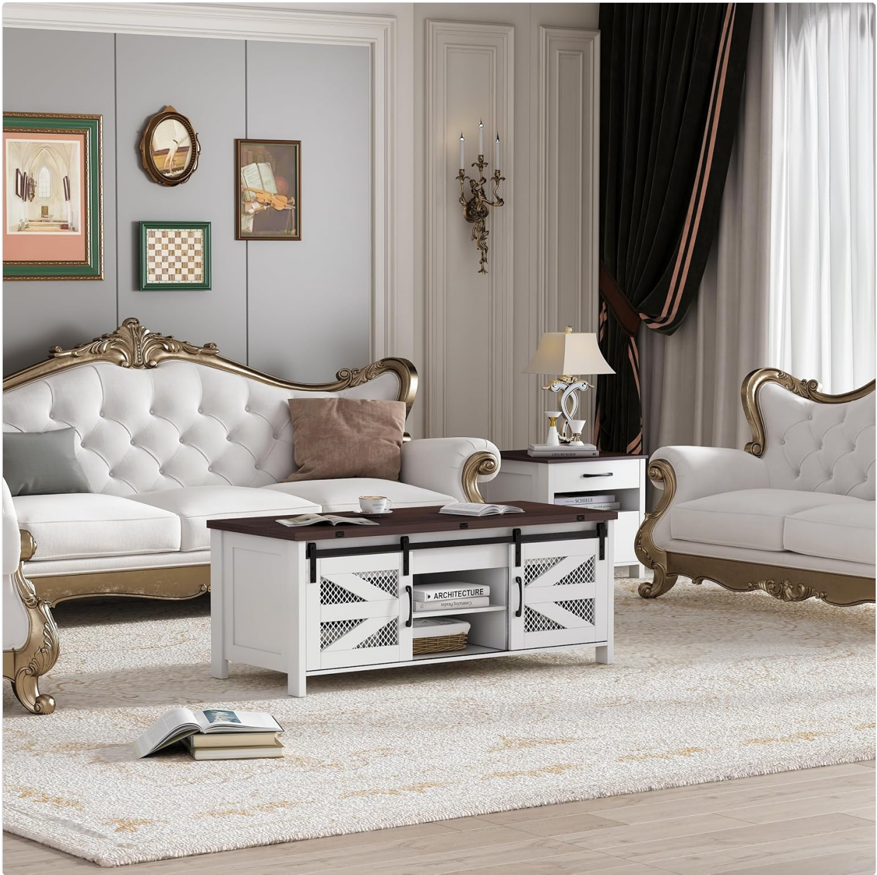
Figure 4.1: The 4-in-1 functionality: Regular Coffee Table, Two-Way Lift Top, and Dining Table.