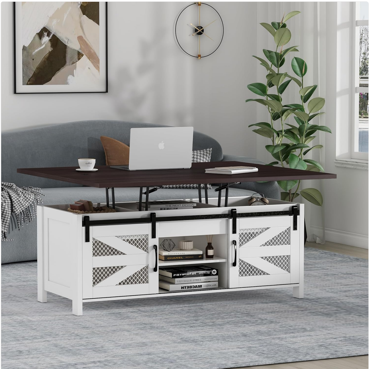
Figure 4.4: Table in two-way lift top configuration, suitable for a workspace.