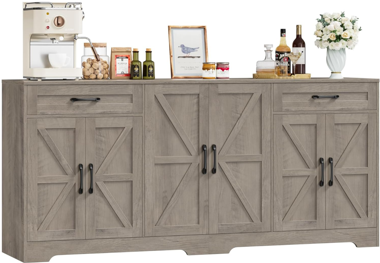
Figure 1: Front view of the assembled BOTLOG 71-inch Large Sideboard Buffet Cabinet, showcasing its farmhouse design and ash grey finish.

undamaged. If any parts are missing or damaged, please contact customer support immediately.