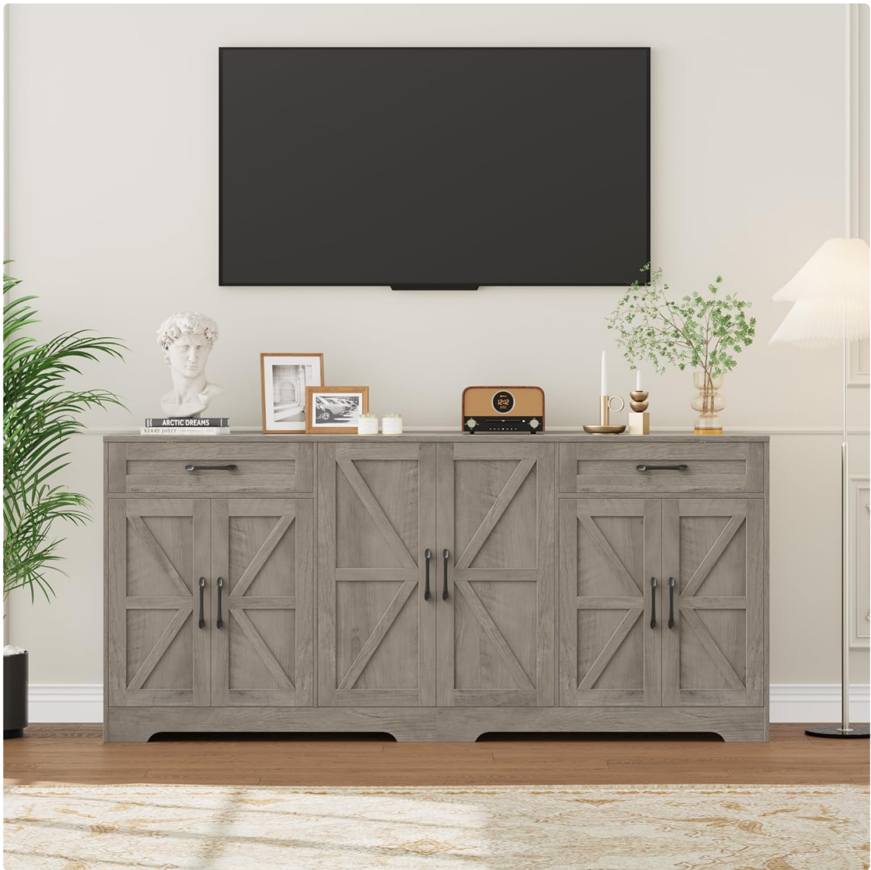
Figure 6: The sideboard cabinet positioned as a media console, supporting a television and complementing the living room decor.

Video 1: An official product video showcasing the BOTLOG Sideboard Buffet Cabinet, highlighting its large countertop, smooth drawers, barn door design, generous storage capacity, and adjustable shelves with multiple height options.