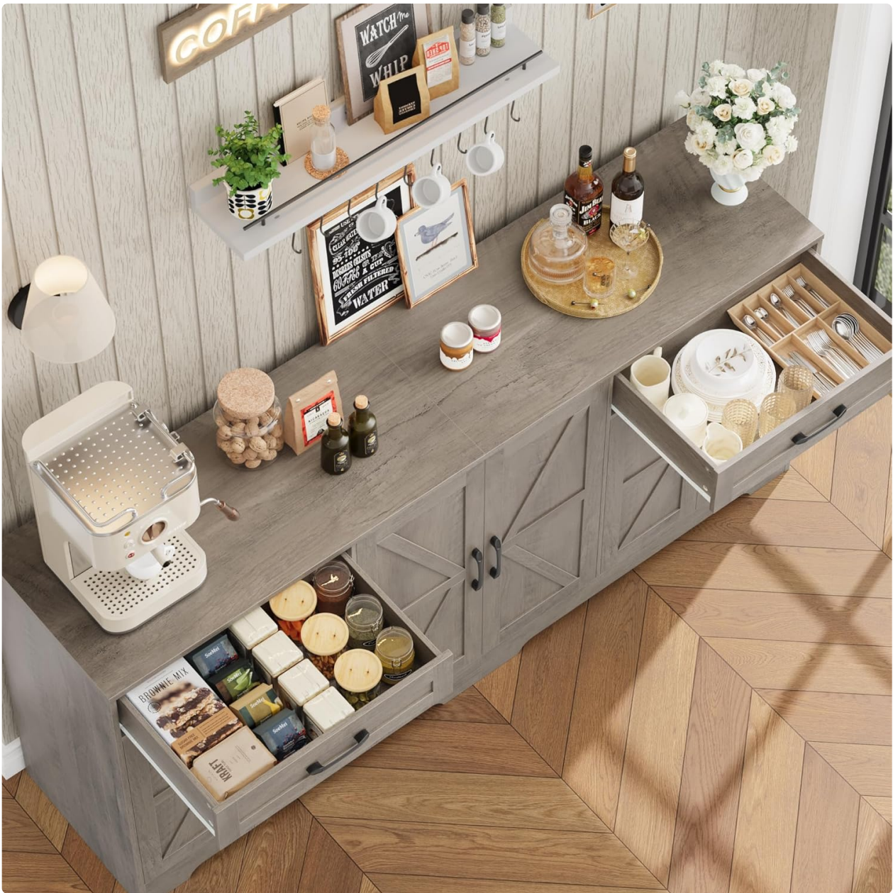
Figure 3: An overhead view of the sideboard with both top drawers open, displaying organized cutlery, plates, and other kitchen essentials.