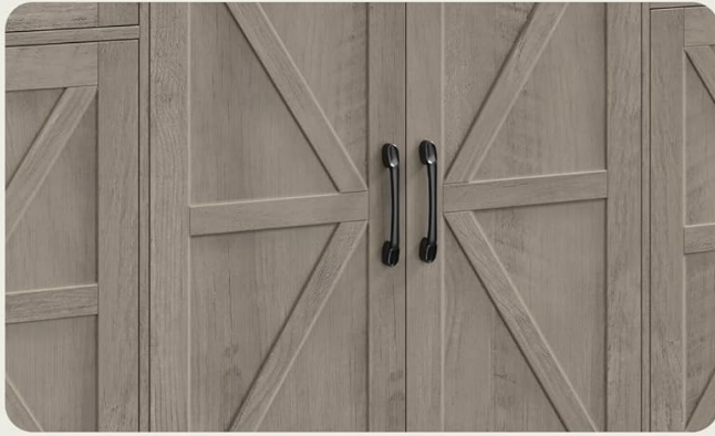
Barn Doors & Wood Grain