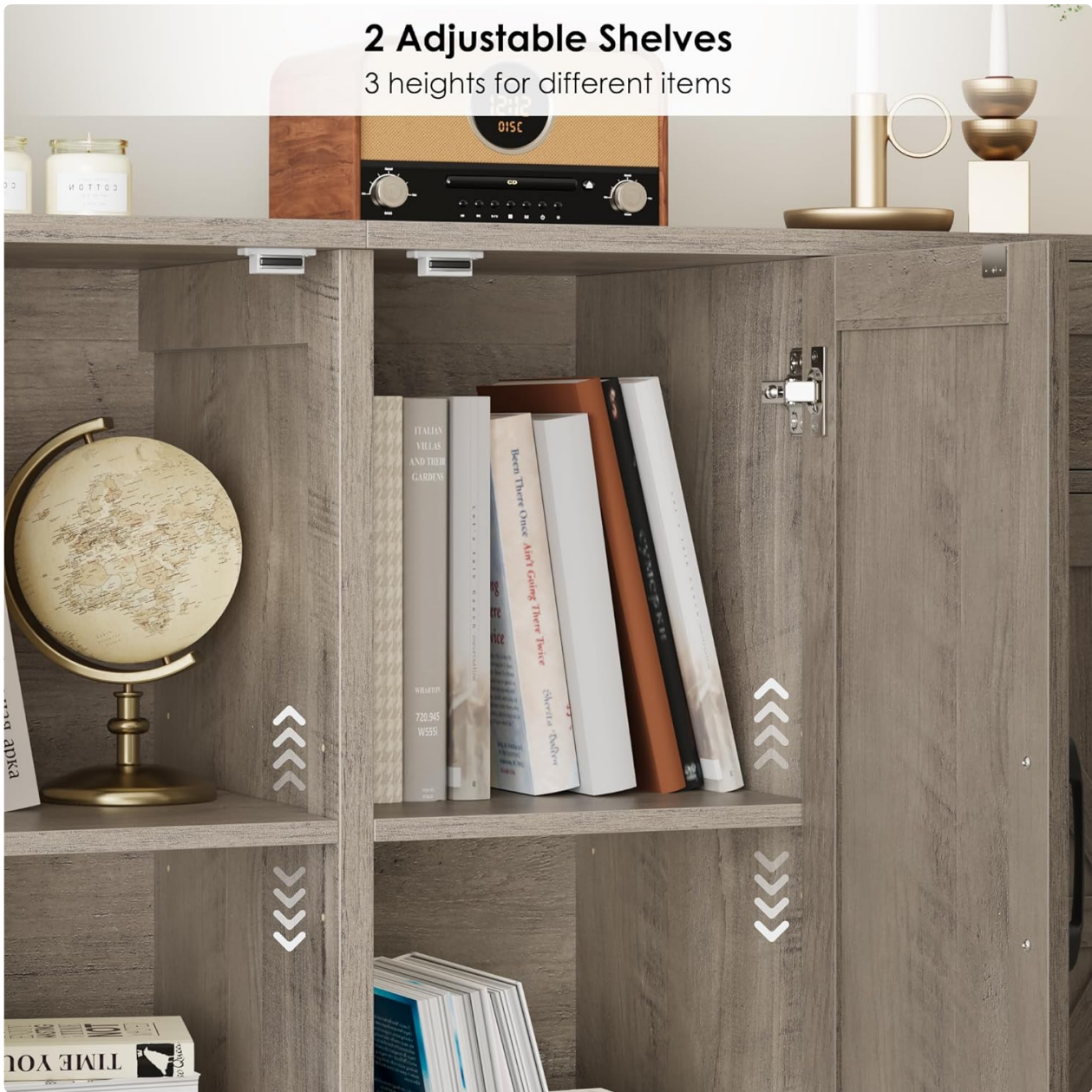
Figure 4: Close-up of the cabinet interior, highlighting the adjustable shelves with three height options for customized storage.