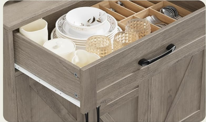
Smooth Sliding Drawers