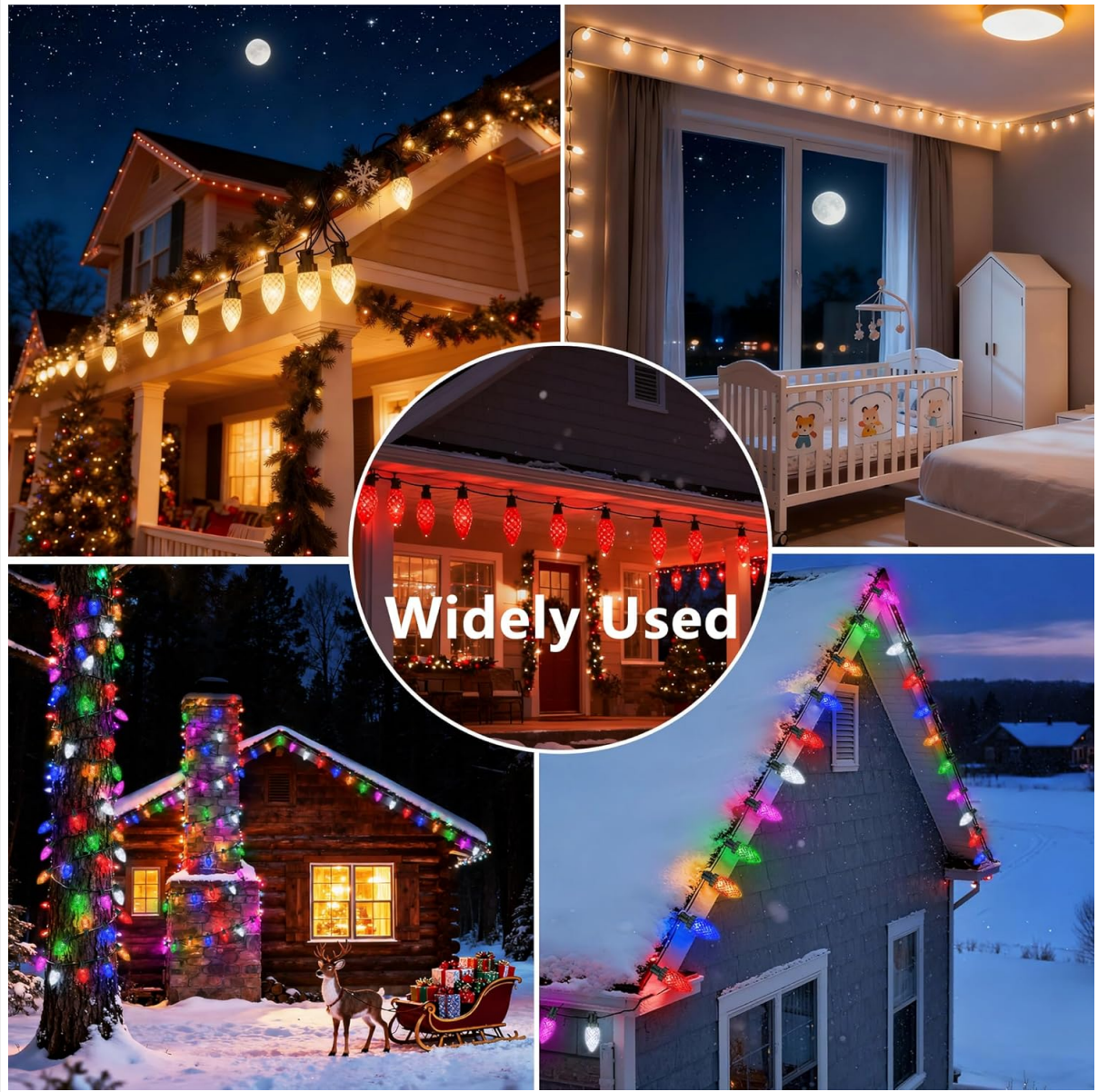
This collage illustrates the versatile applications of the Joomer string lights, depicting them adorning a house roofline, wrapped around a tree, decorating a porch, and providing a soft night light in a bedroom, highlighting their suitability for diverse indoor and outdoor environments.