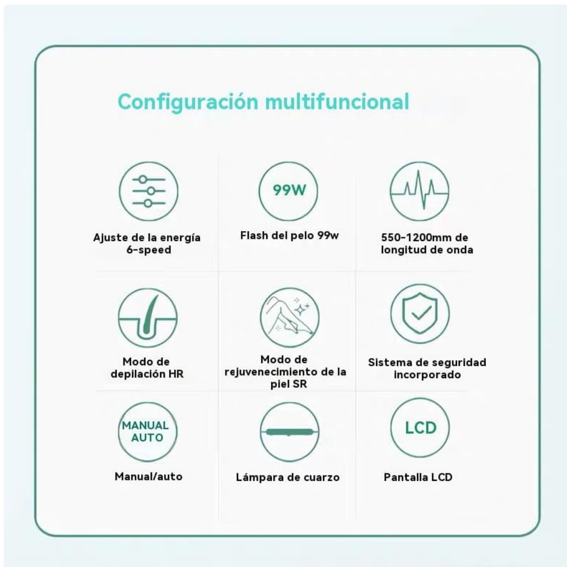
Image: Overview of the multifunctional configuration, highlighting features like 6-speed energy adjustment, 99W power, 550-1200nm wavelength, HR/SR modes, and LCD display.