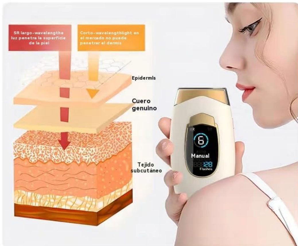
Image: Diagram illustrating the six adjustable intensity levels (gears) of the IPL epilator, ranging from low to high intensity.