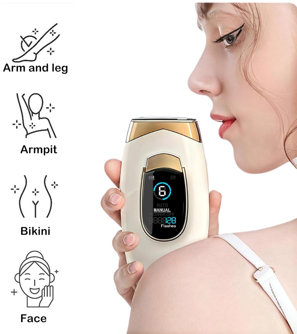
Image: The Lumisilk Luminia IPL Epilator demonstrating its use on various body areas: arms, legs, underarms, bikini line, and face.

Visible hair reduction can be observed within 3-4 weeks, with permanent reduction typically achieved after 8-12 sessions.