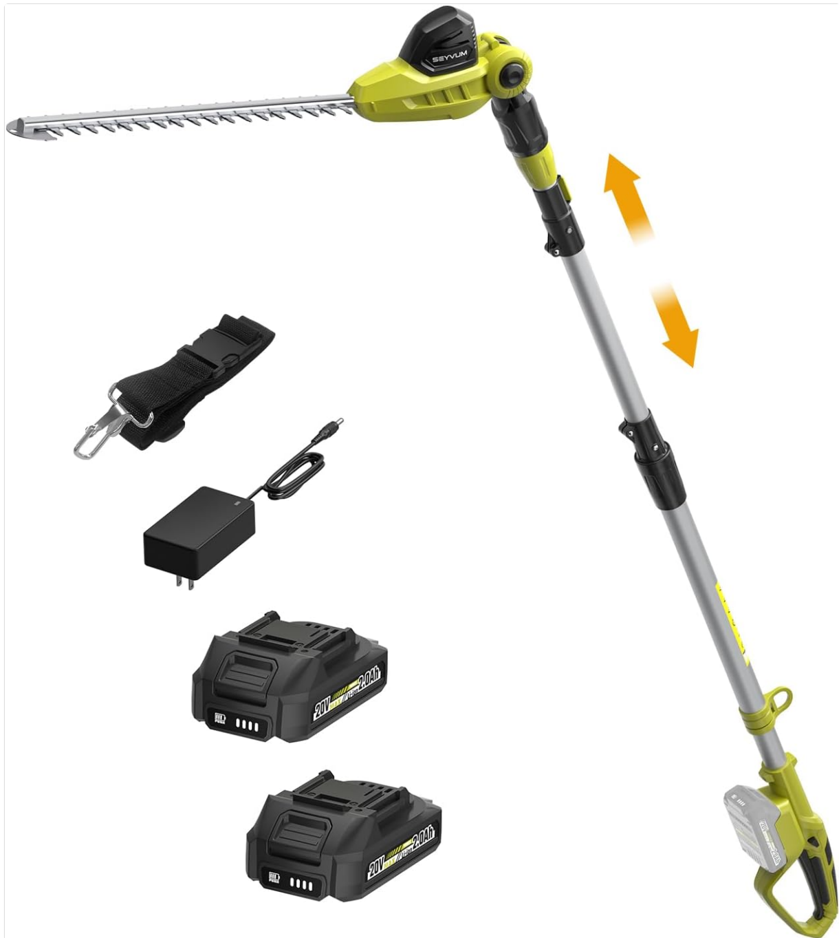
Image 2.1: All components included in the SEYVUM 20V MAX 20-inch Cordless Pole Hedge Trimmer package.