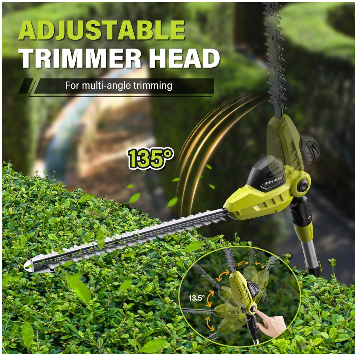
Image 4.2: The trimmer head's multi-angle adjustment feature for versatile trimming.