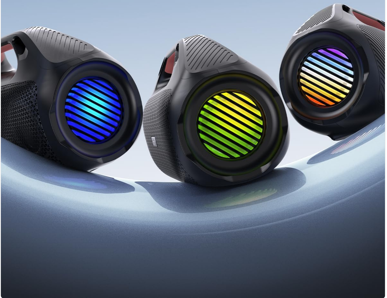
Figure 5: Multiple dbsono speakers displaying various dynamic light show patterns, which pulsate and change color in sync with the music.

Your music will be enhanced by the pulsating lights, creating an immersive visual experience