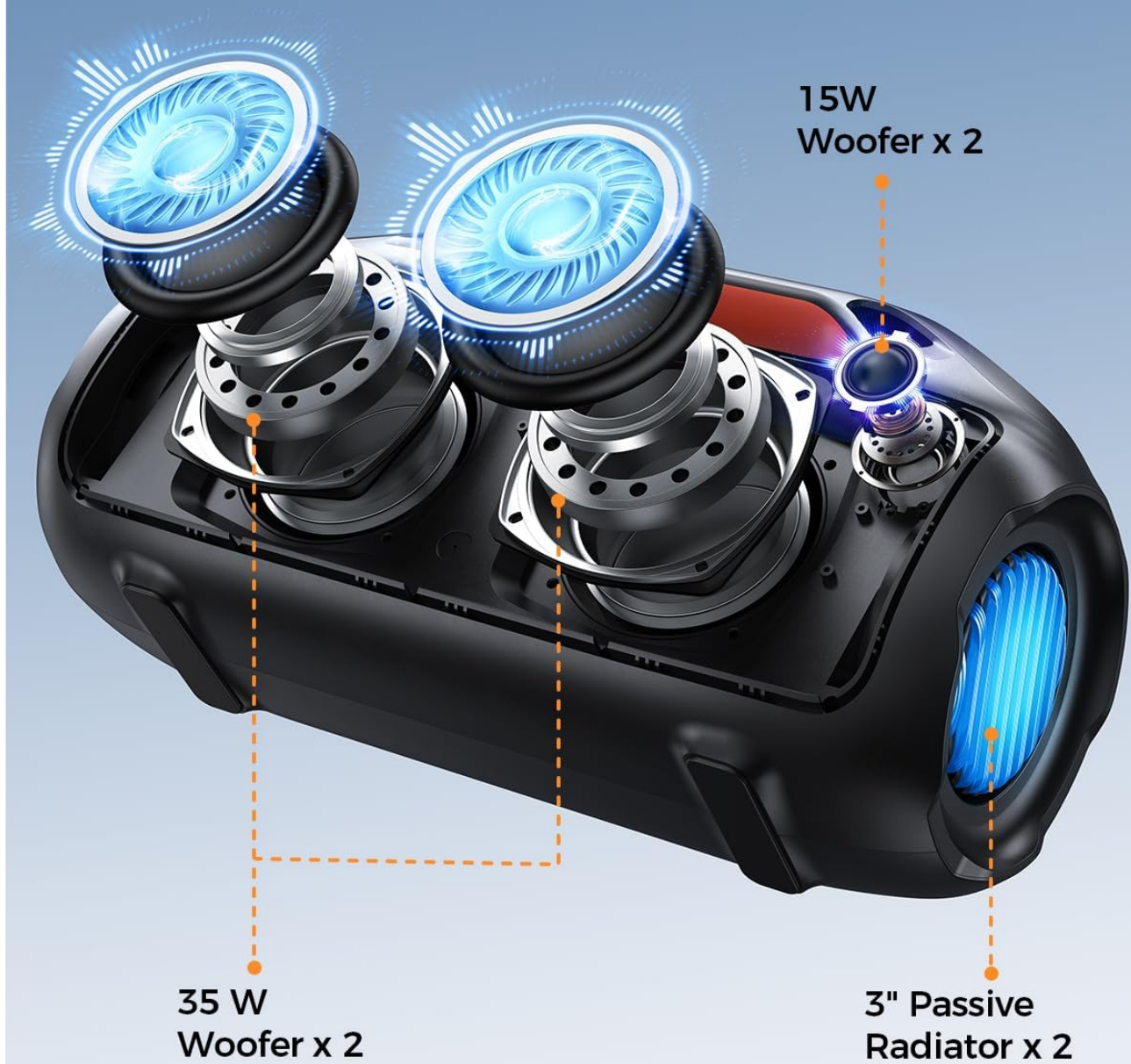
Figure 2: Diagram illustrating the internal speaker components, including dual 35W woofers, dual 15W woofers (likely tweeters based on product description), and 3-inch passive radiators, contributing to the 100W sound output.

Delivers consistently crisp highs, pure mids, deep bass, effortlessly fill your room and covers an outdoor space