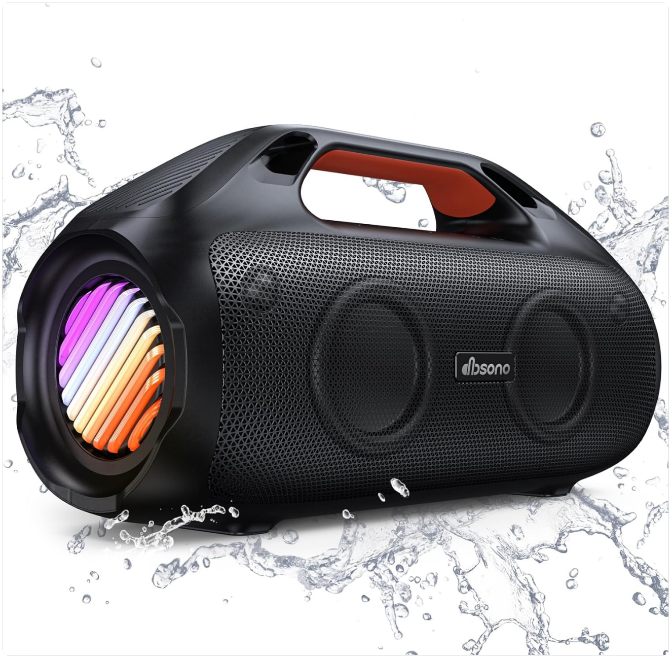
Figure 1: Front view of the dbsono 100W Bluetooth Speaker, showcasing its robust design and IPX7 waterproof capability with water splashes around it.