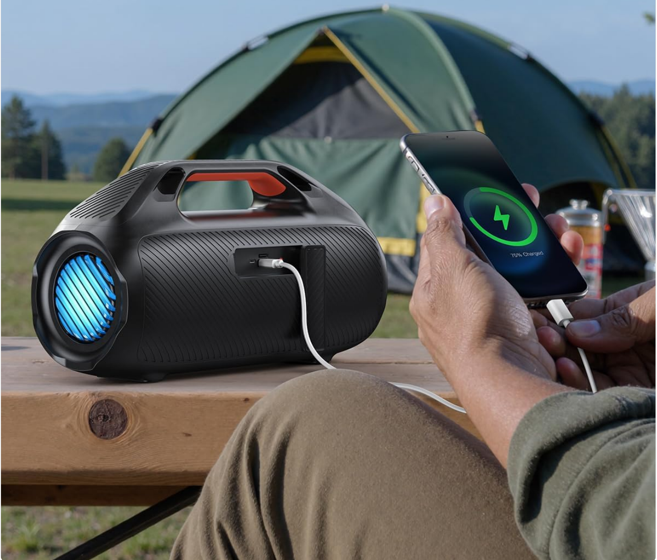
Figure 3: The speaker functioning as a movable power supply, charging a smartphone via its USB-A port. This feature is useful for keeping devices powered during outdoor activities.

No worries about your device losing power or missing any important news when you're at the camp, travels