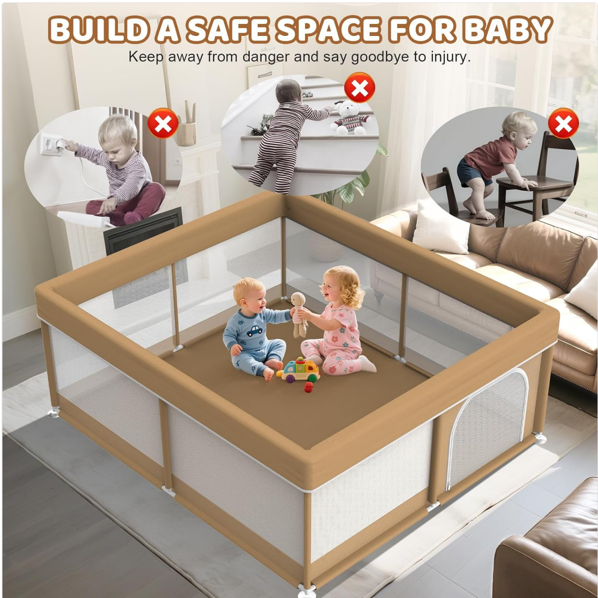
Image showing two babies playing safely inside the Omzer Baby Play Yard. Surrounding images with red 'X' marks illustrate common household dangers like electrical outlets, stairs, and unstable furniture, emphasizing the play yard's role in creating a safe environment.

Keep away from danger and say goodbye to injury.