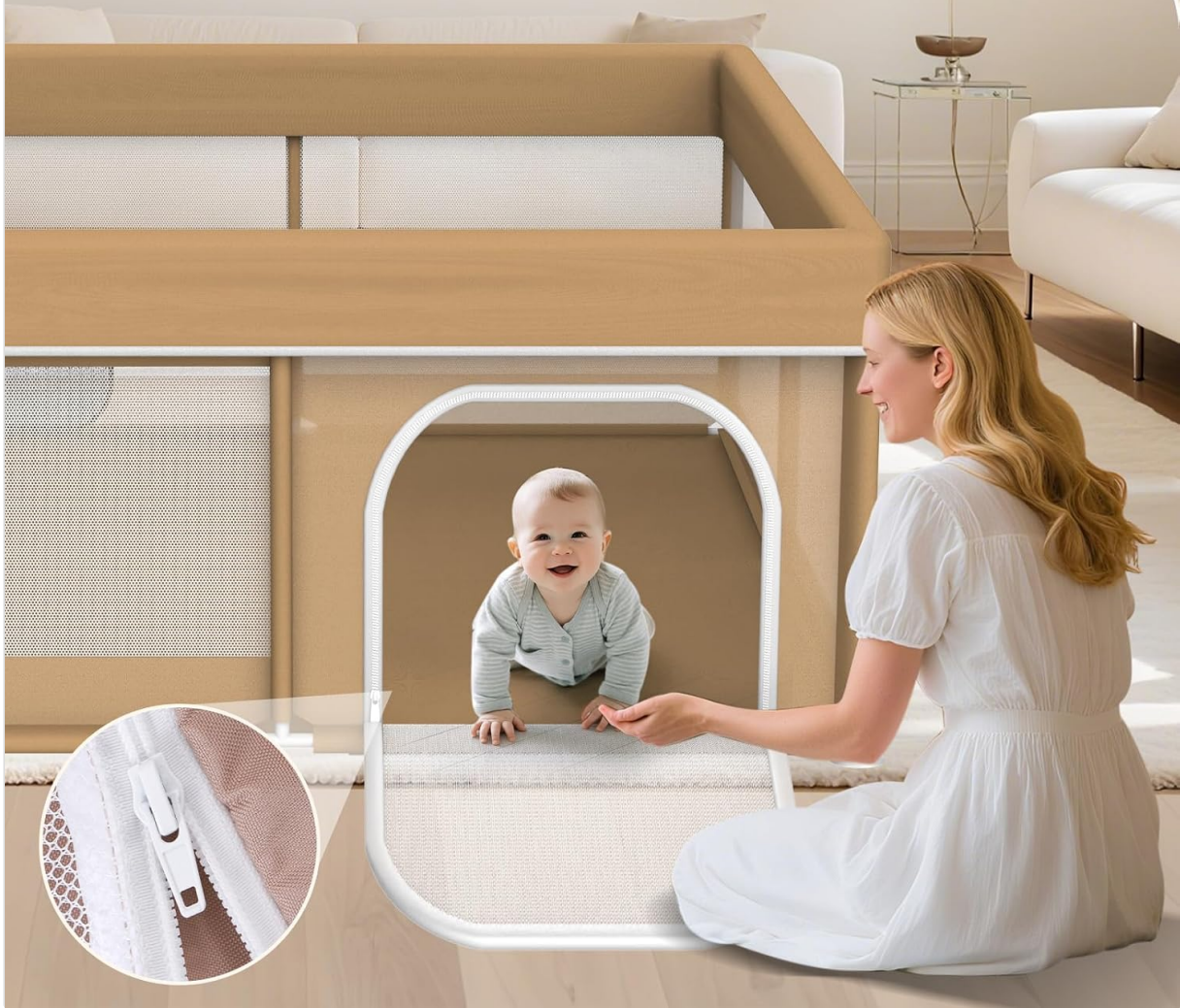
Image showing an adult opening the external zipper door of the play yard, with a baby crawling inside. A close-up inset shows the zipper mechanism, emphasizing its external operation for child safety.

The external zipper door can only be opened from the outside by parents, which greatly enhances the safety of the baby.