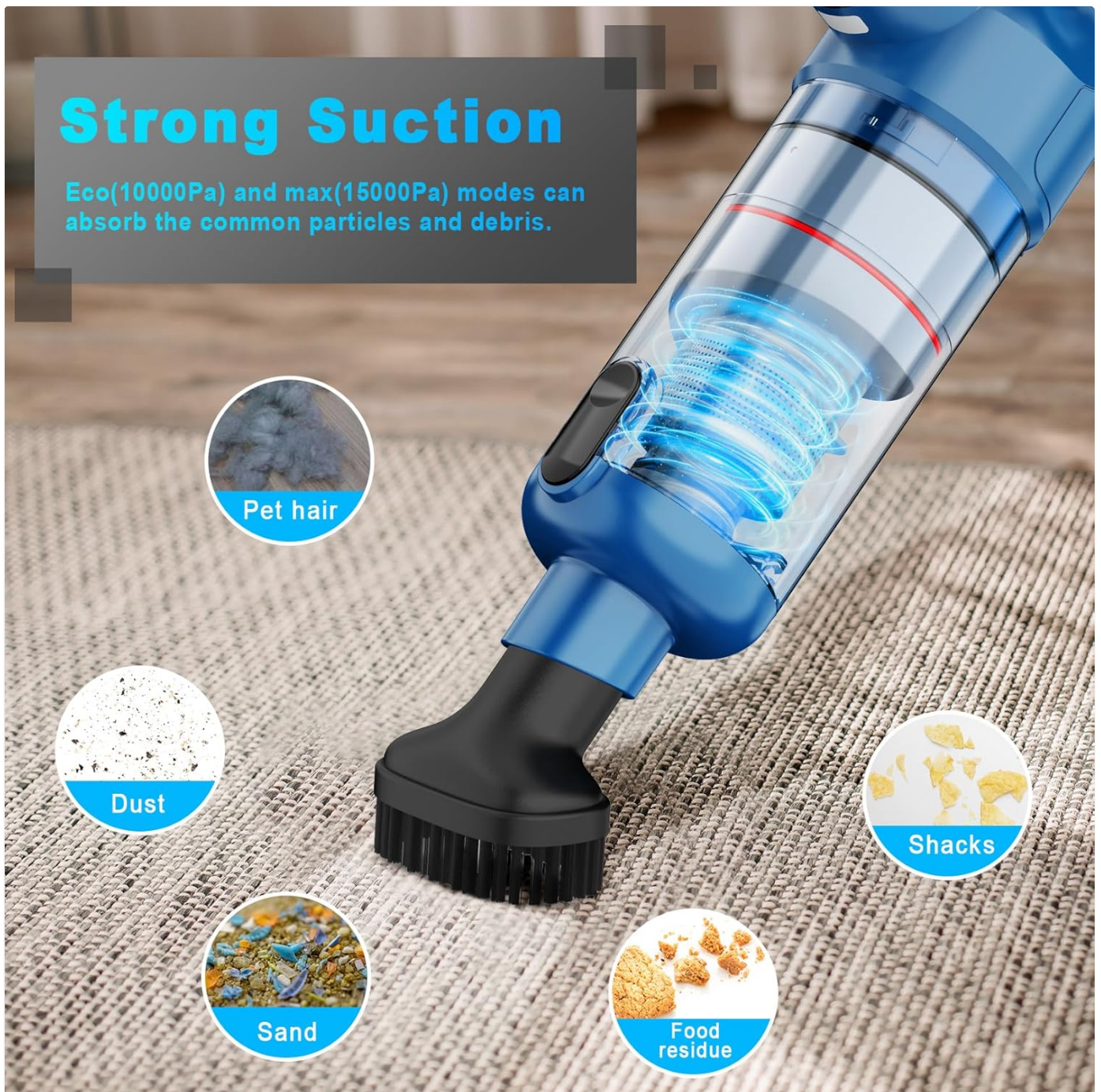
Image: Shows the vacuum effectively absorbing various common particles and debris, including pet hair, dust, sand, and food residue, using both Eco (10000Pa) and Max (15000Pa) modes.

Eco(10000Pa) and max(15000Pa) modes can absorb the common particles and debris.