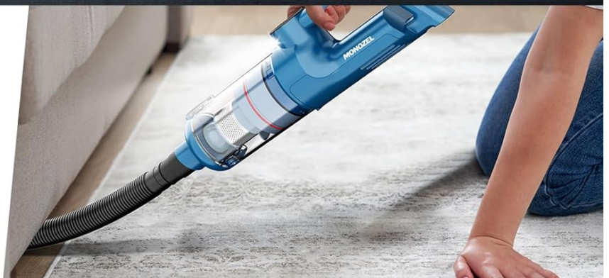
Image: Demonstrates the use of the flat and wide mouth brush for sofas, the long nozzle for car interiors, and the flexible hose for reaching under furniture or into tight spaces.

Flexible Hose, Brush conversion, used for places that are not directly accessible