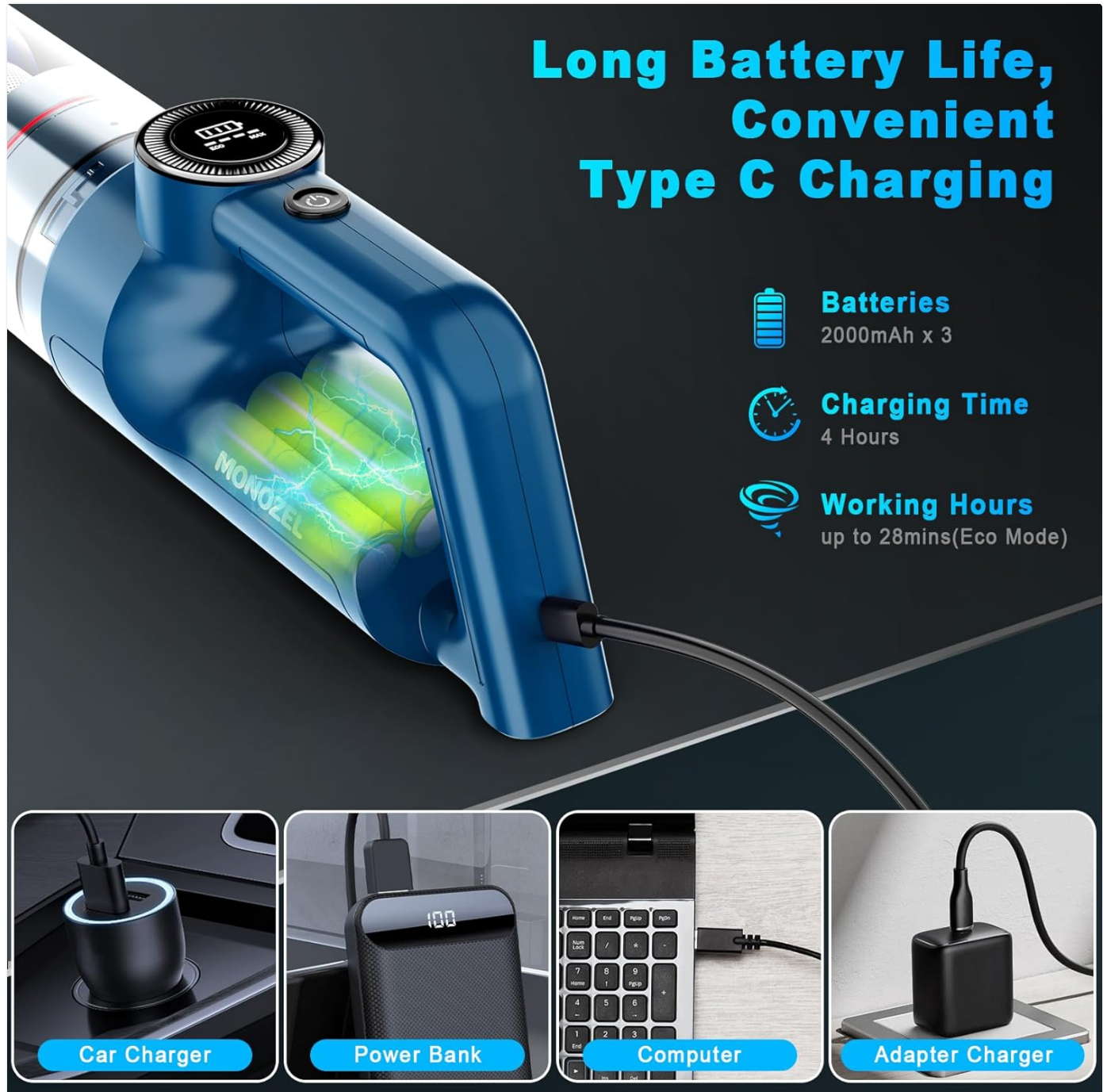
Image: The vacuum cleaner connected via a Type-C cable, illustrating various charging methods including car charger, power bank, computer, and wall adapter.