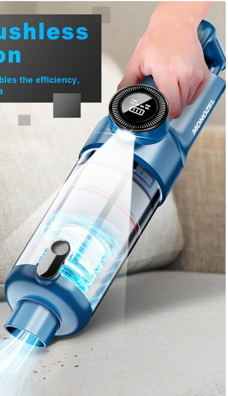
Image: Illustrates the powerful brushless motor operating at 64000 RPM, generating 15000 Pa maximum suction for efficient cleaning.