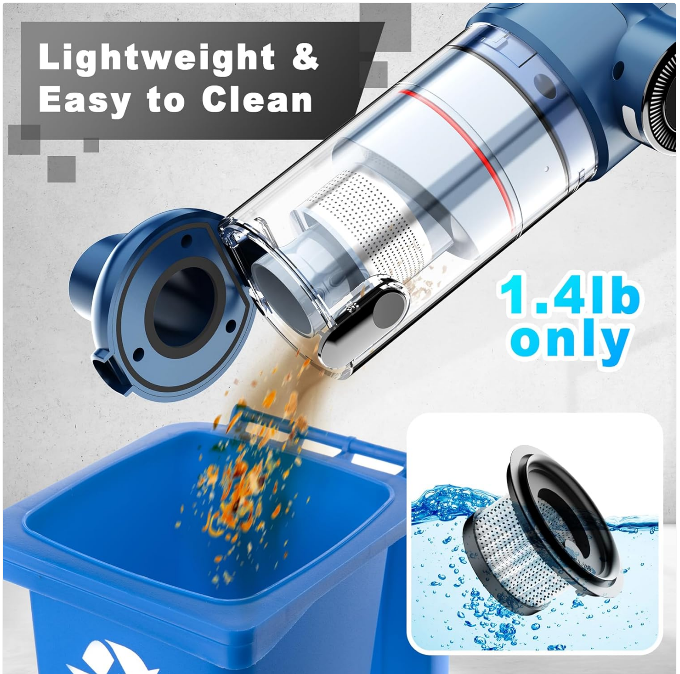
Image: Depicts the process of emptying the dust cup into a trash bin and the separate cleaning of the HEPA filter with water.