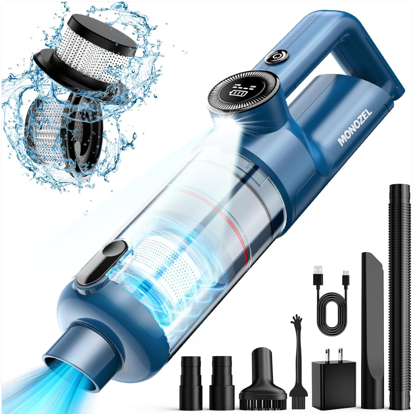
Image: The MONOZEL VC028 handheld vacuum cleaner displayed with its full set of accessories, including various nozzles, brushes, charging cable, and spare filters.