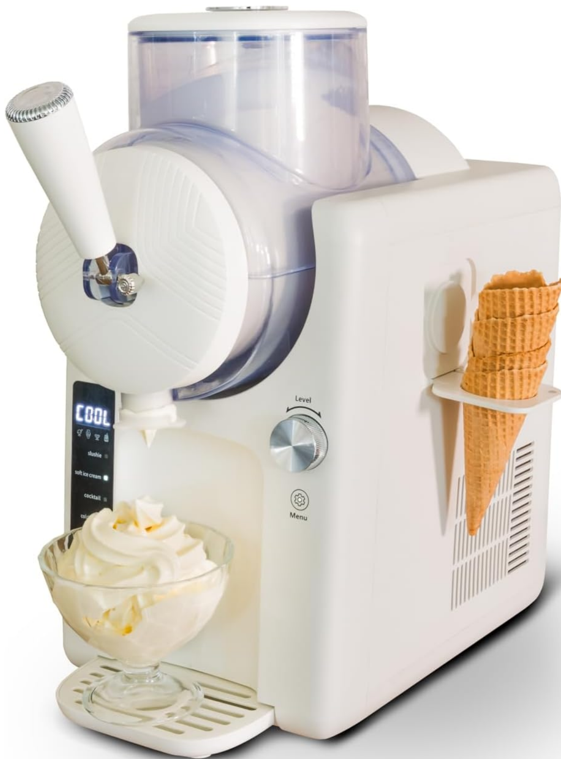
Image: The Unold 48950 machine in white, shown dispensing soft serve ice cream into a glass bowl. The machine features a clear top lid, a control knob, and a digital display.