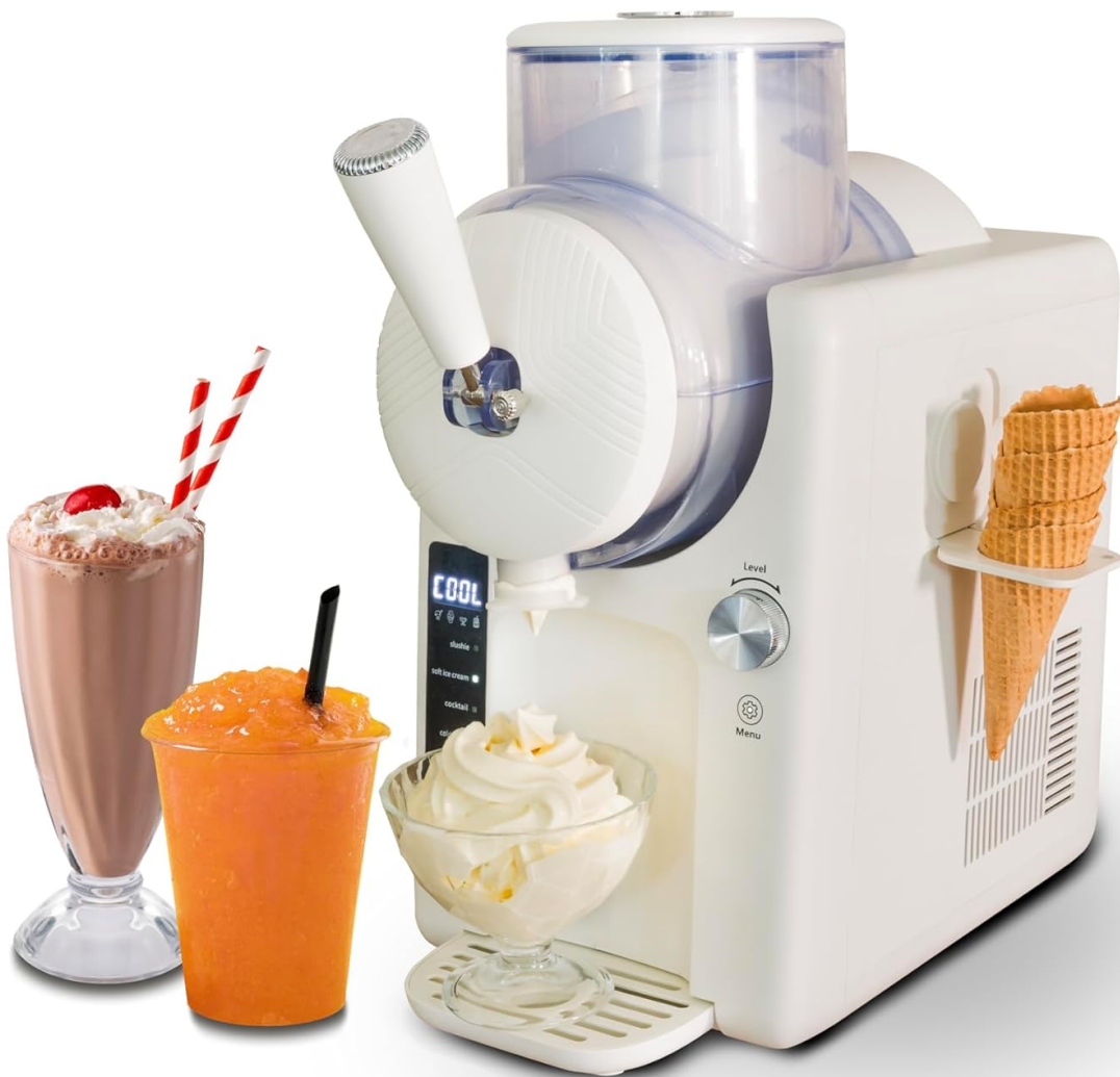
Image: The Unold 48950 machine displayed with three different finished products: a glass of soft serve ice cream, a cup of orange slush, and a chocolate milkshake, showcasing its versatility.