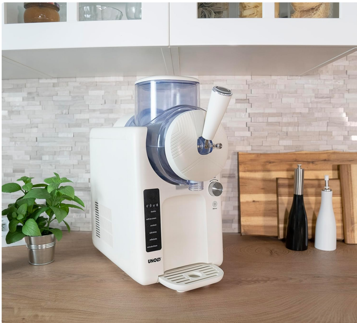
Image: The Unold 48950 machine positioned on a wooden kitchen counter, with a plant and kitchen accessories in the background, demonstrating its compact size and placement in a home environment.