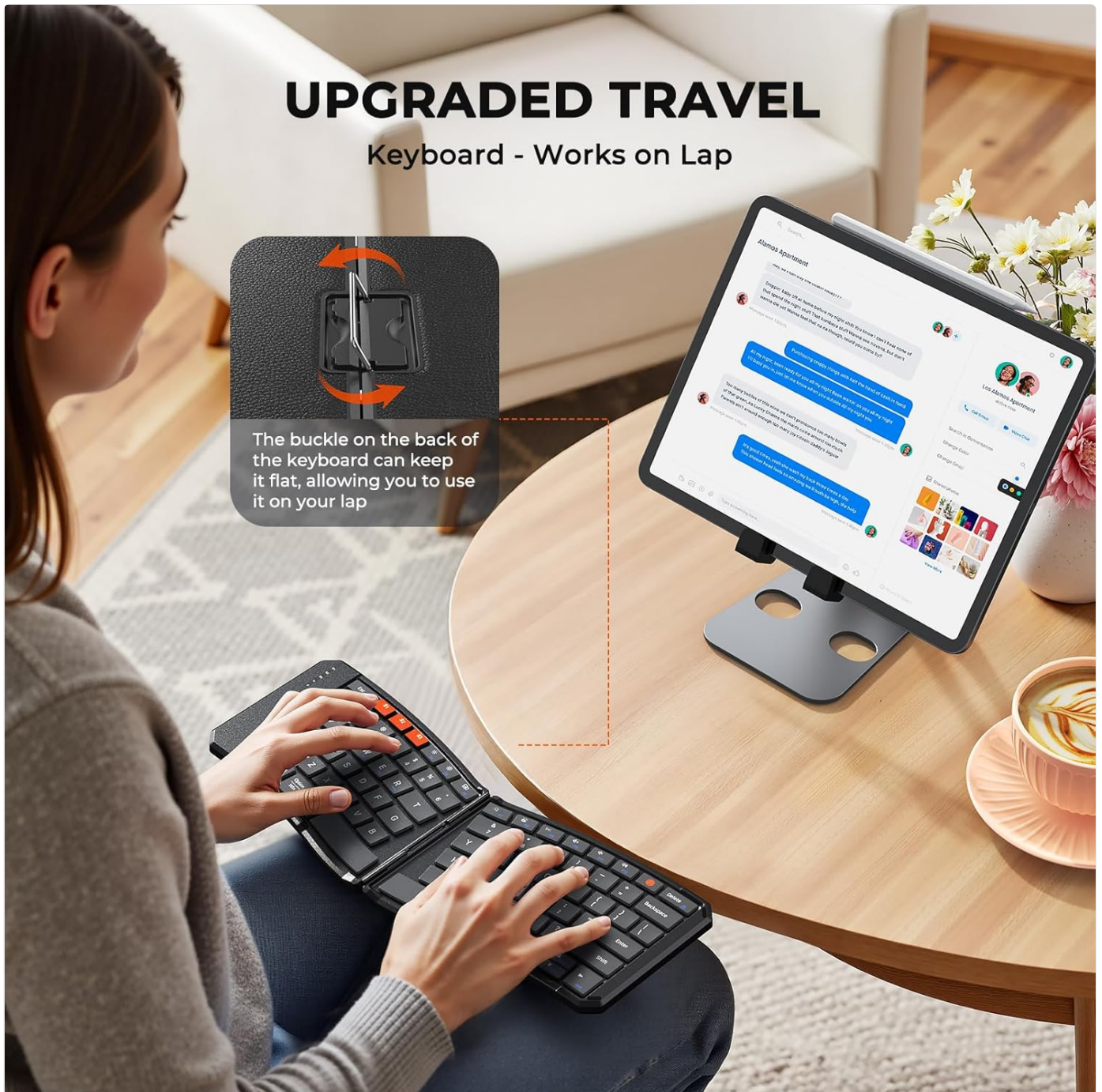
Image: A user typing on the MEETION K9880 keyboard placed on their lap, demonstrating the stability provided by the integrated metal support wire on the back.