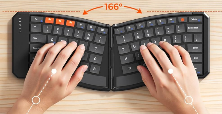
Image: A comparison illustrating the ergonomic advantage of the MEETION K9880's 166-degree split design over traditional flat keyboards, emphasizing reduced wrist strain.