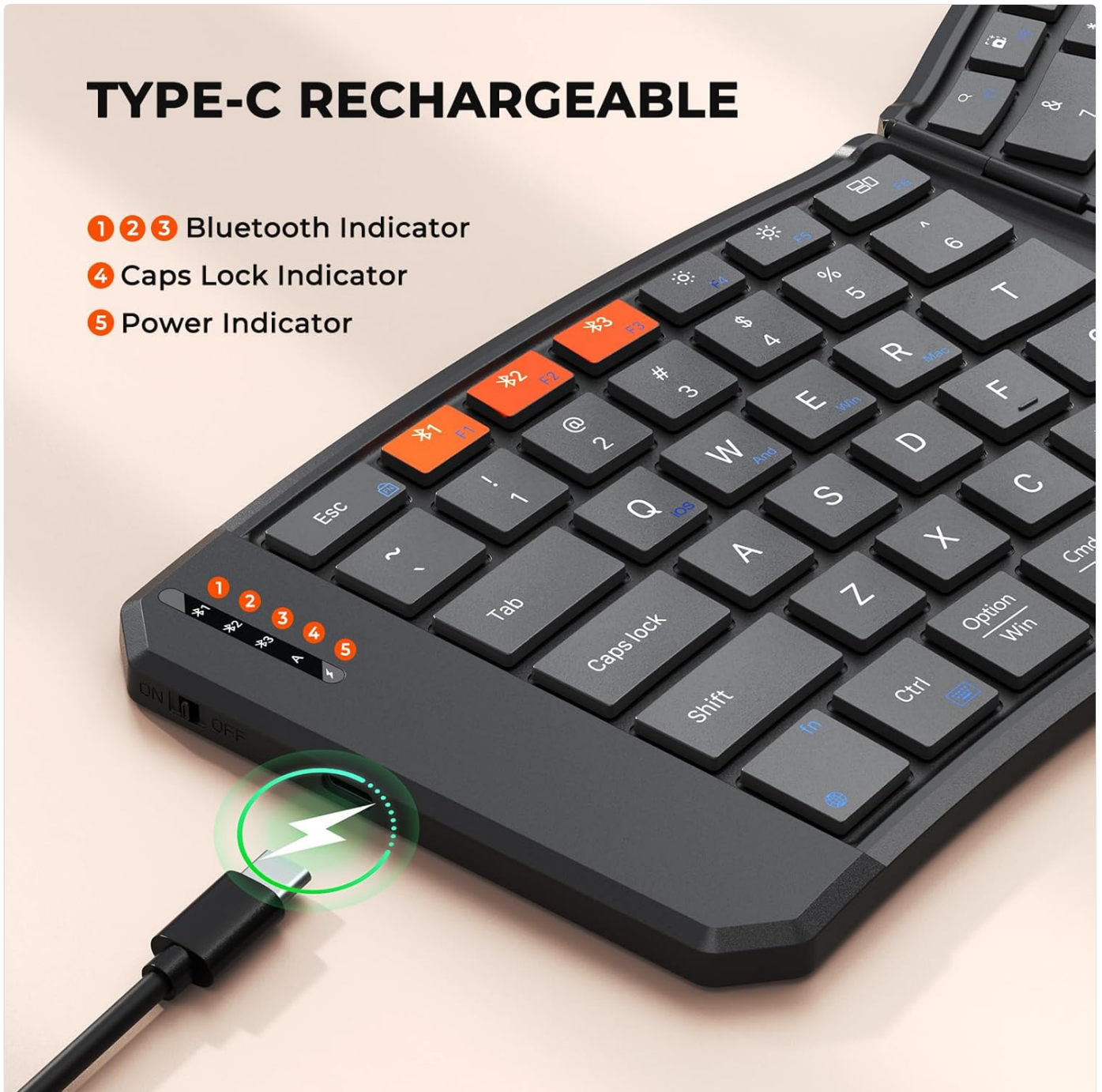
Image: The MEETION K9880 keyboard with a USB Type-C cable connected, illustrating the charging process and the location of the power indicator light.