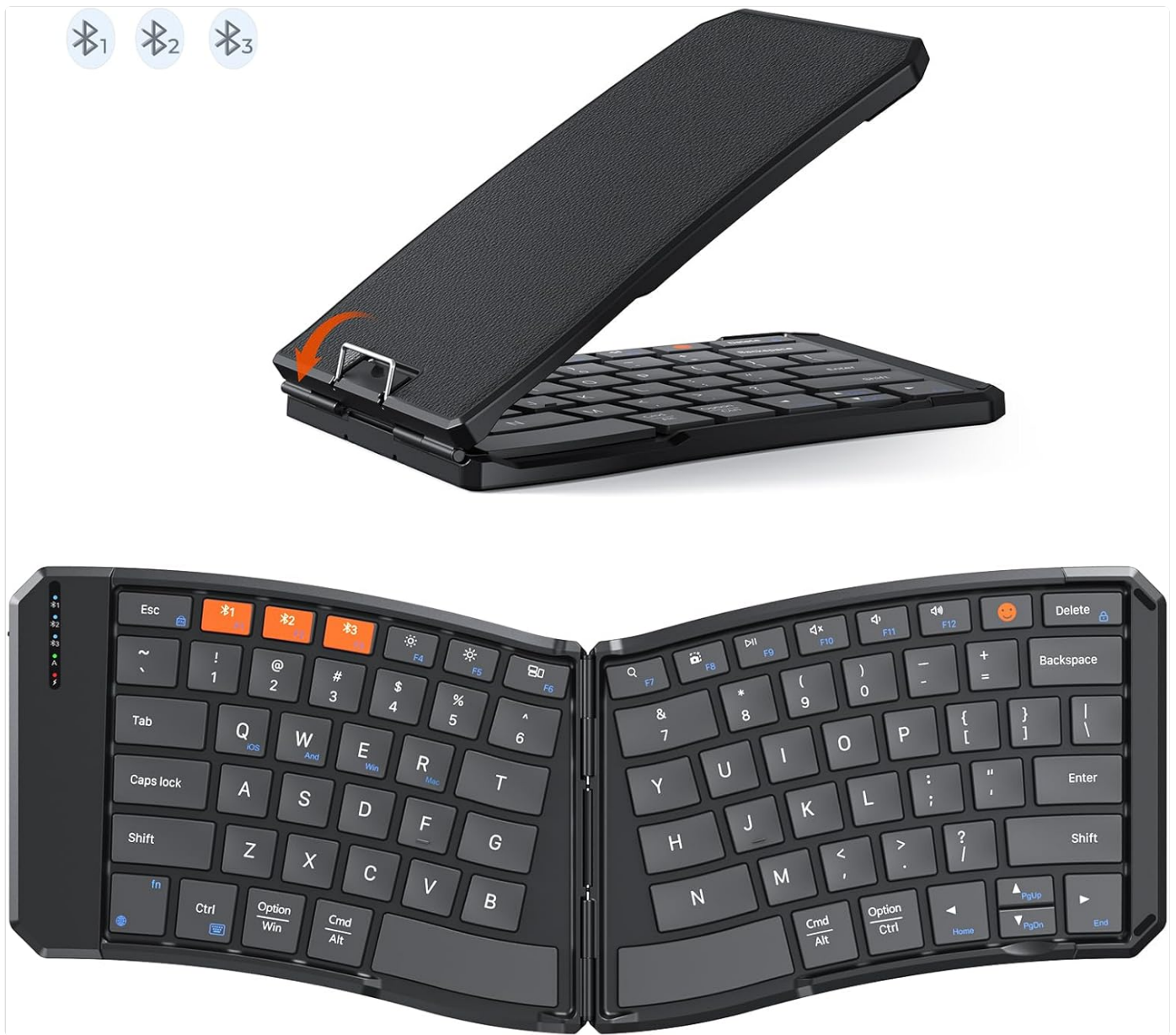
Image: The MEETION K9880 keyboard shown in both its compact folded state and its fully unfolded, ready-to-use configuration, highlighting its portability and ergonomic design.