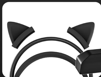
Detachable Cat Ears