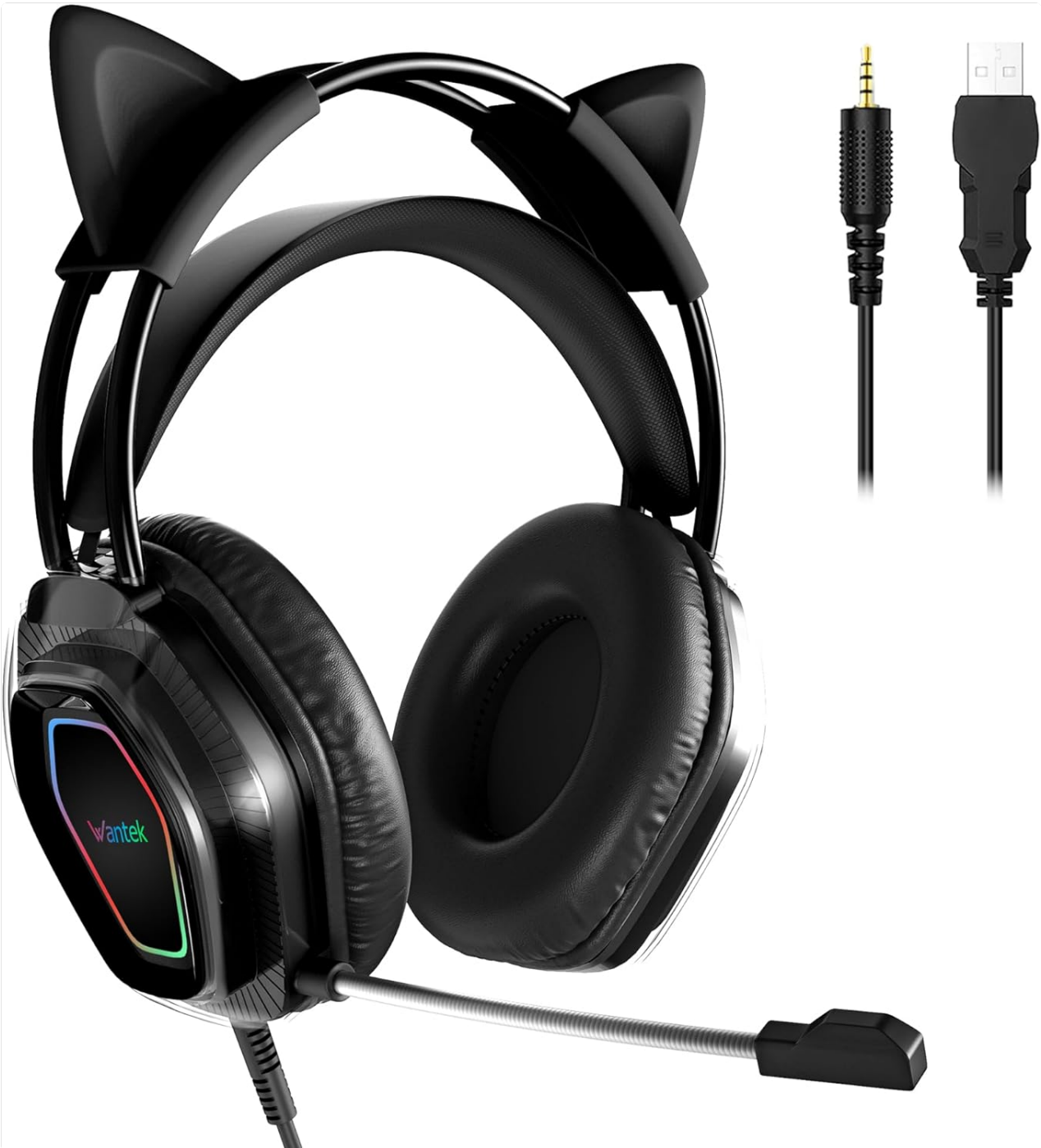
Image: The headset showing its 3.5mm audio jack and USB connector for power, ready for connection to various devices.