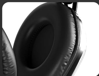
Superior Memory Earmuff