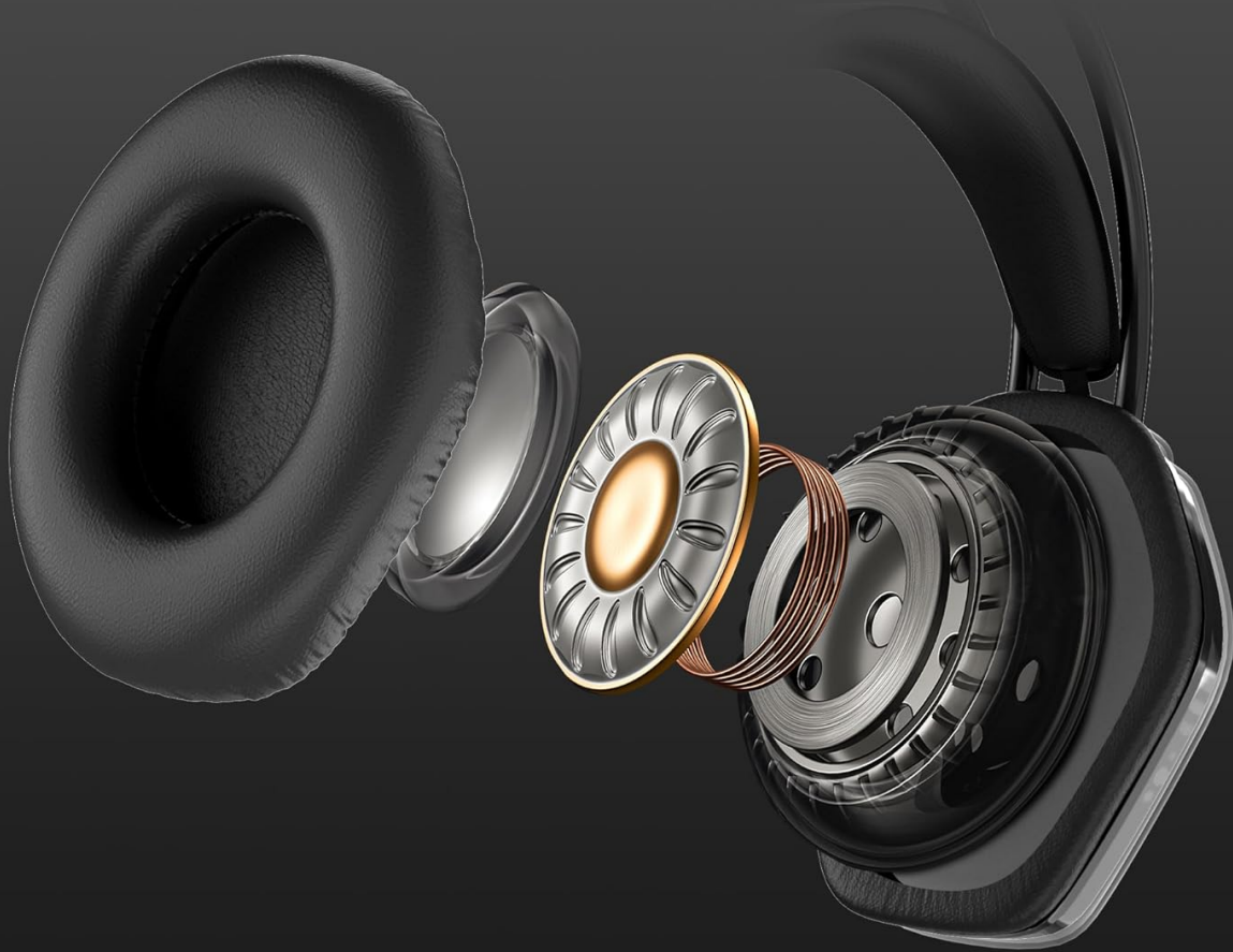
Image: An exploded view illustrating the 50mm precision audio drivers, emphasizing their role in delivering stereo surround sound with wide range, powerful bass, and accurate audio.

Come with immersive audio with wide range, powerful bass and accurate sound.