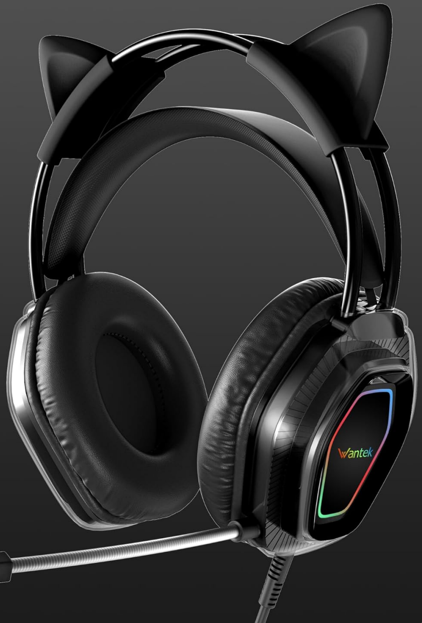
Image: Detailed view of the headset highlighting key features: auto-adjusting headband, RGB/LED lighting on the earcups, superior memory foam earmuffs, and detachable cat ears.