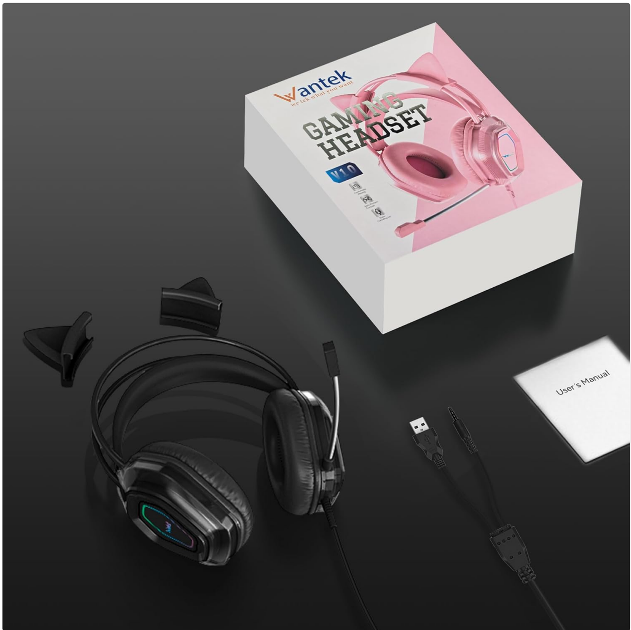
Image: The Wantek Cat-Ear Gaming Headset V10, showing the headset, detachable cat ears, 3.5mm audio adapter, and user manual.