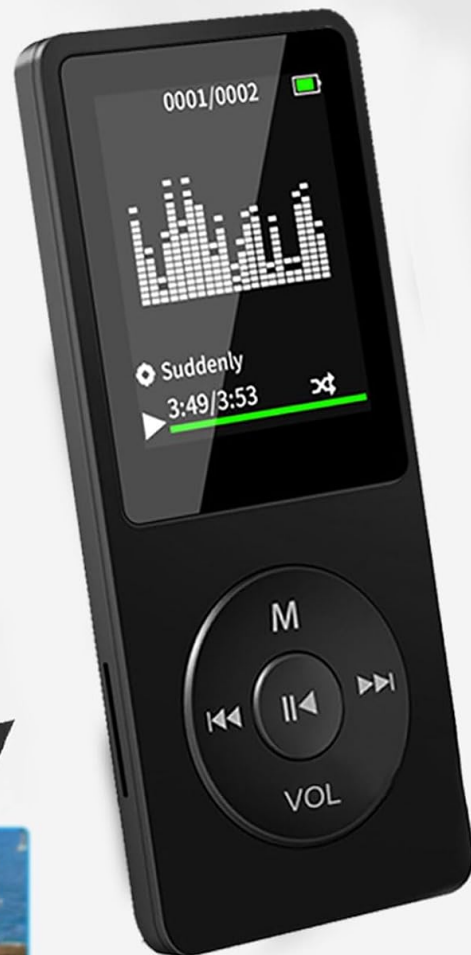
Image: Illustration of the MP3 player's expandable storage capacity.