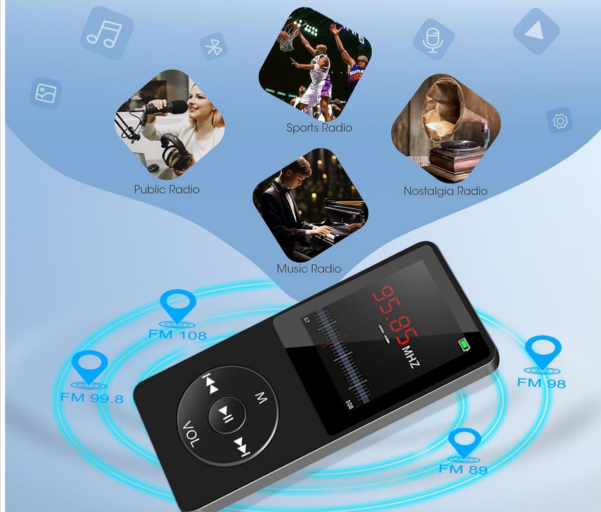
Image: FM Radio interface and recording function.

Listen to FM radio and record it anytime, anywhere