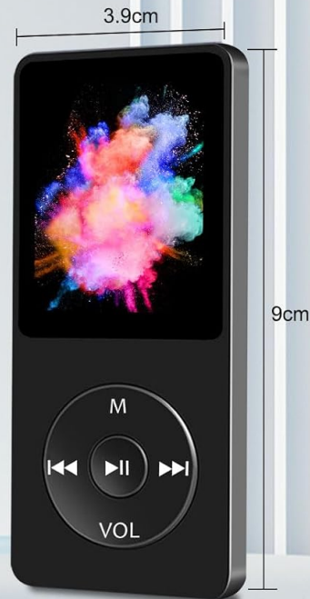
Image: Bluetooth 5.0 connectivity and music playback modes.