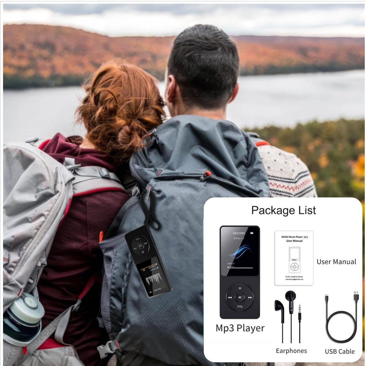
Image: Contents of the Wodgreat MP3 Player package.