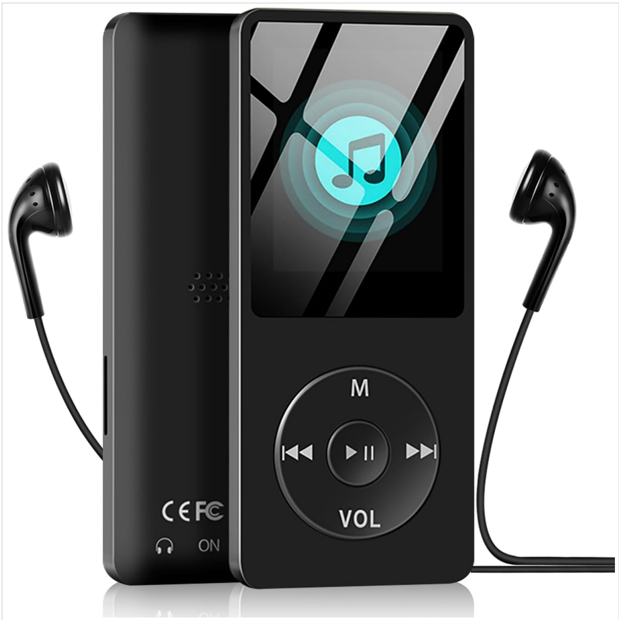
Image: Front and side view of the Wodgreat MP3 Player.