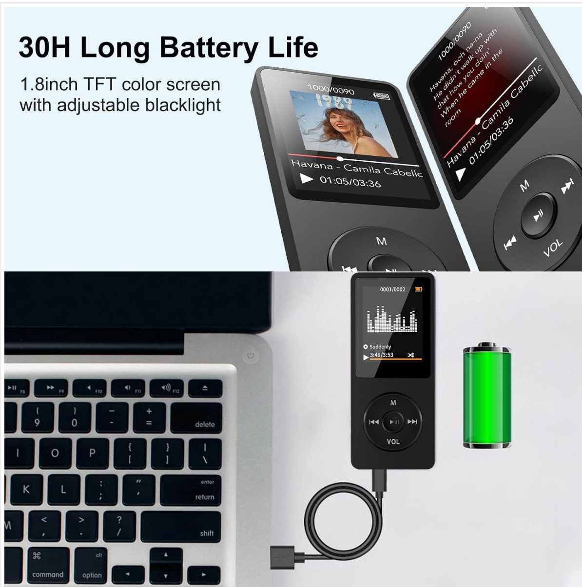
Image: MP3 player charging via USB connection.

1.8inch TFT color screen with adjustable backlight