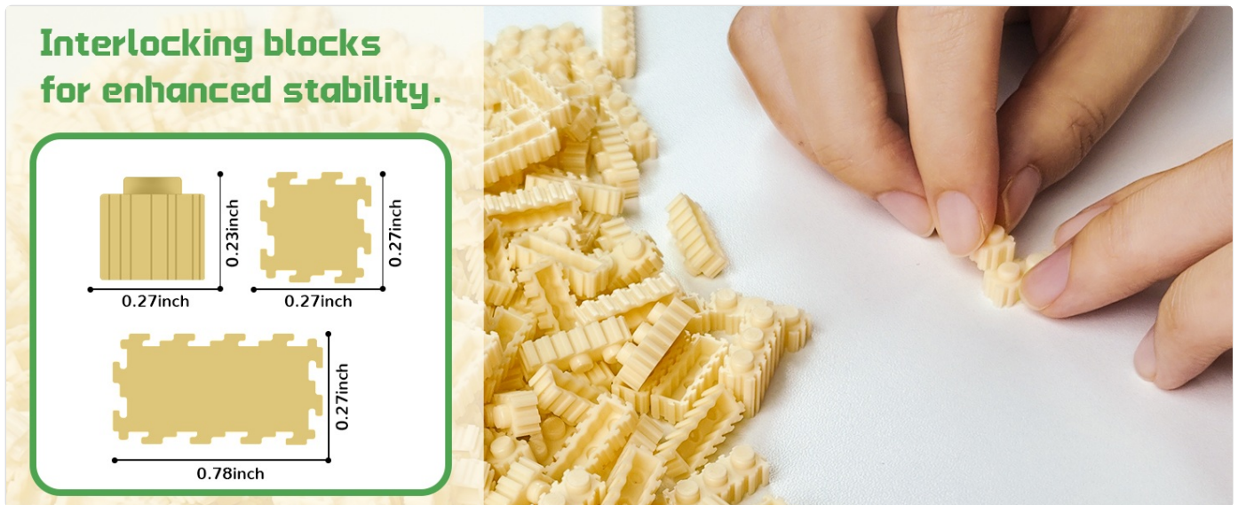
Image 3.1: Detail showing the interlocking mechanism of the micro blocks for enhanced stability.

specific placements shown in the instructions.