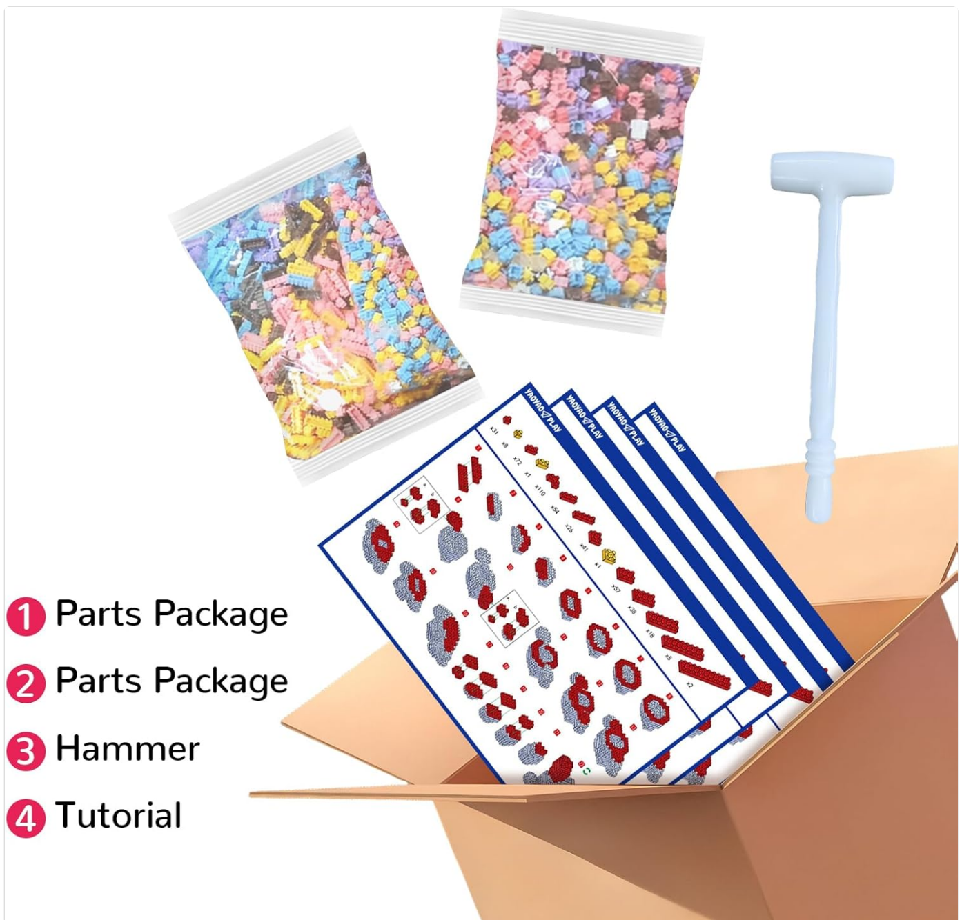
Image 2.1: Contents of the package, including block bags, hammer, and tutorial.