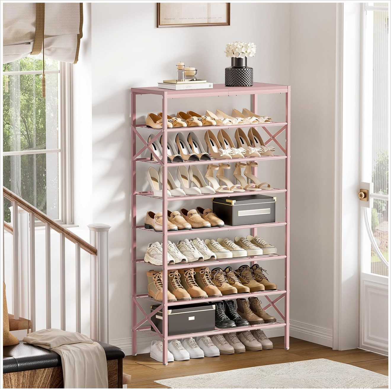
Figure 5: The shoe rack integrated into an entryway, demonstrating its practical use.