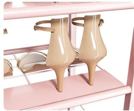
Sheet Iron Support High heels can also be easily stored