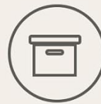
Figure 3: The design allows for removal of a shelf to accommodate taller items like boots or storage boxes.