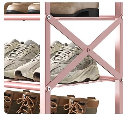
Cross Frames Making the shoe organizer more durable