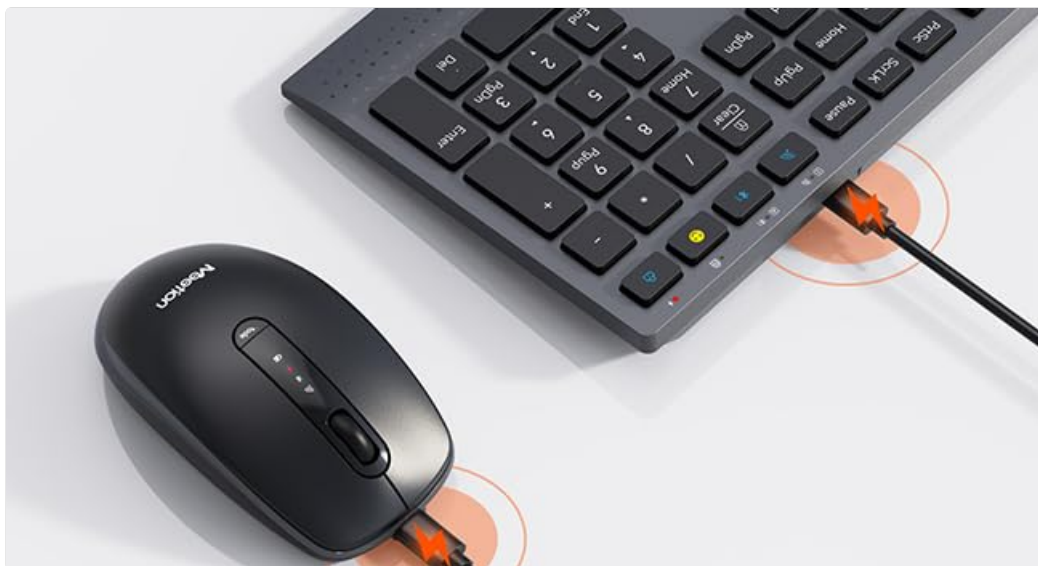
Image: The keyboard and mouse being charged via USB-C cables, showing the charging indicator lights.