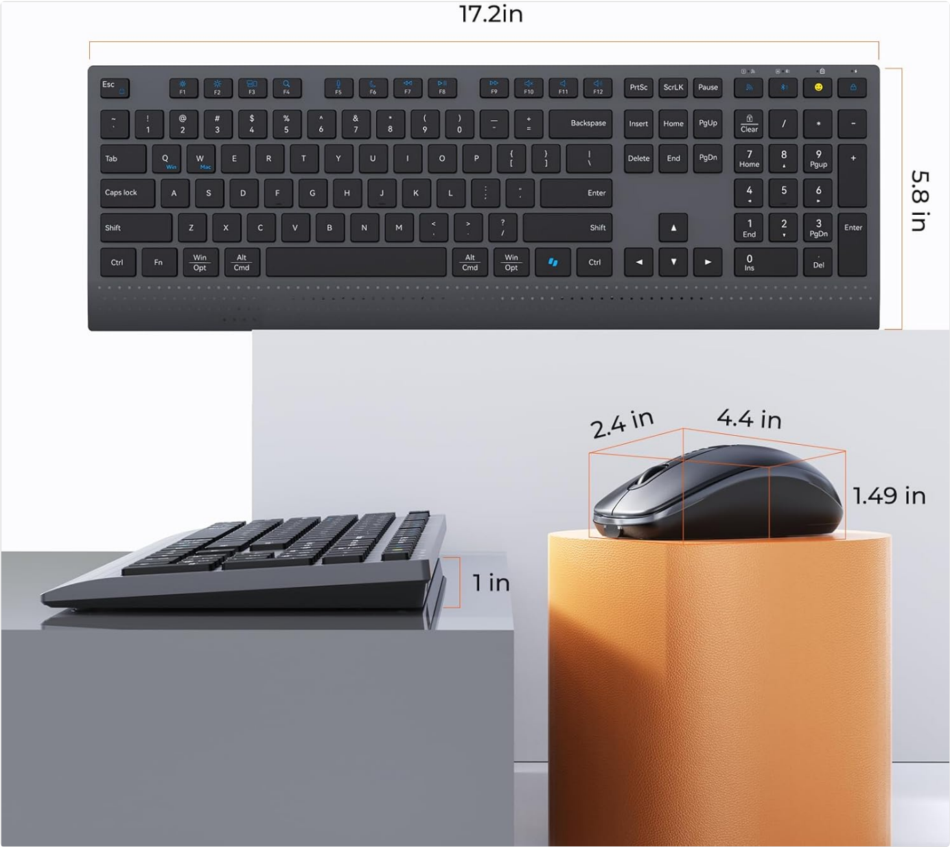
Image: Detailed dimensions of the keyboard (17.2in x 5.8in x 1in) and mouse (4.4in x 2.4in x 1.49in).