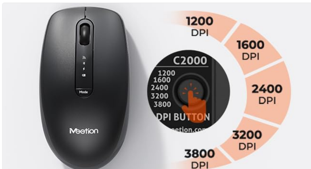
Image: The mouse highlighting its quiet operation and the range of adjustable DPI settings (1200, 1600, 2400, 3200, 3800).