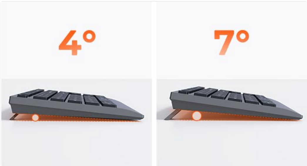
Image: The keyboard demonstrating its two adjustable tilt angles, 4 degrees and 7 degrees, provided by the dual kickstands.

The keyboard also features dual kickstands on the underside, allowing you to adjust the typing angle to 4° or 7° for improved ergonomics and comfort during long typing sessions.