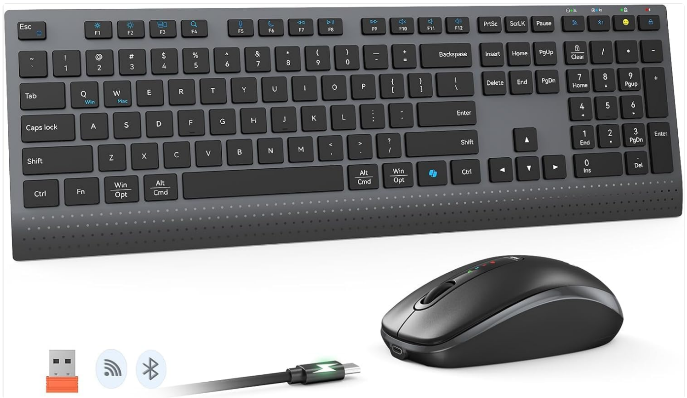
Image: The MEETION C2000 keyboard and mouse combo, showing the keyboard, mouse, USB receiver, and USB-C charging cable.