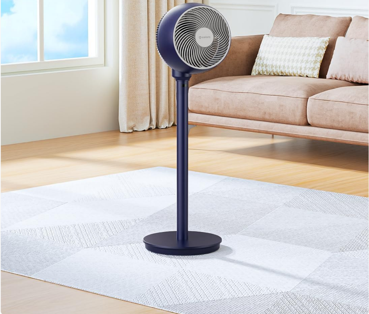
Image 4.1: Visual representation of the fan's multi-functional design, highlighting features such as ABS material construction, 12 wind adjustment levels, Storm Gear fan blade design, a 12-hour timer, and remote control operation.