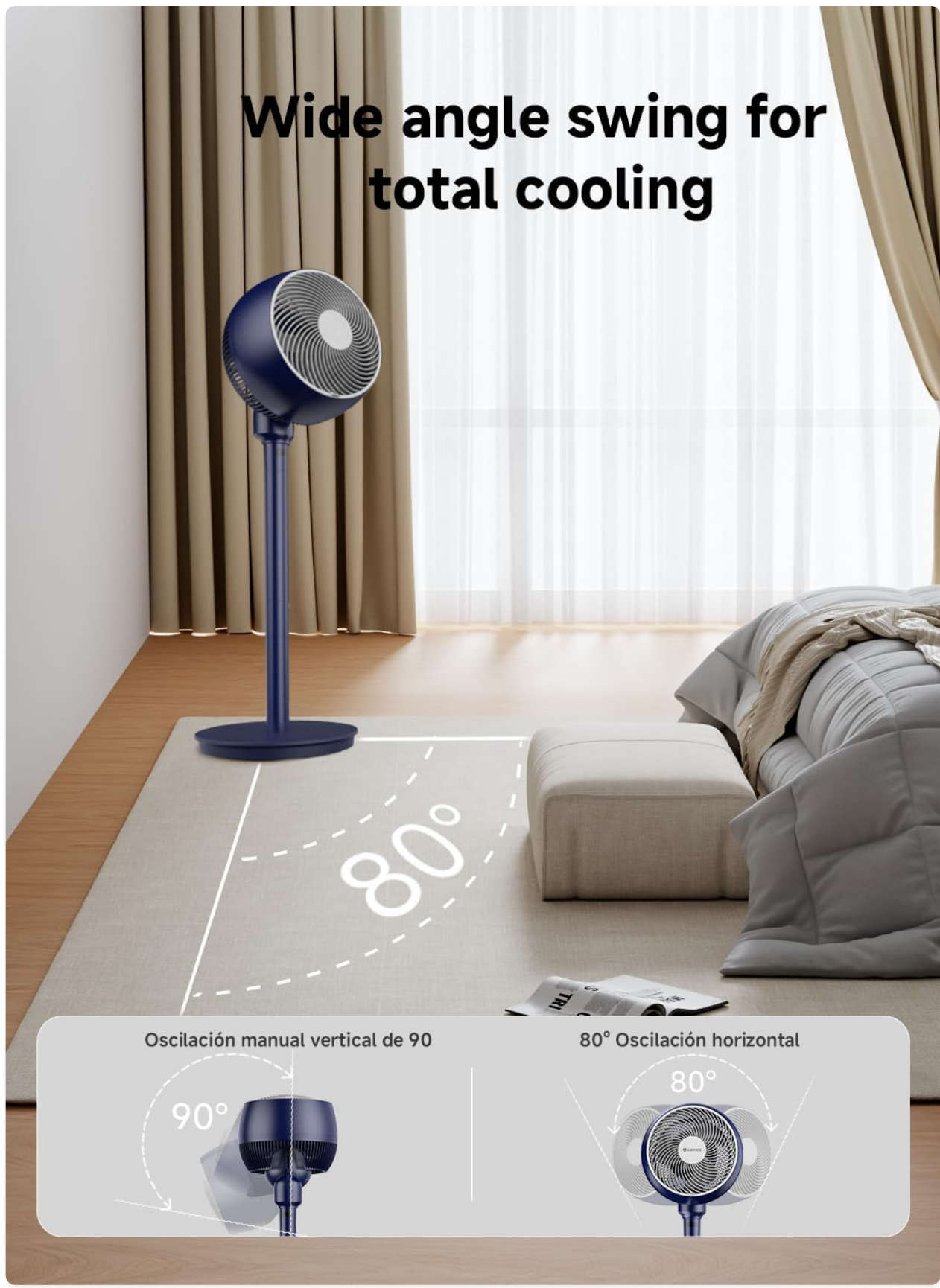
Image 4.2: Diagram illustrating the fan's wide-angle swing capabilities, showing both the 80° horizontal oscillation and the 90° manual vertical oscillation for comprehensive cooling coverage.