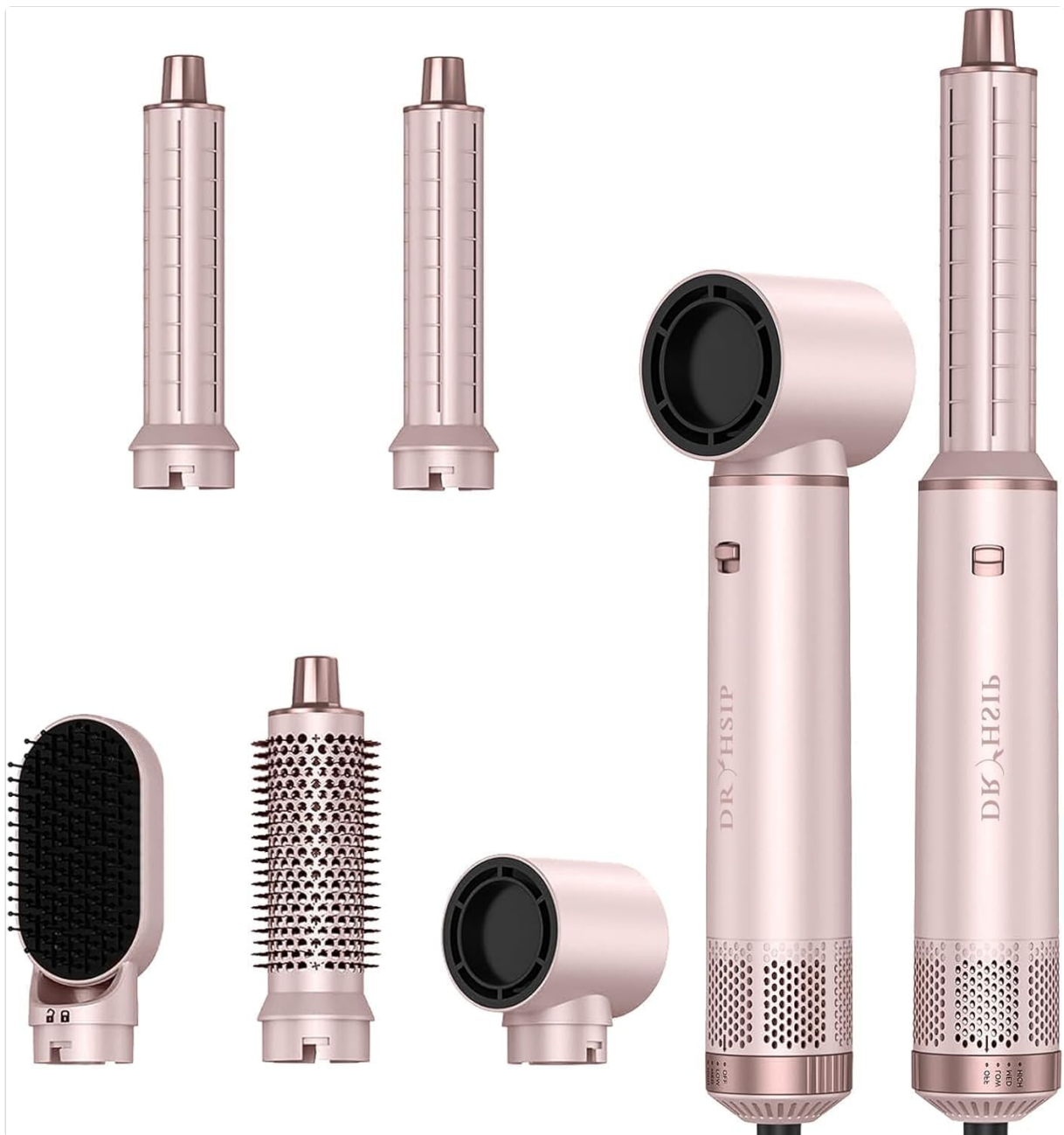
Figure 1: All components of the Dryhsip 5-in-1 Hair Styler. This image displays the main unit, drying nozzle, smoothing brush, round brush, and both left and right curling barrels.