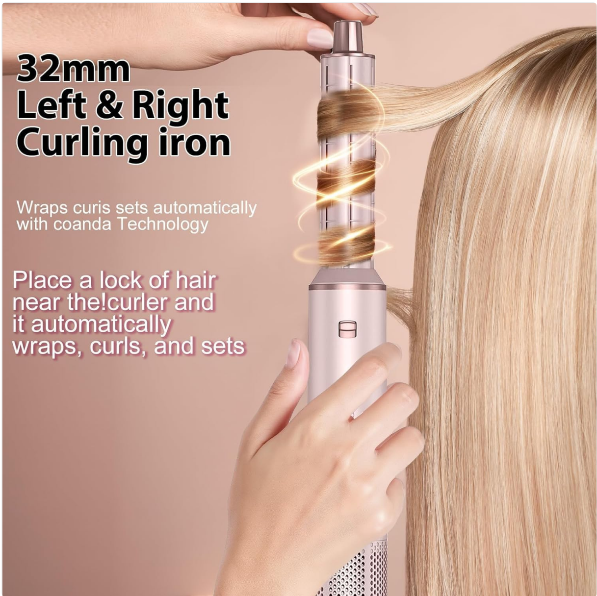
Figure 5: The 32mm left and right curling barrels demonstrating the automatic hair wrapping feature for effortless curls.

Place a lock of hair near the curler and it automatically wraps, curls, and sets