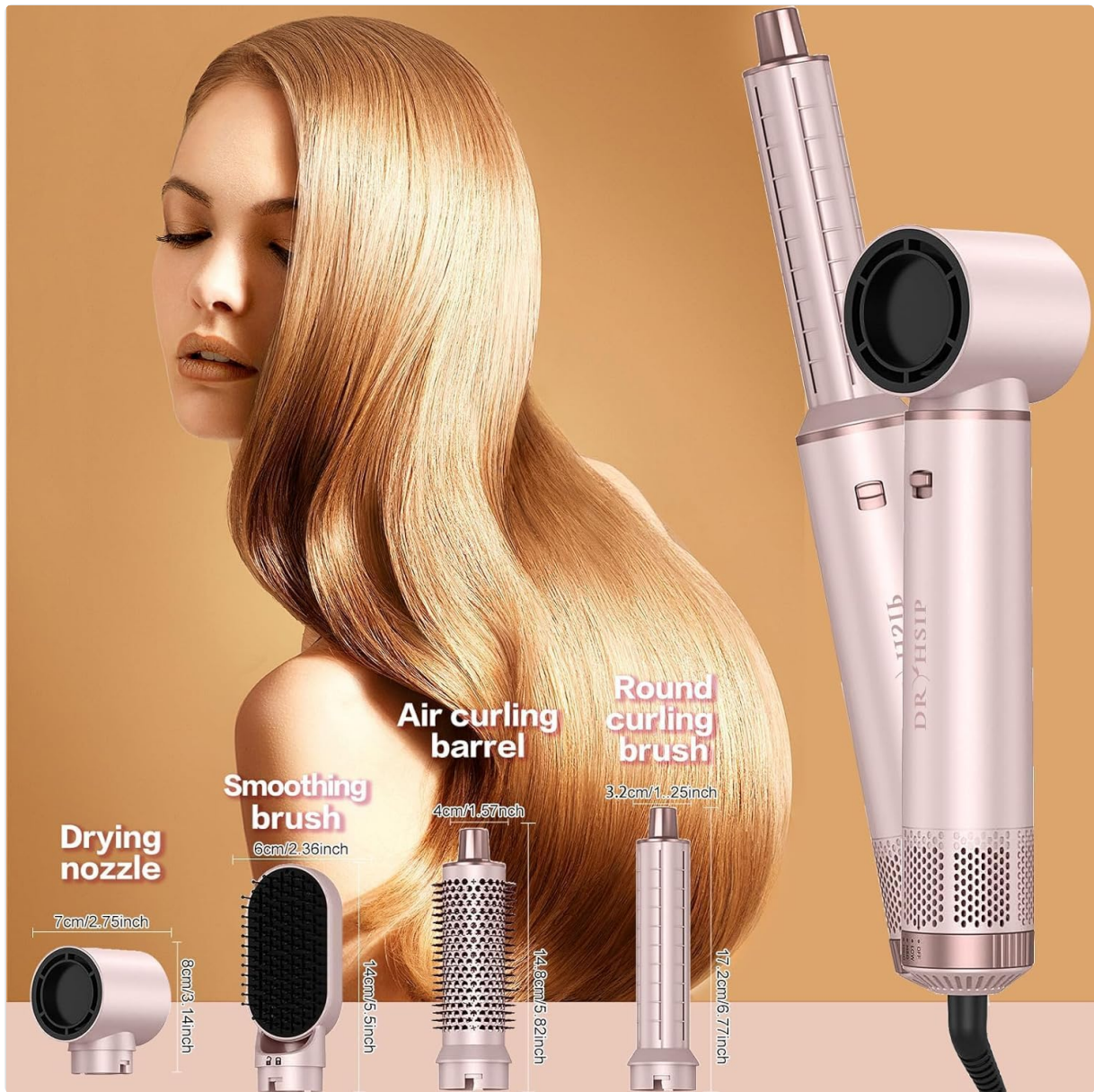
Figure 7: A parameter table illustrating the dimensions of the main unit and each interchangeable attachment.