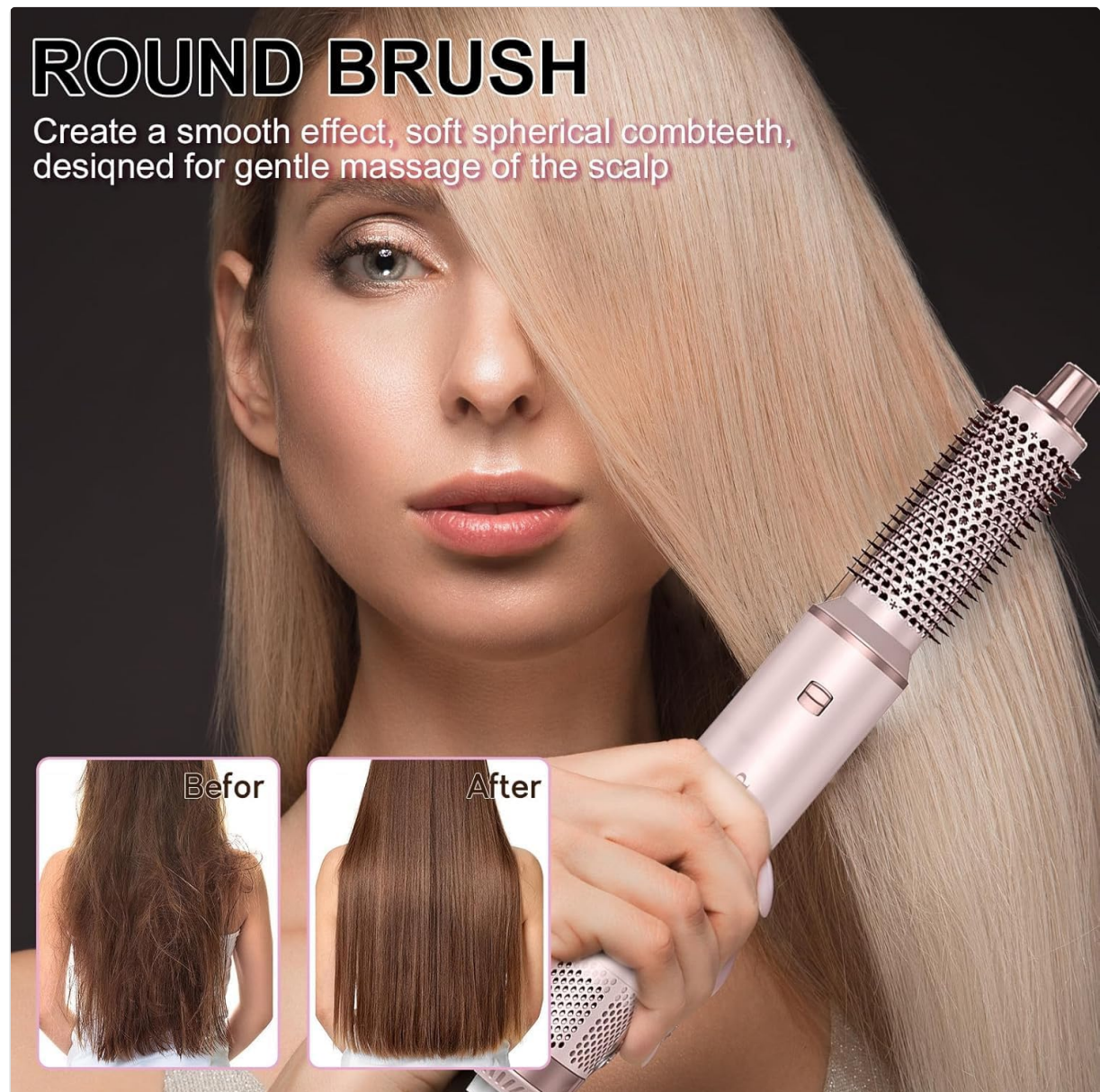
Figure 3: A user demonstrating the straightening function with the smoothing brush attachment, resulting in sleek, straight hair.

Attach the smoothing brush. Ensure hair is damp or dry. Section your hair and slowly glide the brush from roots to ends. The negative ionic technology will help reduce frizz and leave hair smooth.