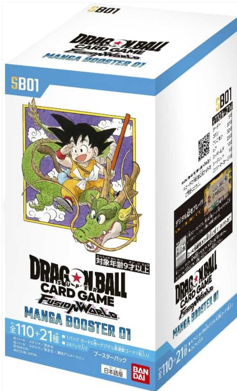
Image 1: The Bandai Dragon Ball Super Card Game Fusion World Manga Booster Box 01. This image displays the exterior packaging of the booster box, featuring Dragon Ball characters and game branding.