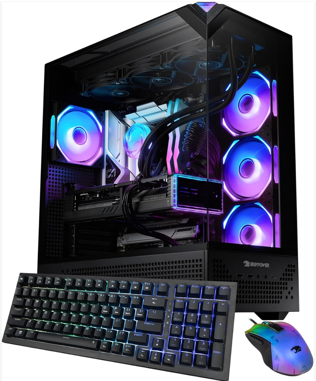
Figure 2.1: The iBUYPOWER Element Pro Gaming PC, accompanied by the included gaming keyboard and RGB gaming mouse. This image displays the complete package contents ready for setup.