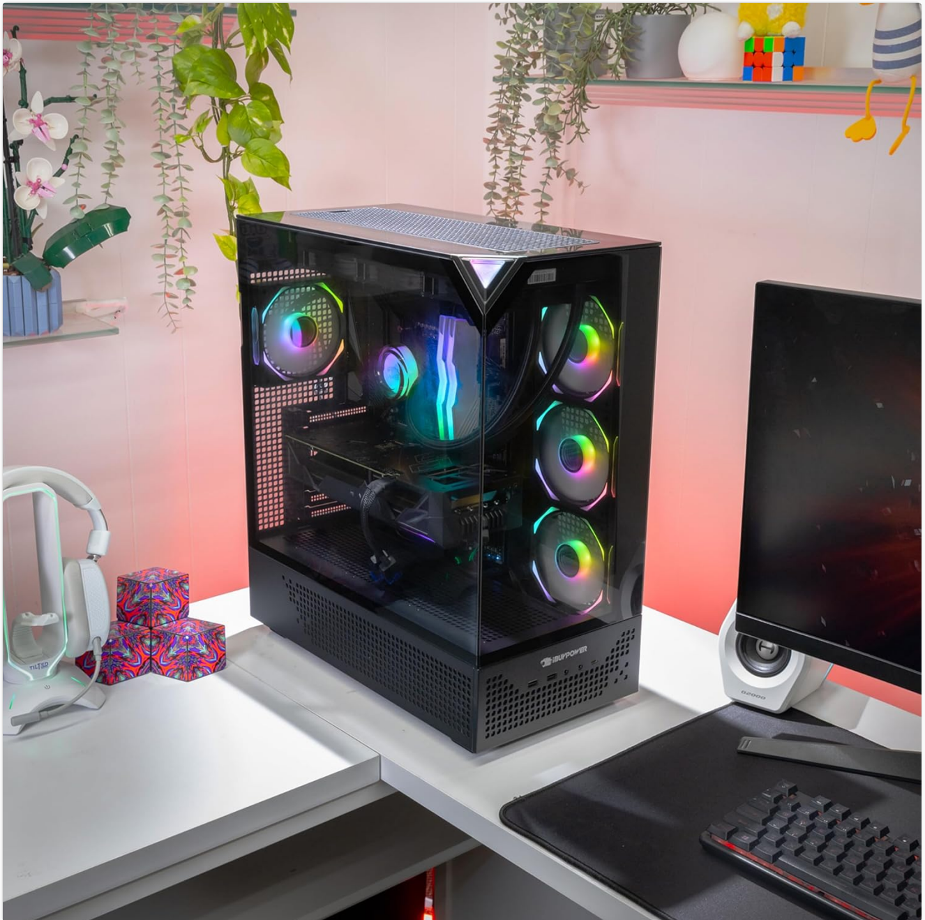
Figure 4.1: A detailed view of the iconic Chimera Corner Power Button, located on the top front of the iBUYPOWER Element Pro PC case. This button is used to power the system on and off.