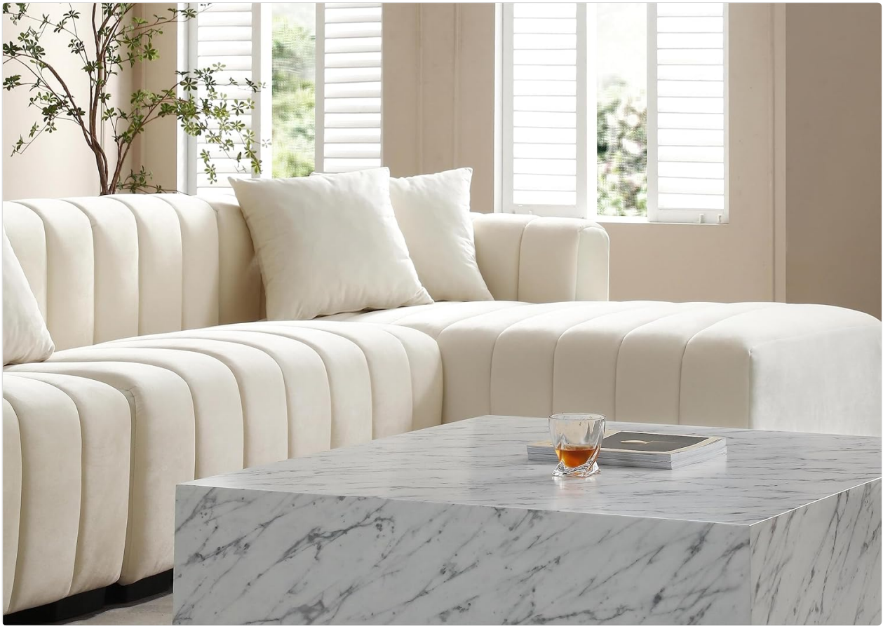
Image 4.4: Close-up view of the deep tufted velvet upholstery and cushions.