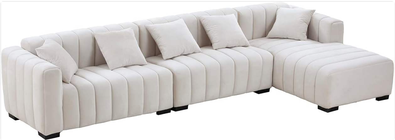
Image 4.3: Front view of the assembled sectional sofa, showing the L-shape configuration.

Position the individual sofa sections and the chaise in the desired L-shape configuration. Use the interlocking brackets (if present) on the sides of the sections to connect them securely. Push the sections together until they lock into place.