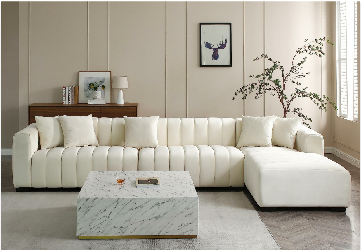
Image 1.1: Overview of the L Shape Sectional Sofa with Right Chaise.

This manual provides instructions for the assembly, operation, and maintenance of your Generic L Shape Sectional Sofa with Right Chaise Modular Sofa. Please read this manual thoroughly before assembly and use to ensure proper function and longevity of your product. Keep this manual for future reference.