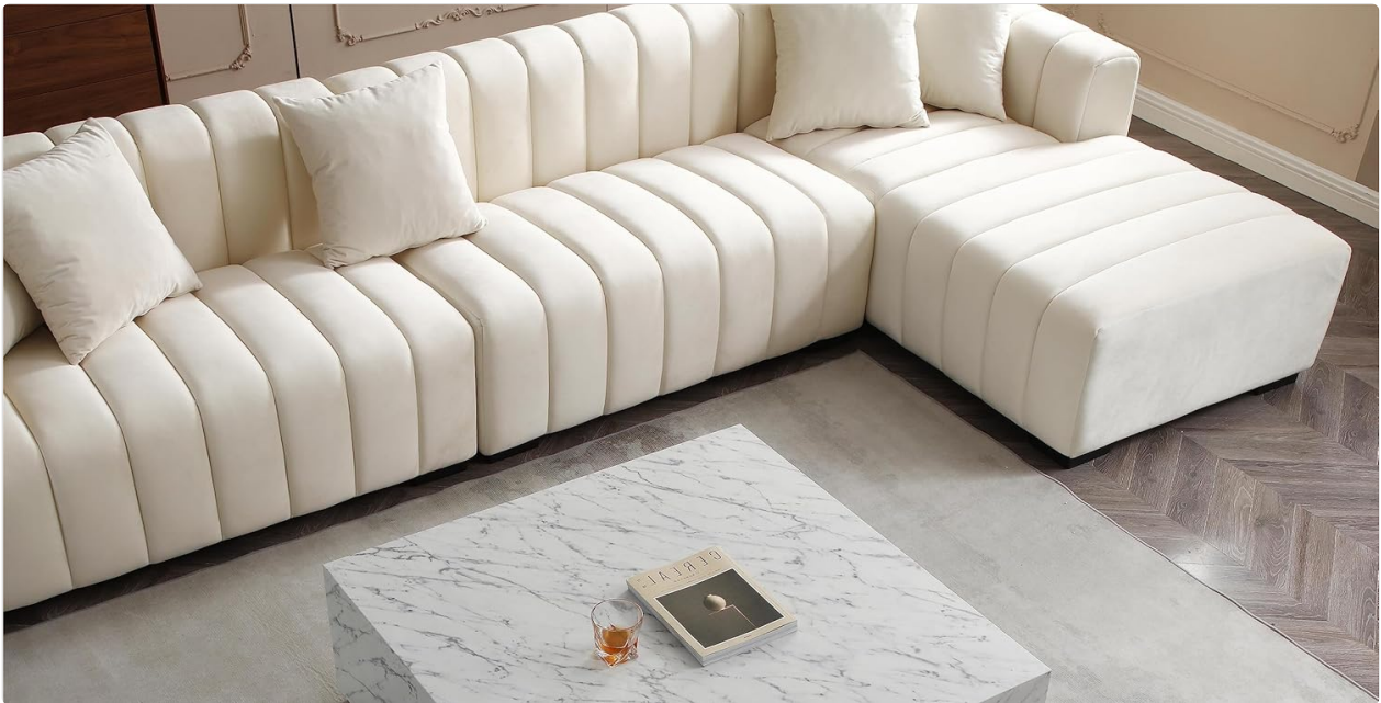
Image 5.1: The sectional sofa integrated into a modern living space.