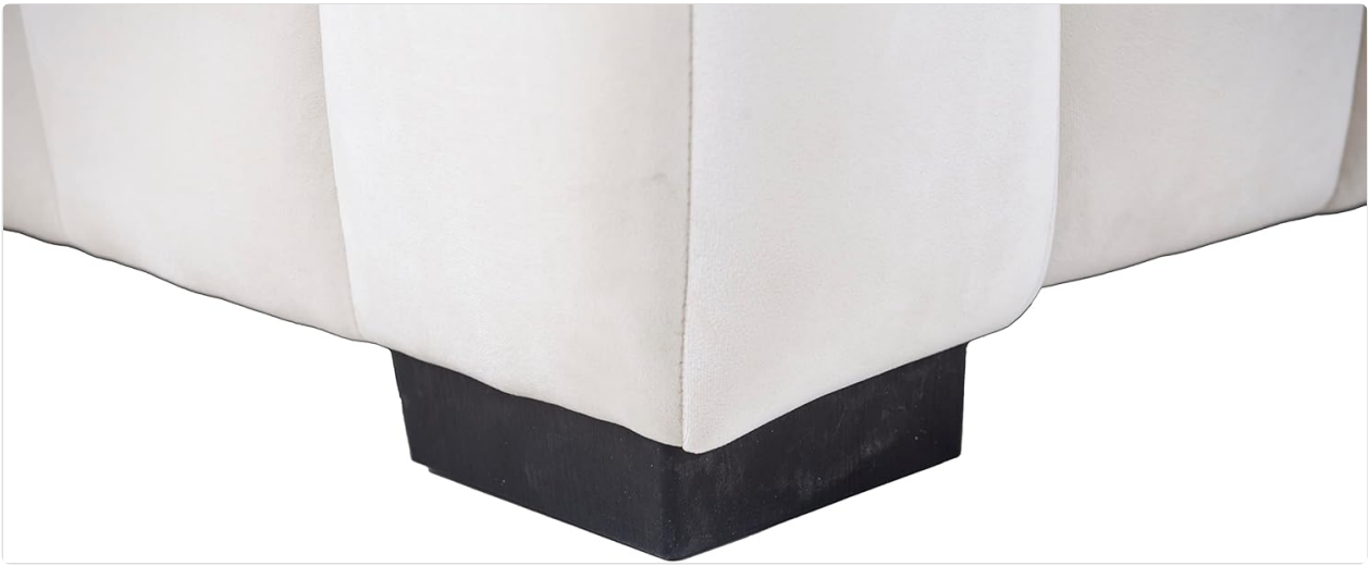
Image 4.2: Example of a sofa leg. Attach legs securely to the base of each section.