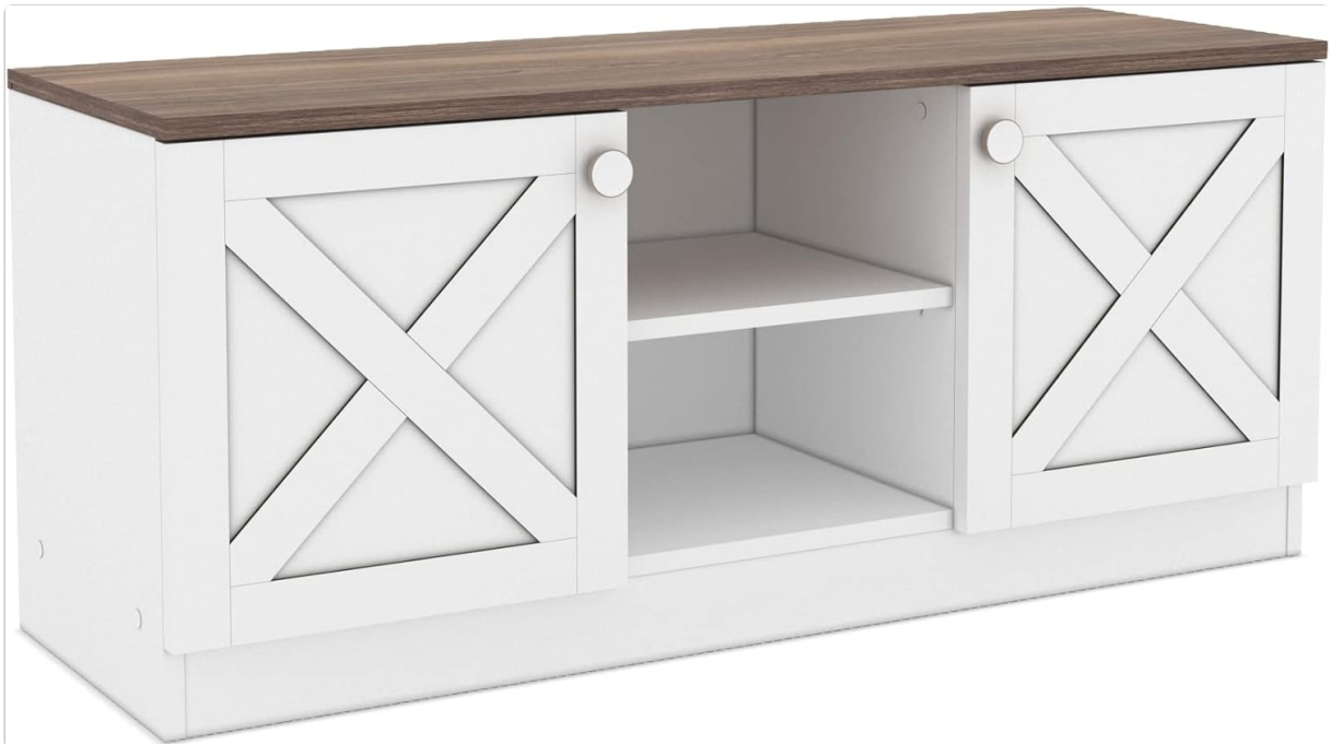
Image 1.1: The Generic Costal Wood Base 2 Cupboards Vintage TV Stand, featuring a white base with two X-pattern cupboard doors and a contrasting wood-finish top.

Thank you for purchasing the Generic Costal Wood Base 2 Cupboards Vintage TV Stand. This manual provides essential information for the safe assembly, operation, and maintenance of your new TV stand. Please read these instructions carefully before beginning assembly and retain them for future reference.