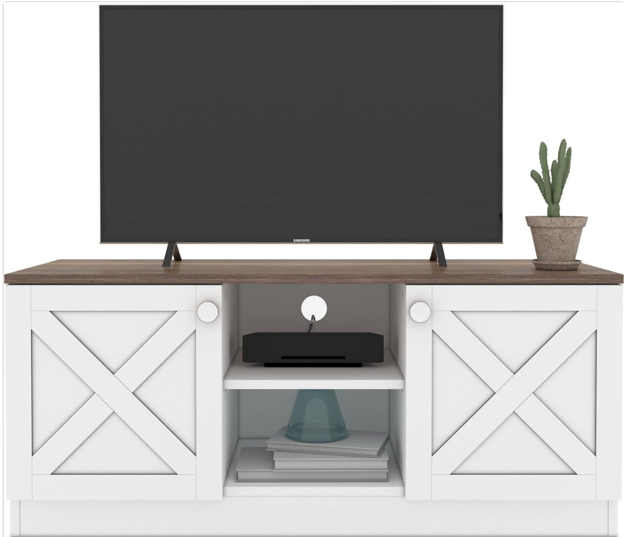
Image 4.1: The TV stand in use, displaying a television on top and media devices on the central shelves, with decorative items.

Carefully place your television on the top surface of the stand. Ensure the TV's base is fully supported and does not overhang the edges. Utilize the open central shelves for media devices such as cable boxes, gaming consoles, or soundbars. The rear panel includes a cutout for cable management.