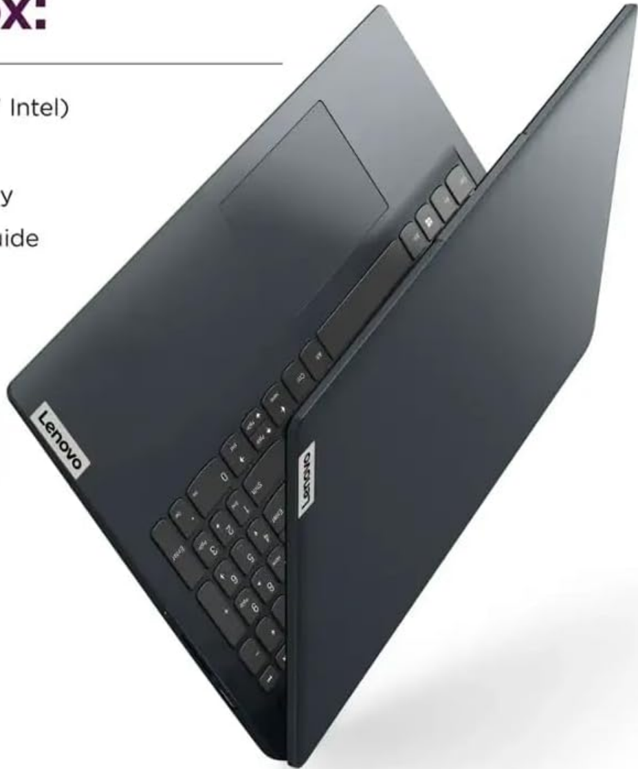
Image: The contents of the product box, including the Lenovo IdeaPad laptop, AC adapter, and a quick start guide.