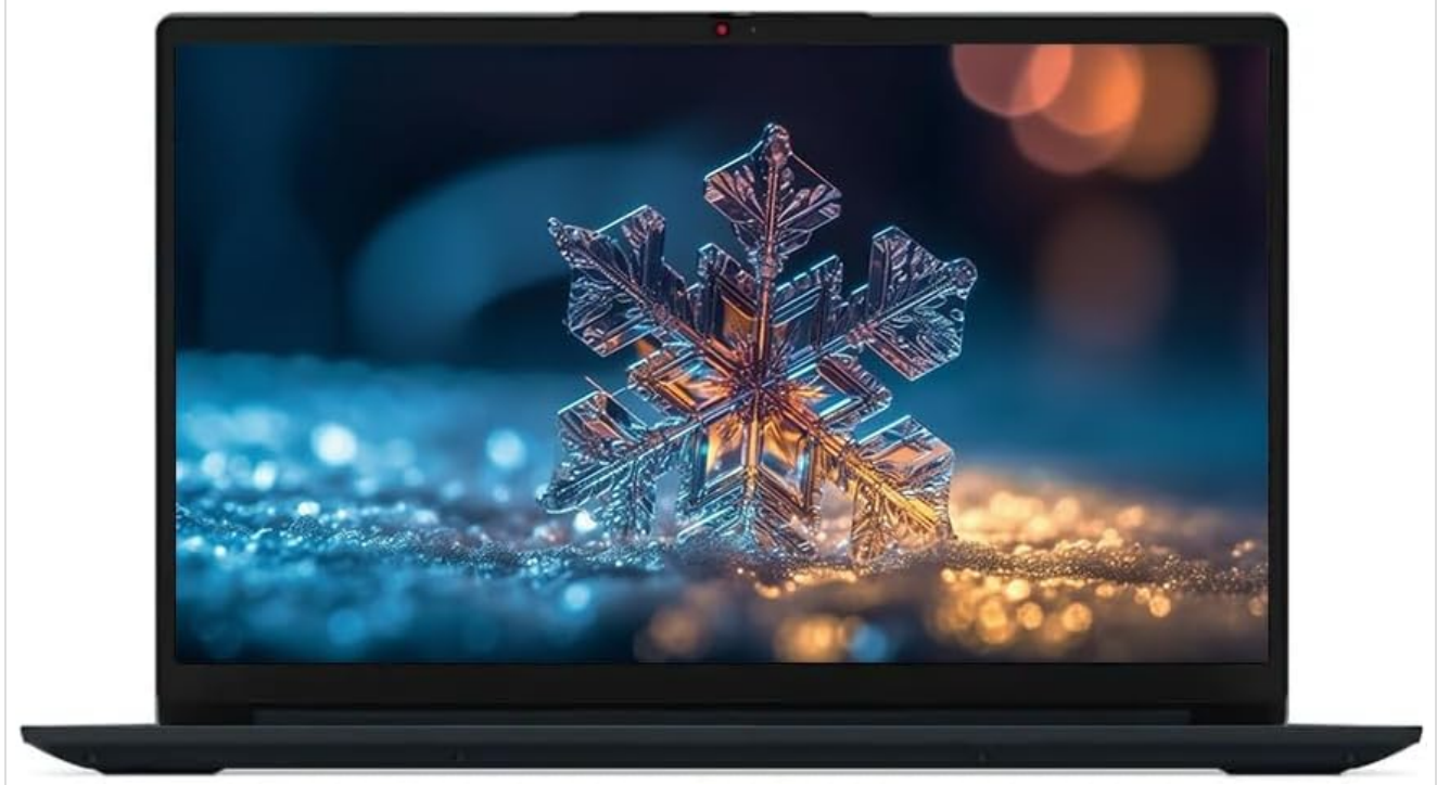
Image: Close-up of the laptop screen, highlighting the 15.6" HD display with narrow bezels and the Dolby Audio feature.

Immersive sound places you at the heart of the action with the two Dolby Audio™ speakers.