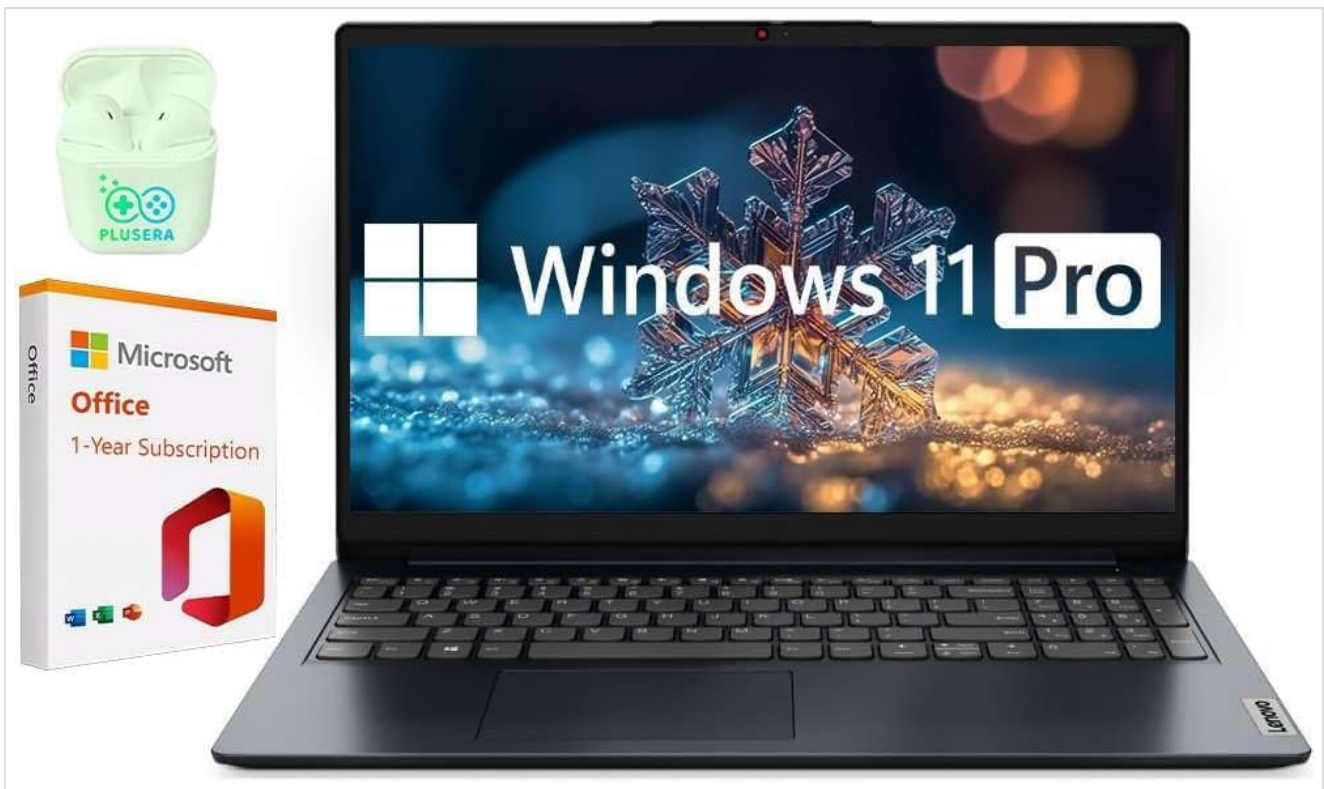
Image: Front view of the Lenovo IdeaPad laptop, displaying the screen with Windows 11 Pro and Microsoft Office branding.