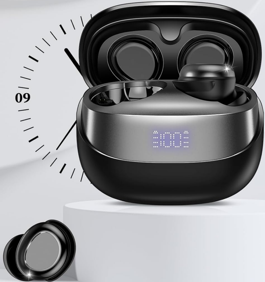
Image: The DUSONLAP SU8 charging case displaying its LED power indicator, alongside graphics detailing the 40-hour total battery life and USB-C fast charging.