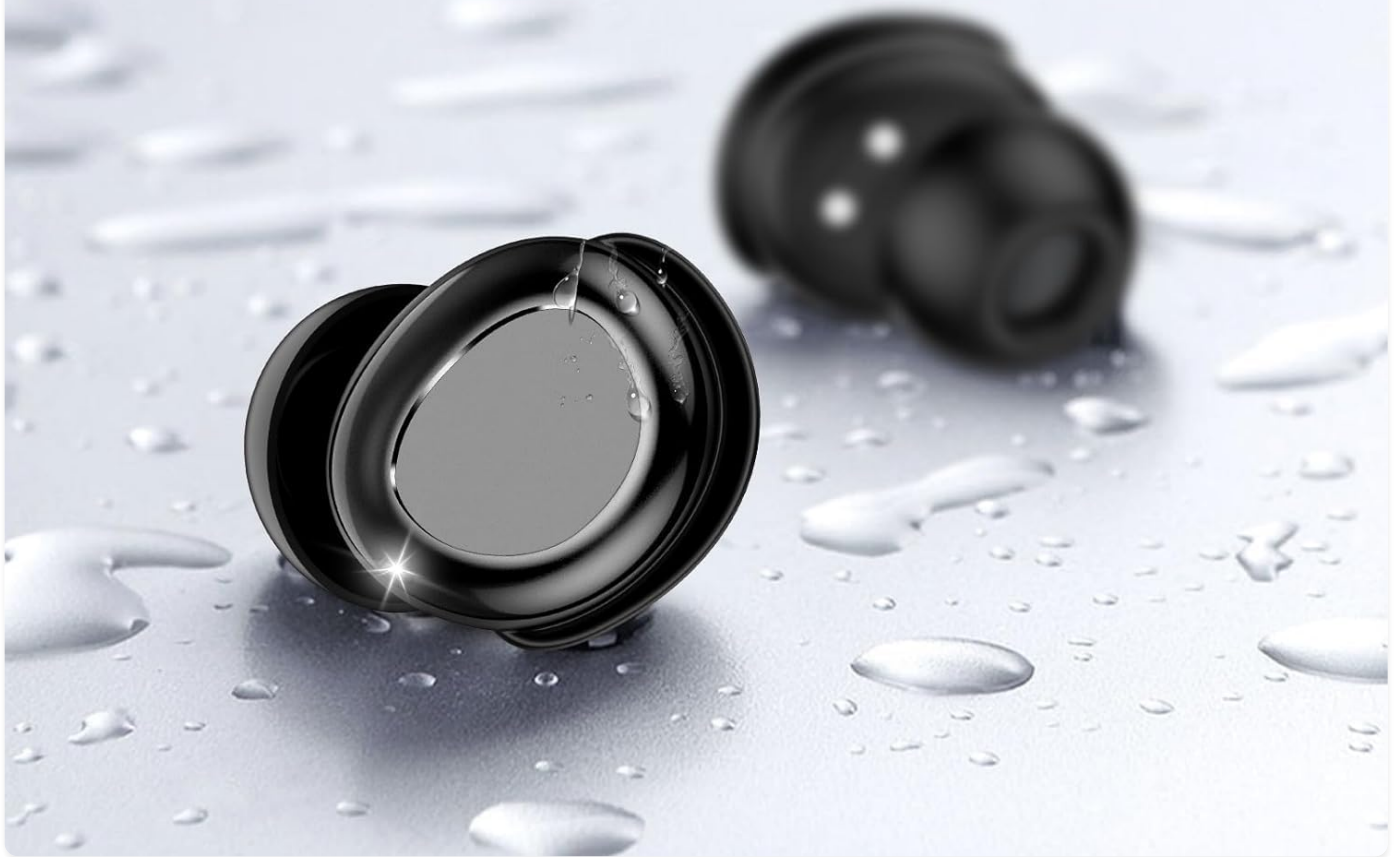
Image: The DUSONLAP SU8 Sleep Earbuds shown with water droplets, visually confirming their IPX7 waterproof rating against sweat, water, and light rain.