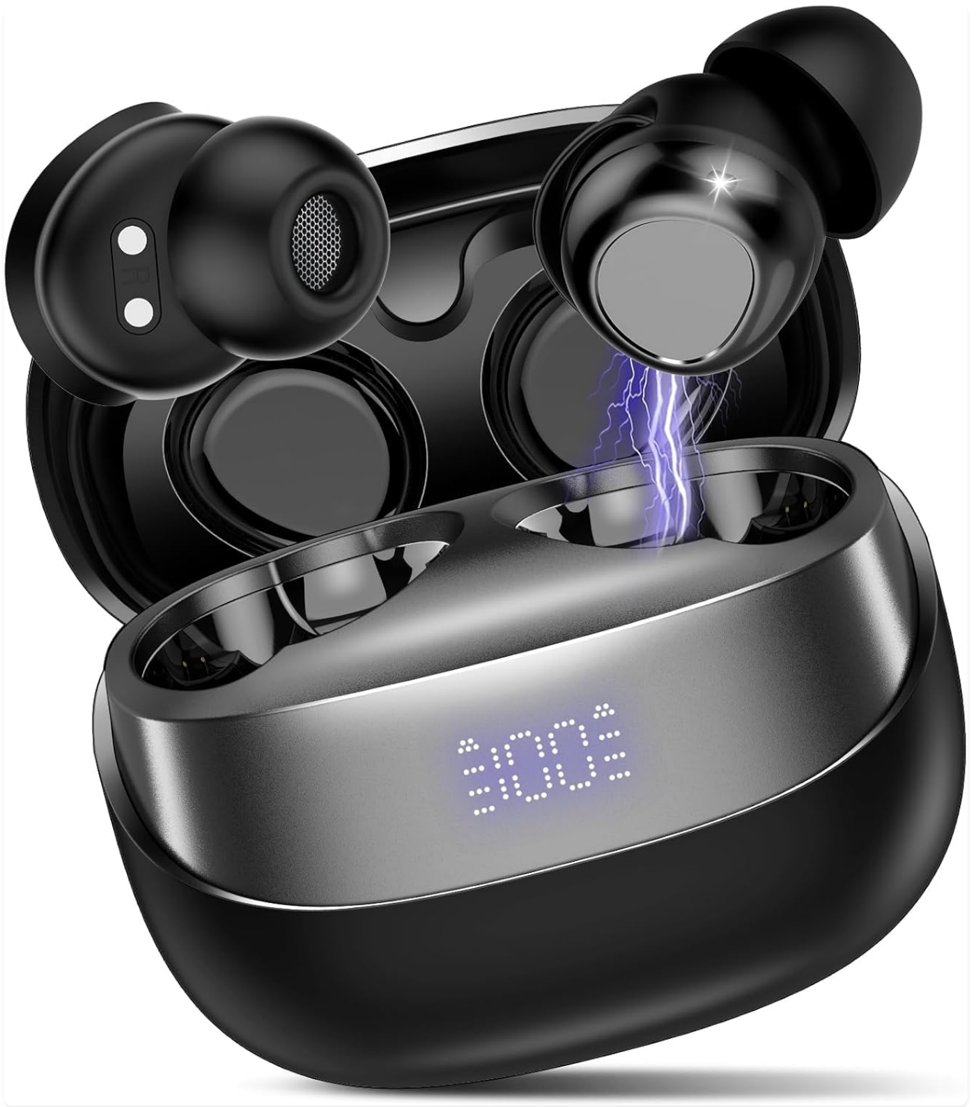
Image: The DUSONLAP SU8 Sleep Earbuds in their charging case, showcasing their compact design and digital display.