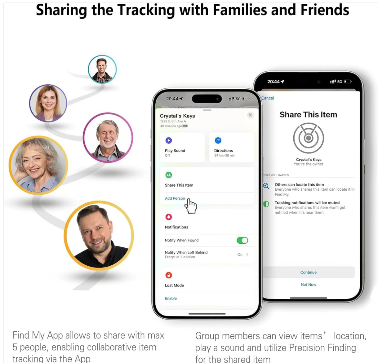
Image 6.2: Sharing the Wetag tracker's location with family and friends via the Find My app.