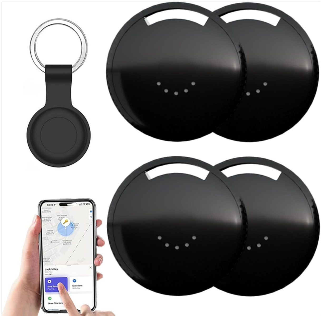
Image 3.1: Contents of the Wetag GPS Tracker package, showing multiple trackers and an iPhone displaying the tracking interface.