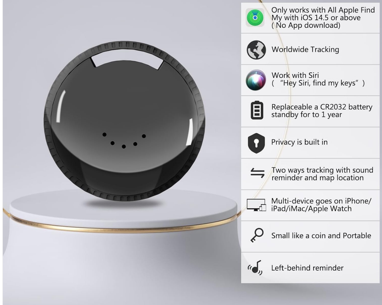
Image 4.1: Overview of the Wetag GPS Tracker's key features and design.