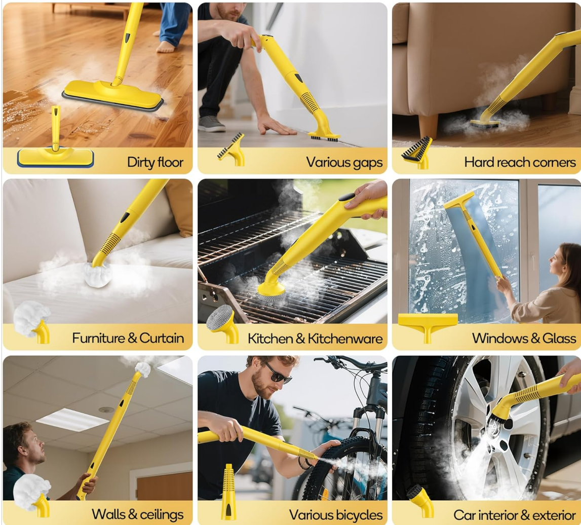
Image: Examples of the steam cleaner's versatility, showcasing different brush heads for cleaning floors, tight gaps, hard-to-reach corners, furniture, kitchenware, windows, walls, bicycles, and car interiors/exteriors.