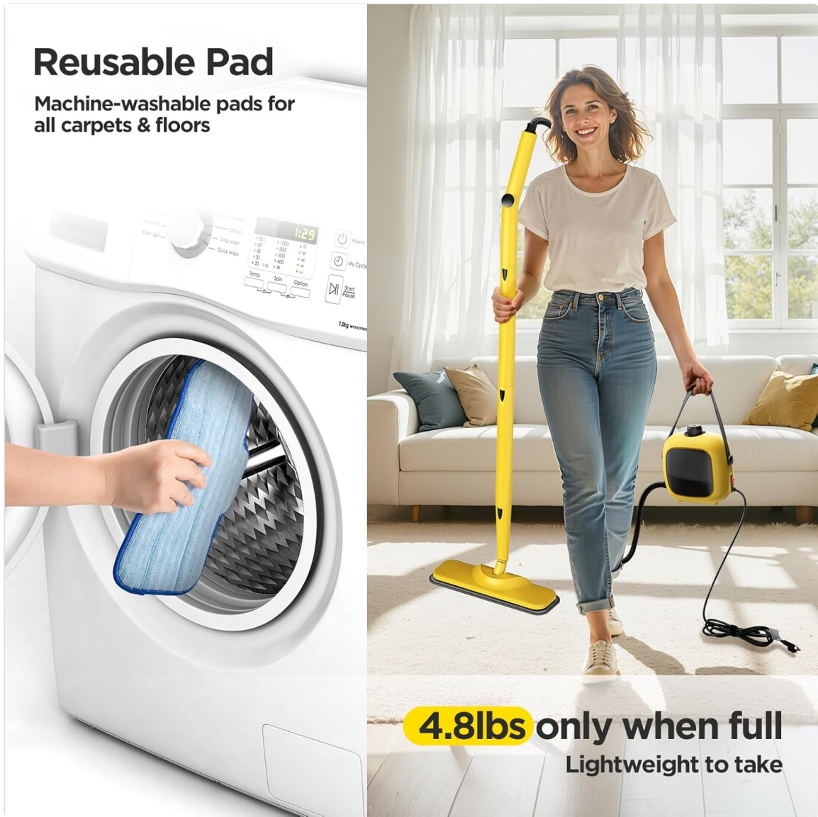
Image: Demonstrating the machine-washable reusable pads and the lightweight design of the steam cleaner.