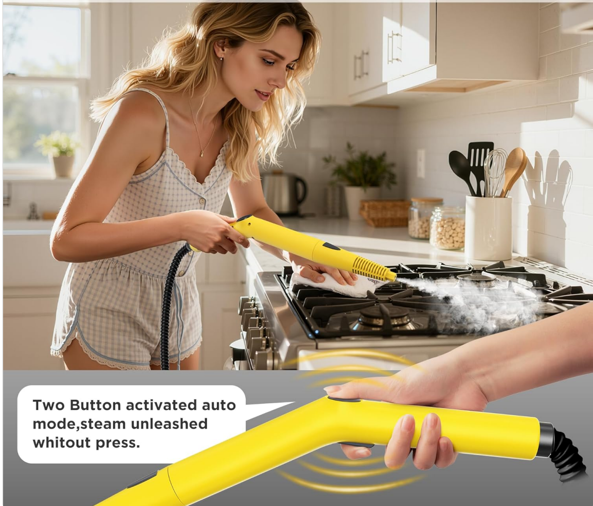
Image: Demonstrating the auto and safe modes, with a user cleaning a kitchen stove in handheld configuration.

select modes based on different scenarios