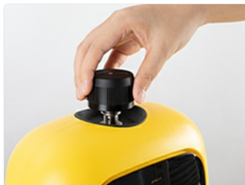
Image: Securing the water tank cap.