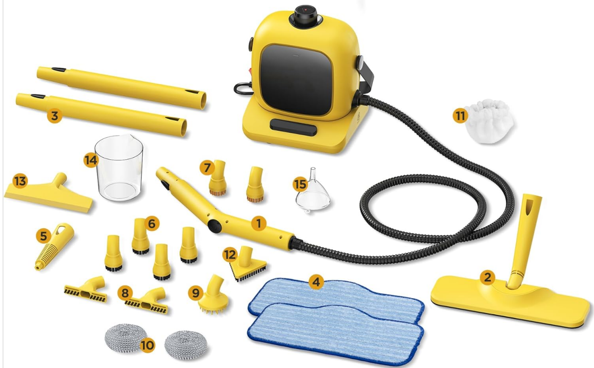
Image: The M Mistsince NV281A Steam Cleaner main unit and its complete 21-piece accessory kit, including various brushes, nozzles, mop pads, and measuring tools.