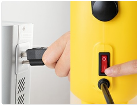
Image: Plugging in the power cord and turning on the power switch.