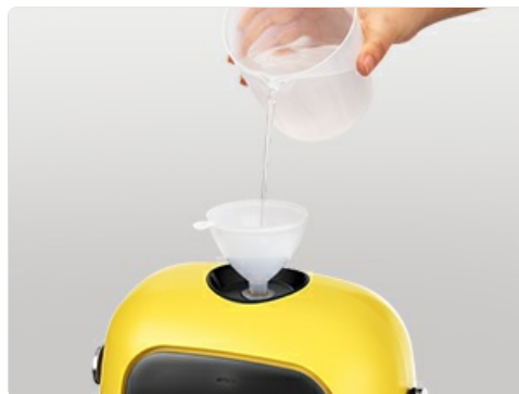
Image: Filling the water tank with the provided measuring cup and funnel.