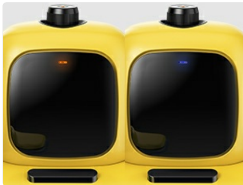
Image: The steam cleaner's indicator lights, showing orange for heating and blue for ready.