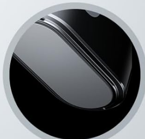
Base Anti-Slip Pad