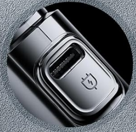
Type C Charge