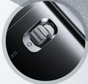
Safety Lock Design