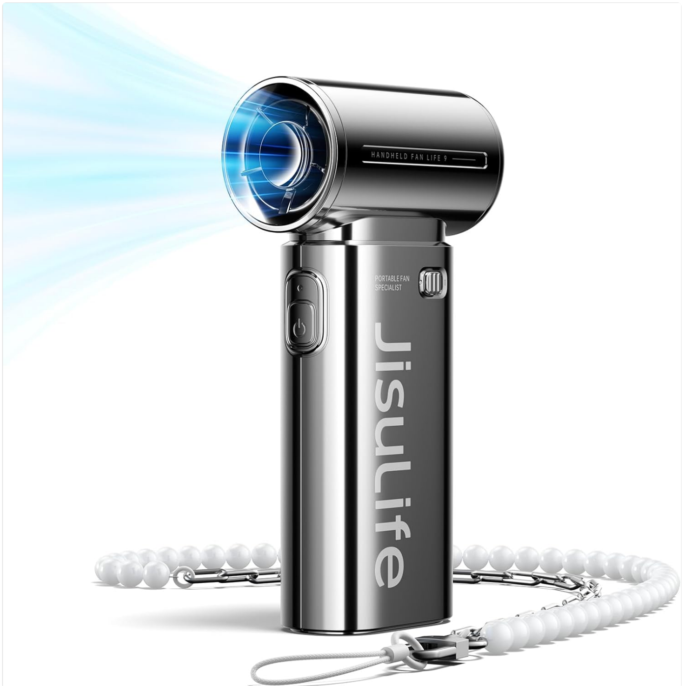
Image: The JISULIFE Life9 handheld fan in Chrome, illustrating its powerful airflow.