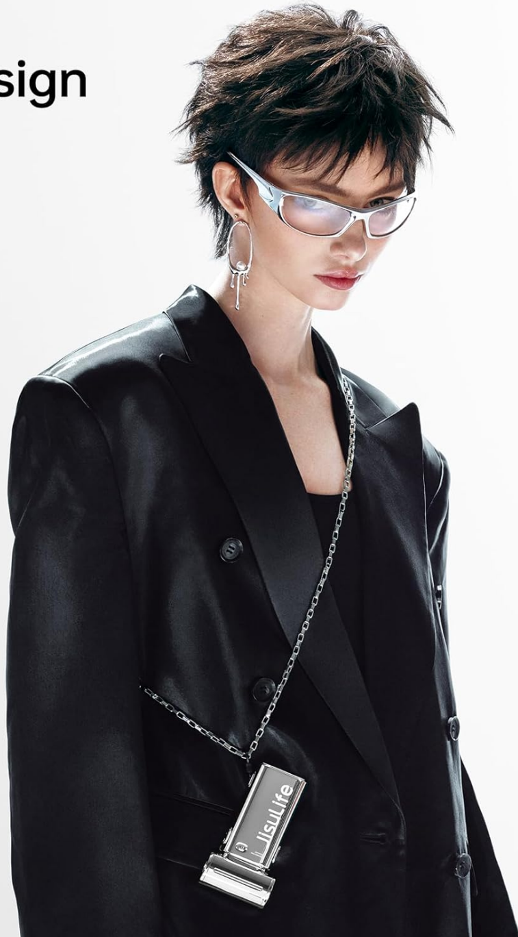
Image: A person demonstrating the use of the fan with the attached lanyard for easy portability.

The product lanyard is only for photography effect display. Please refer to the actual item.