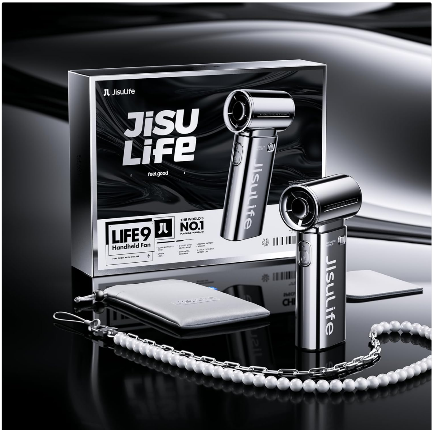
Image: The JISULIFE Life9 fan, its packaging, and the included lanyard and charging cable.