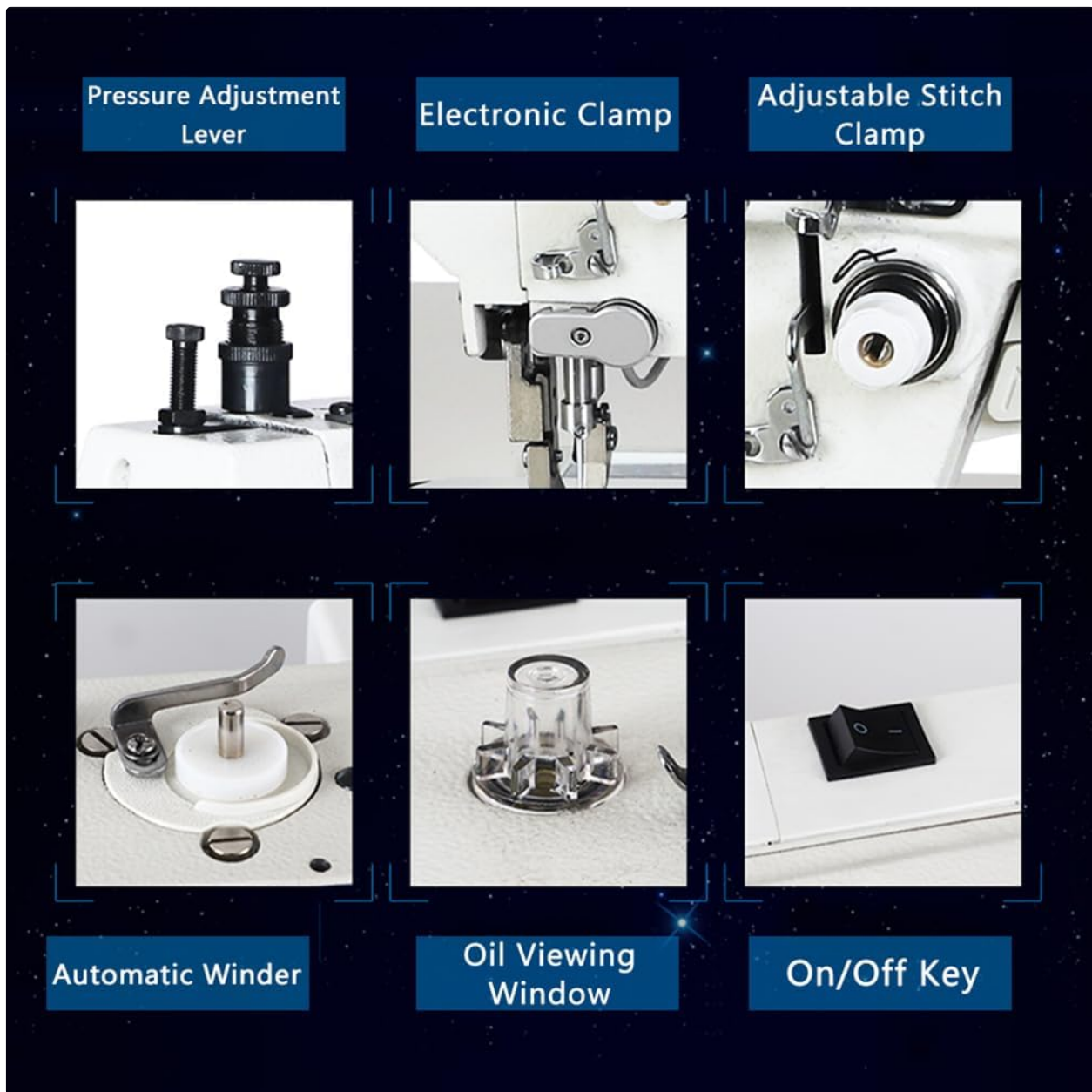
Figure 4: Key adjustment and control components.