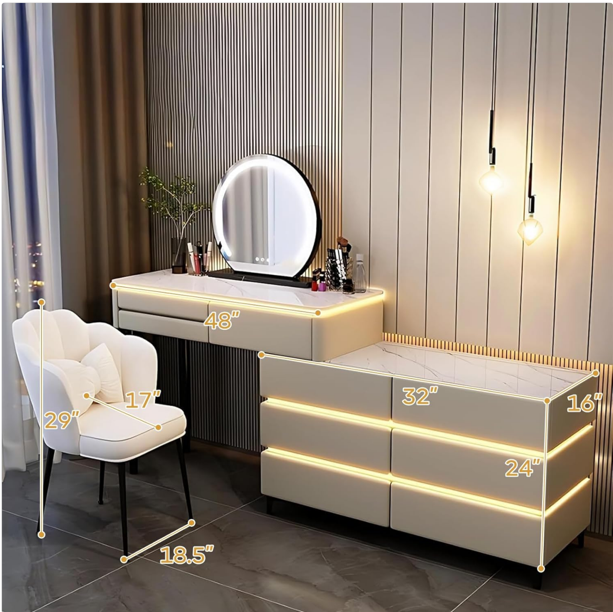
Image 6.1: Visual representation of the vanity desk and chair dimensions.