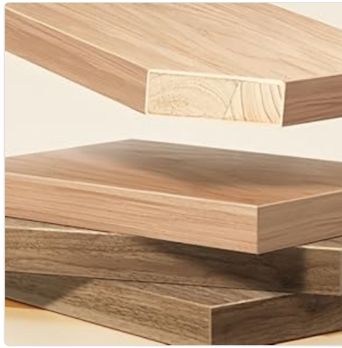
Image 4.2: Example of the solid wood construction used in the vanity desk frame.