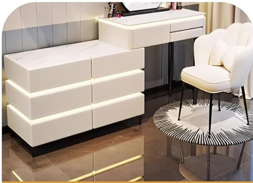
side cabinet left

Left and right swaps. Freedom of expansion and contraction