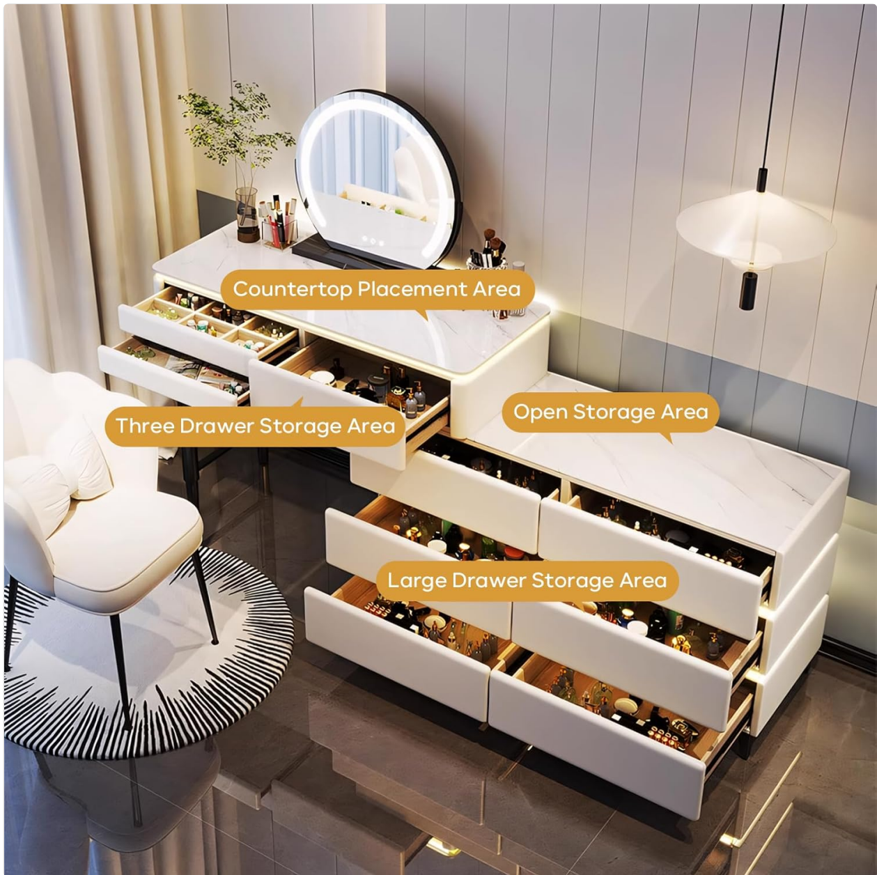
Image 3.3: Various storage compartments, including countertop, three-drawer, open, and large drawer areas.