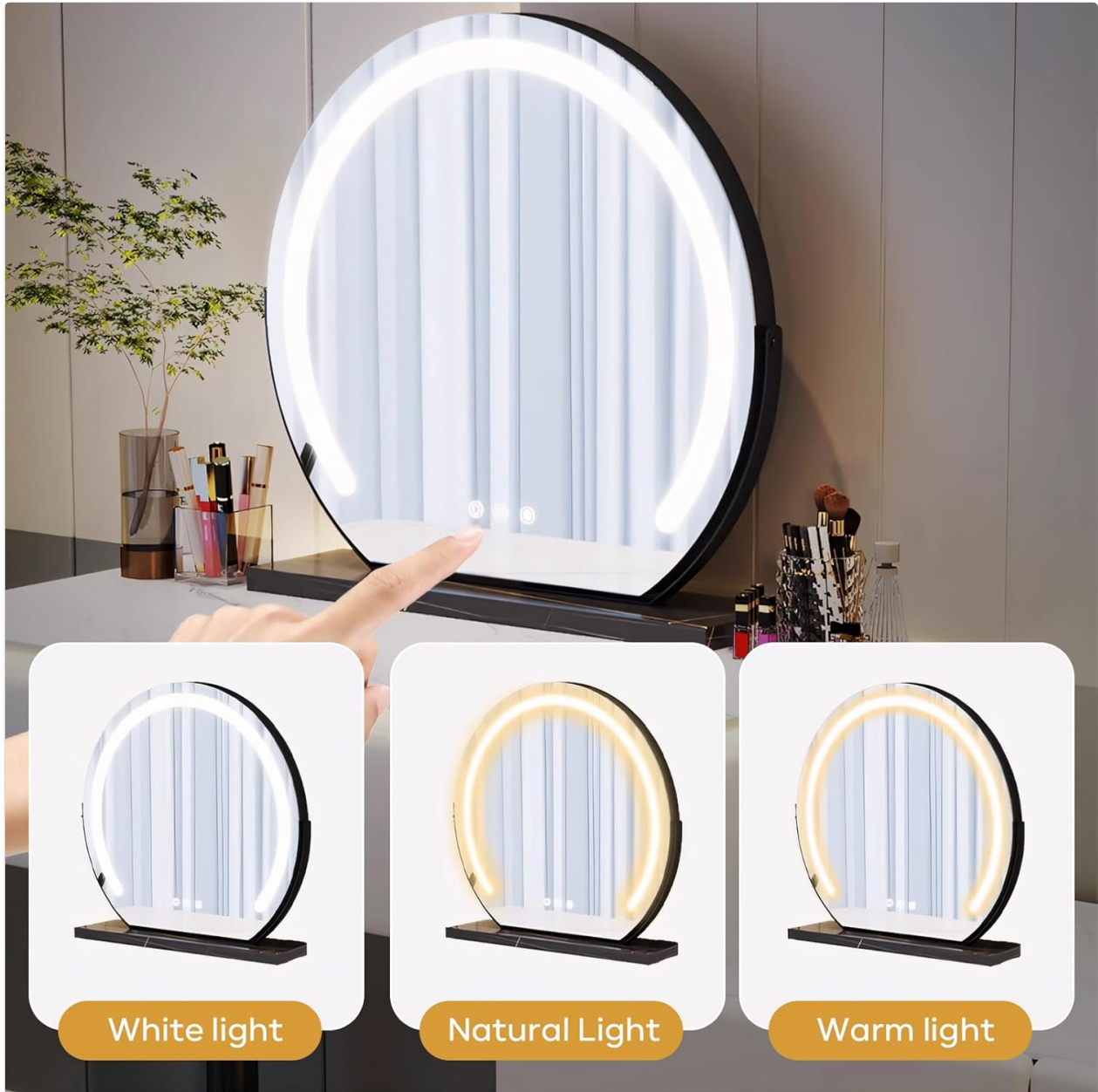
Image 3.1: The smart mirror's touch controls allow switching between White light, Natural Light, and Warm light settings.