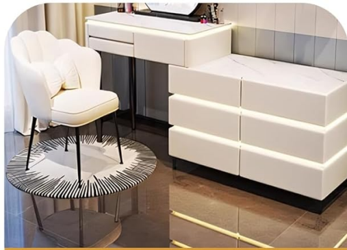
side cabinet to the right

Image 2.1: Illustration of the flexible installation, demonstrating how the side cabinet can be swapped between the left and right sides of the vanity desk.