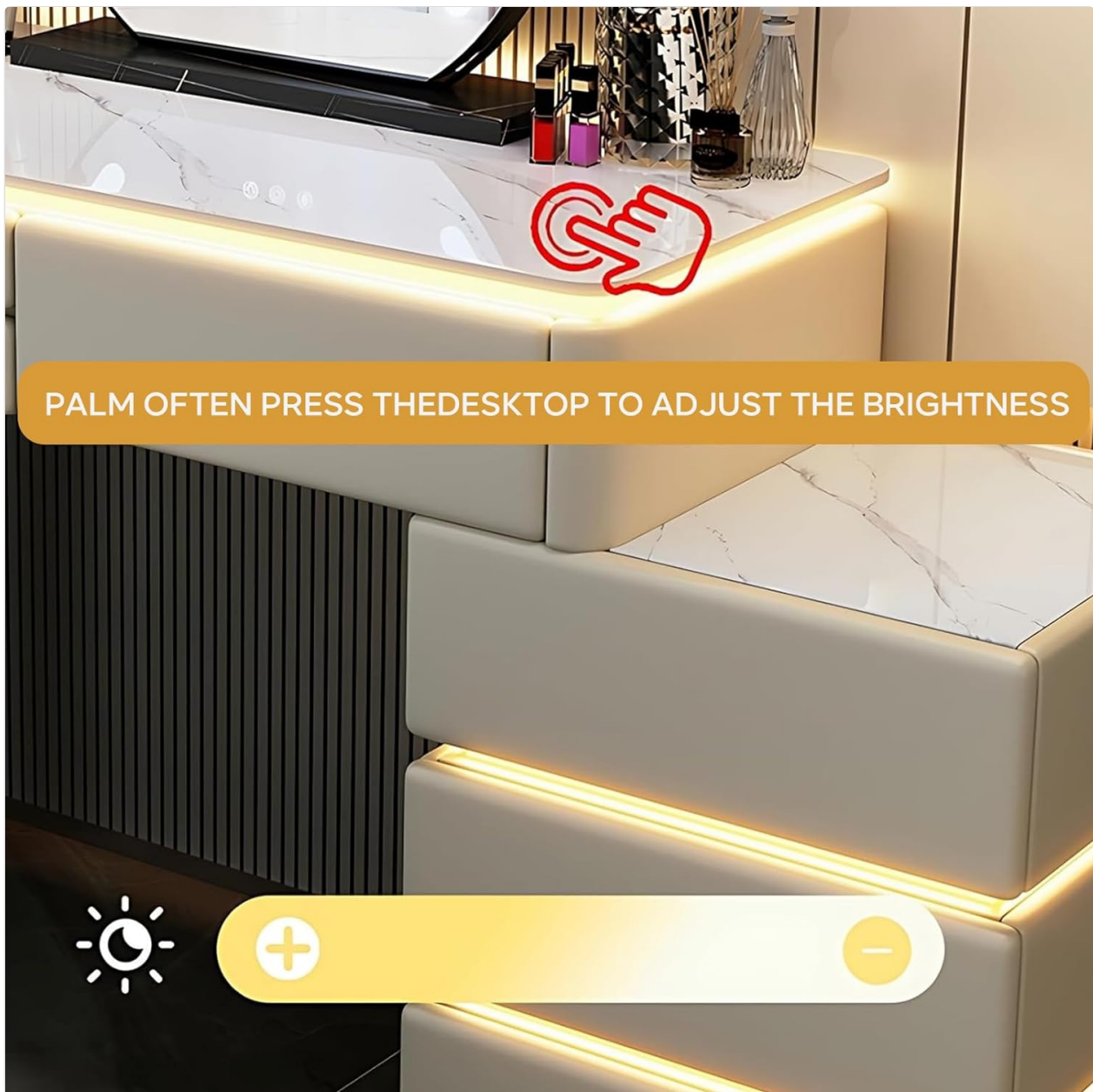
Image 3.2: Adjusting the brightness of the LED ambient light by pressing the desktop surface.