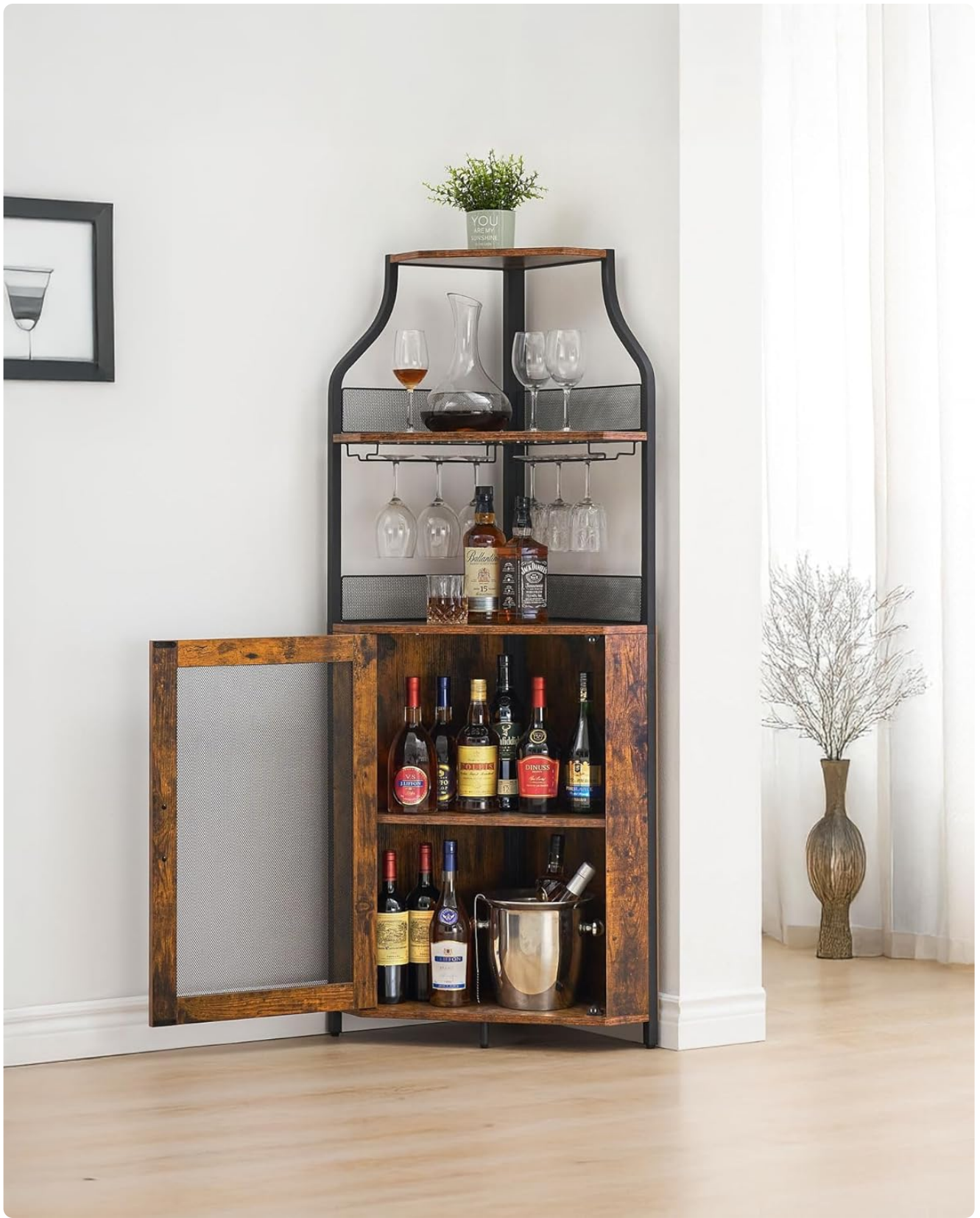
The cabinet is shown with its mesh-fronted lower door open, illustrating the internal storage compartments suitable for larger bottles and accessories.