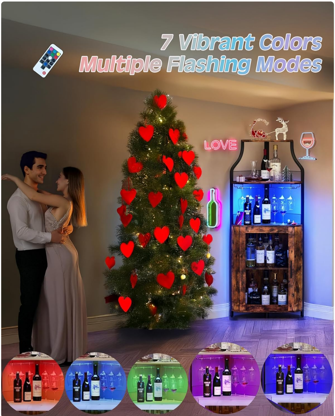
This image demonstrates the LED lighting feature, showing various color settings and how they can change the ambiance of the cabinet and the surrounding space.