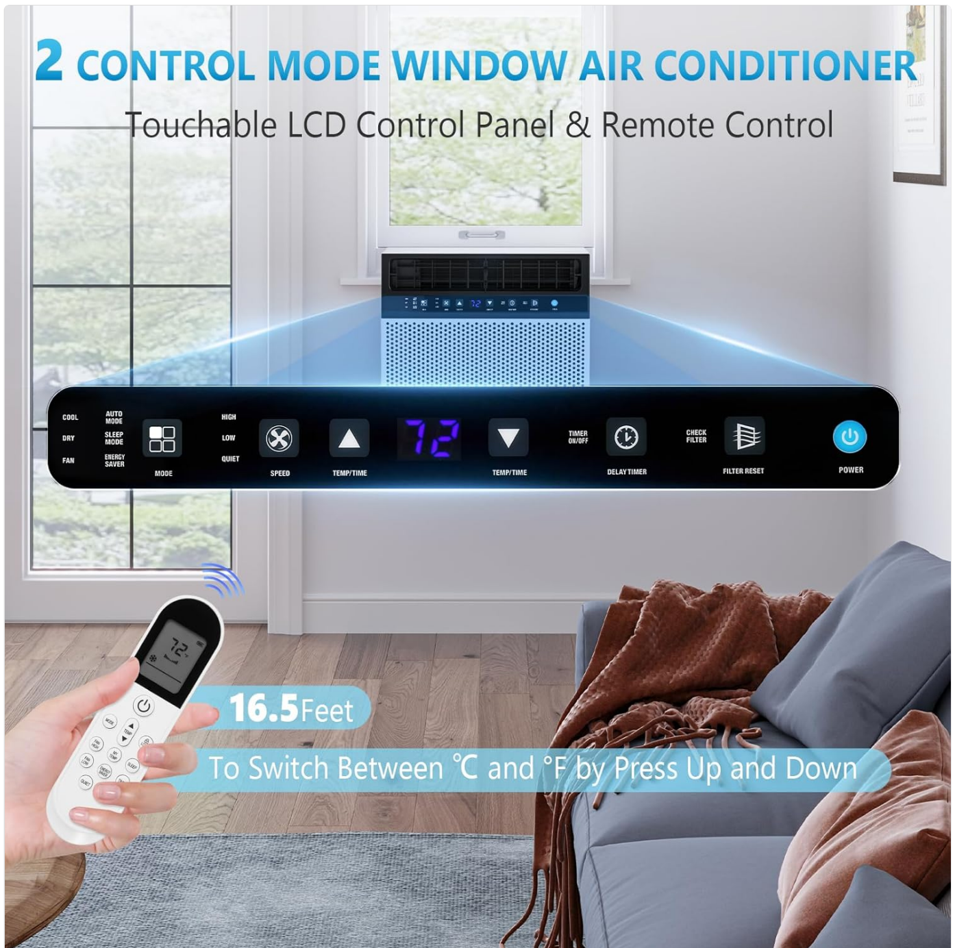
Image: Close-up view of the air conditioner's LED touch control panel and the remote control, highlighting the various buttons and display.

Touchable LCD Control Panel & Remote Control