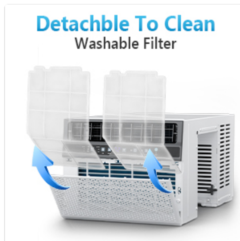
Image: A close-up of the air conditioner's front panel, showing the detachable and washable air filter being removed for cleaning.

The "Clean Filter Indicator Light" will illuminate when the air filter needs cleaning. The filter is detachable and washable for easy maintenance. Rinse it under water every few weeks to maintain optimal performance and air quality.