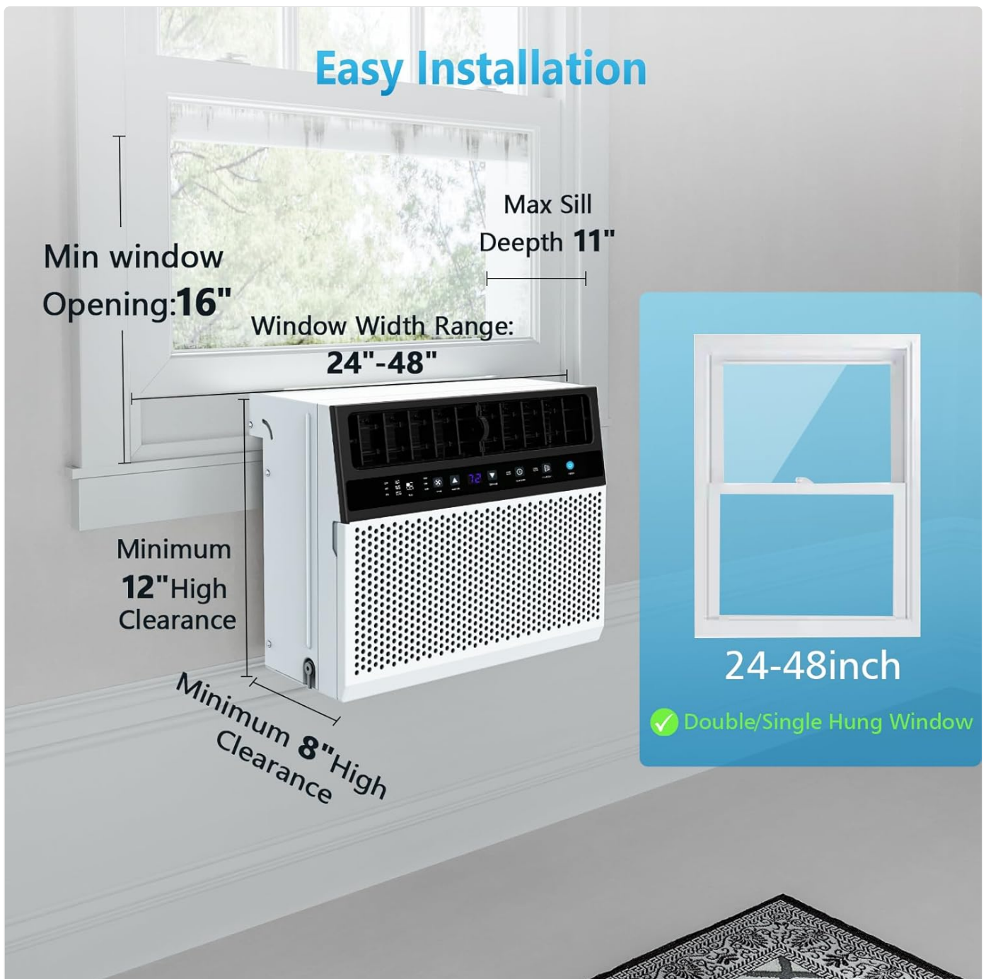
Image: Detailed diagram illustrating the required window dimensions for proper installation of the air conditioner.