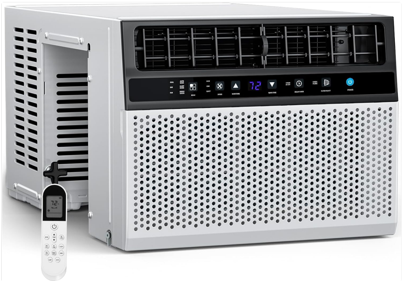
Image: The COWSAR 12000 BTU Window Room Air Conditioner, showcasing its compact design and window installation.